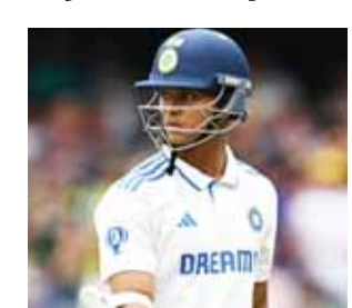
"The selectors are expected to announce the squad on January 20, during which they will follow the due process of checking for the availability of every player. Rohit will also be approached around the time for selection," a Mumbai Cricket Association (MCA) official told PTI. The 37-year-old is looking to put an end to his poor run with the bat after he managed a mere 31 runs in three Tests that he played against Australia in the Border-Gavaskar Trophy.

PTI ■ MUMBAI India opener Yashasvi Jaiswal on Wednesday joined the Mumbai camp after confirming his availability for the next round of Ranji Trophy but skipper Rohit Sharma was not to be seen after turning up for a couple of practice on the opening day of training. Rohit, who batted alongside Mumbai captain Ajinkya Rahane on Tuesday here at the Wankhede Stadium, is expected to resume training in a day or two. However, it remains to be seen if the incumbent Indian skipper would play in the domestic giant's next Ranji Trophy fixture. Rohit is yet to confirm his availability for the Elite Group A contest against Jammu and Kashmir starting on January 23 but so far, no formal discussions have been taken place.