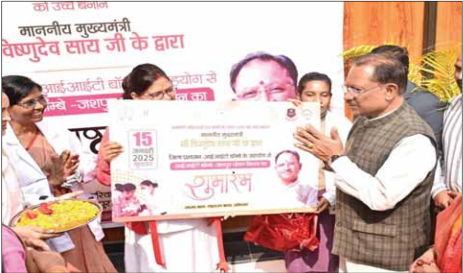
The Health and the Women and Child Development Departments will jointly run the campaign. More than 9,500 health and Anganwadi workers have been trained for this through an online programme of the IIT Bombay. Ensuring the good health of mothers and children of the state was the top priority of Chhattisgarh, Sai said. Their good health will be the backbone of the progress and prosperity of the state, he said.

Emphasis will be laid on breastfeeding, nutritional, and supplementary diets. Pregnant mothers will be educated about ideal nutrition for the physical and mental well-being of their children.