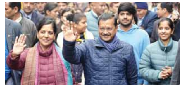
AAP National Convener Arvind Kejriwal file his nomination for Delhi Assembly polls