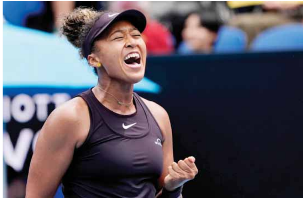
getting her game back together, including a memorable and narrow loss to then-No. 1 Iga Swiatek at the French Open. This, though, followed a win against 2022 U.S. Open semifinalist Caroline Garcia in Melbourne and meant the progress is real. "It definitely was something that is a goal of mine, especially after last year; I wasn't able to beat a seed in a Grand Slam," Osaka