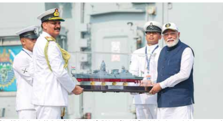
Prime Minister Narendra Modi with Chief of the Naval Staff Admiral Dinesh K. Tripathi during the commissioning ceremony of three Indian Navy warships INS Surat, INS Nilgiri and INS Vaghsheer, at the Naval Dockyard in Mumbai