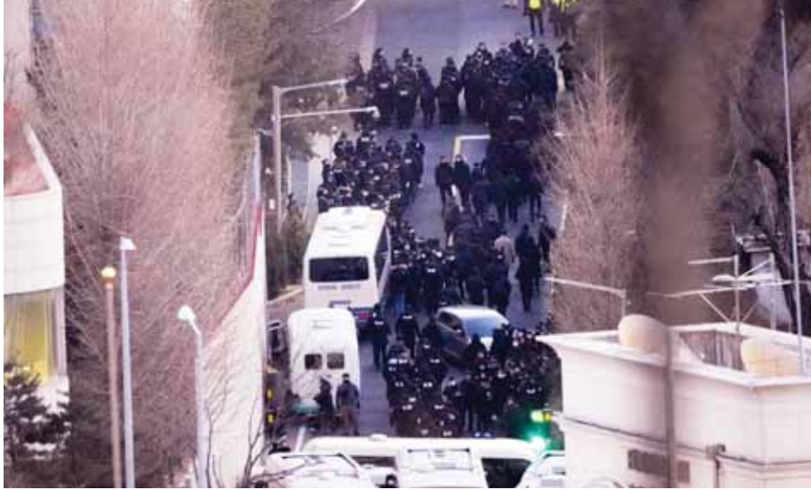
Investigators from the state anti-corruption agency and police officers make their way to the residence of impeached President Yoon Suk Yeol to execute a warrant to detain Yoon in Seoul, South Korea on Wednesday.

of martial law December 3 as a legitimate act of governance against an "anti-state" opposition employing its legislative majority to thwart his agenda. The Corruption Investigation Office for High-Ranking Officials said Yoon was brought into custody about five hours after investigators arrived at the presidential compound and about three hours after they successfully entered the residence, in their second attempt to detain him over his imposition of martial law. A series of black SUVs, some equipped with sirens, were seen leaving the presidential compound with police escorts. Yoon was later seen stepping out of a vehicle after arriving at the agency's office in the nearby city of Gwacheon. Hundreds of Yoon's conservative supporters rallied near the anti-corruption agency's office as he underwent questioning, shouting slogans and holding signs that read: "We will fight alongside President Yoon Suk Yeol." Also on Wednesday, an unidentified man was in life-threatening condition after an apparent self-immolation near the site, according to the Gyeonggi provincial fire