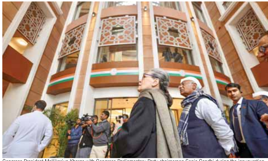
Congress President Mallikarjun Kharge with Congress Parliamentary Party chairperson Sonia Gandhi during the inauguration of the new All India Congress Committee (AICC) headquarters 'Indira Bhawan', in New Delhi

that grand old party is fighting the BJP, the RSS and the Indian State itself. Sharing a video clip of Rahul's remarks, BJP IT department head Amit Malviya said, "Rahul Gandhi has now declared an open war against the Indian State itself. This is straight out of George Soros's playbook." The BJP president charged that the Congress has a history of encouraging all those forces who want a weak India. "Their greed for power meant compromising the nation's integrity and betraying the trust of the people," Nadda said, adding, people of India are wise, and they have decided they will always reject Rahul Gandhi and his rotten ideology. At a press conference, BJP spokesperson Gaurav Bhatia said Rahul Gandhi had taken oath to preserve the country's sovereignty and integrity but is now speaking fighting the Indian state.