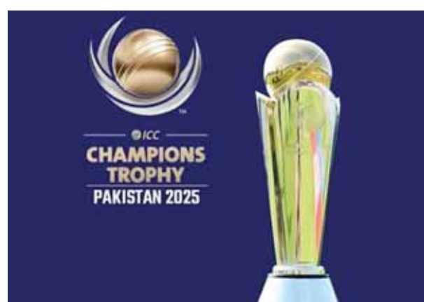
who will come here for pre-tournament events. "This obviously includes Rohit or any other Indian team player or official or board official," he added. Another source confirmed to PTI that the PCB has made it clear to the ICC that the opening ceremony, featuring all teams and their captains, will take place in Pakistan. "This is in line with the usual protocols and since the opening match is on 19th the

PTI ■ LAHORE The opening ceremony of the Champions Trophy will be held either on February 16 or 17 and the Pakistan Cricket Board (PCB) is confident that India captain Rohit Sharma will be in attendance at the event. The PCB source also said that it is awaiting communication from the ICC on the schedule of the customary captains' photo-shoot and the pre-event press conference. The eight-team tournament will get underway on February 19 in Karachi. However, India will play all their matches in Dubai, starting with the clash against Bangladesh on February 20, after refusing to travel to Pakistan owing to security concerns. The source said PCB has procured all relevant clearances from its government to promptly issue visas to all captains, players and team officials