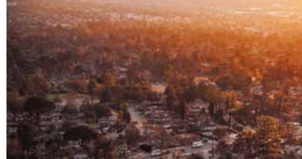
Trucks drive through a neighborhood destroyed by the Eaton Fire, Tuesday, in Altadena, Calif.

Easing winds delivered a brief but much-needed reprieve to firefighters Tuesday as they battled two massive blazes burning in the Los Angeles area, and the National Weather Service pushed back its unusually dire warning of critical fire weather until early the following day. Forecasters said the winds were below danger levels in the evening, but they were expected to strengthen overnight with potentially fire-fuelling gusts. Red flag warnings remained in effect from Central California to the Mexican border until late