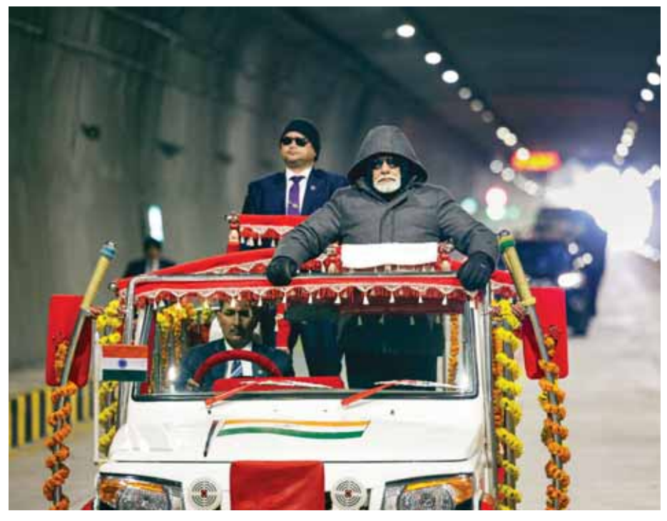
Prime Minister Narendra Modi during the inauguration of the Z-Morh tunnel.