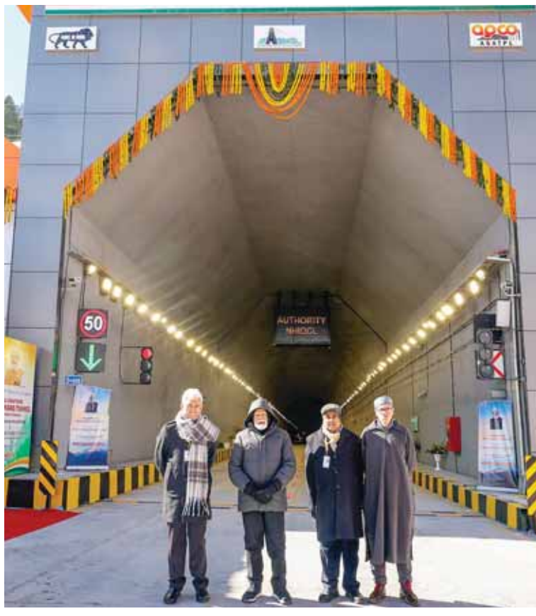
Prime Minister Narendra Modi with Union Minister for Road Transport and Highways Nitin Gadkari, J&K Lt. Governor Manoj Sinha and Chief Minister Omar Abdullah during the inauguration of the Z-Morh tunnel.

the pipeline across Jammu and Kashmir. After inaugurating the Rs 2,700 crore project, the prime minister went inside the tunnel and interacted with the project officials. He also met the construction workers who worked meticulously amid harsh conditions to complete the tunnel. Announcing the inauguration of the Sonamarg Tunnel the Prime Minister highlighted that this tunnel will significantly ease the lives of people in Sonamarg, Kargil, and Leh. The 6.5-km-long two-lane bi-directional road tunnel between Gagangir and Sonamarg in central Kashmir's Ganderbal district is equipped with a parallel 7.5-metre escape passage for emergencies. Situated at an altitude of over 8,650 feet above sea level, the tunnel will enhance all-weather connectivity between Srinagar and Sonamarg en route to Leh, bypassing routes prone to landslides and avalanches. It will also promote tourism by