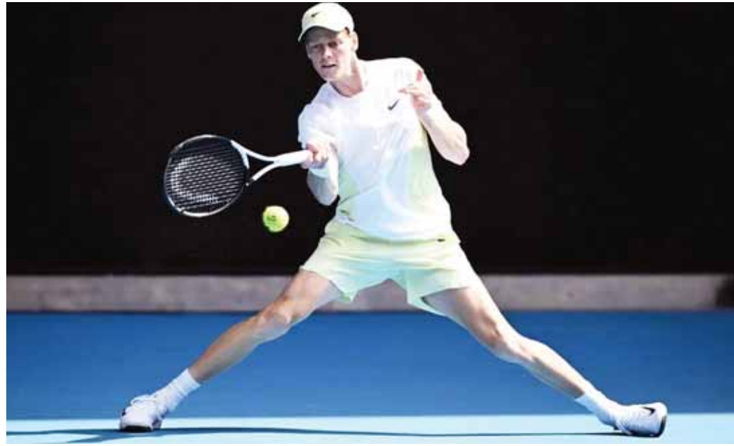
first marquee match and dropped an early service game before quickly settling into a rhythm in a 6-3, 6-3 win over 2020 champion Sofia Kenin. Third-seeded Gauff beat Swiatek to win the title at the WTA Finals last November and started this season by helping the U.S. To

for two long, tiebreak sets against No. 35-ranked Jarry, a 29-year-old from Chile, before finding his touch. "It was a very close one because the first sets, they can go both ways," Sinner said. "In the third set when I broke it the first time, that gave me a little bit of room to breathe. "I'm happy how I handled the very tough situation." Sinner has got a good record at Melbourne Park in that department. He rallied from two sets down in last year's final to beat Daniil Medvedev for his first Grand Slam title, coming off a semifinal upset of 10-time champion Novak Djokovic. While Sinner was deep into his match against Jarry, Swiatek, a five-time major winner from Poland, fended off top-ranked doubles player Katerina Siniakova 6-3, 6-4 on John Cain Arena. Coco Gauff had a little difficulty adjusting to the sun at one end of Rod Laver Arena in Monday's