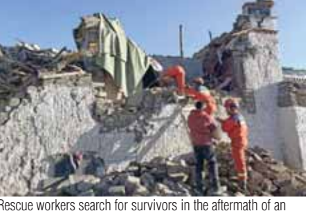
earthquake in Changsuo Township of Dingri in Xigaze, southwestern China's Tibet Autonomous Region

Xi ordered utmost efforts to treat the injured and urged efforts to prevent secondary