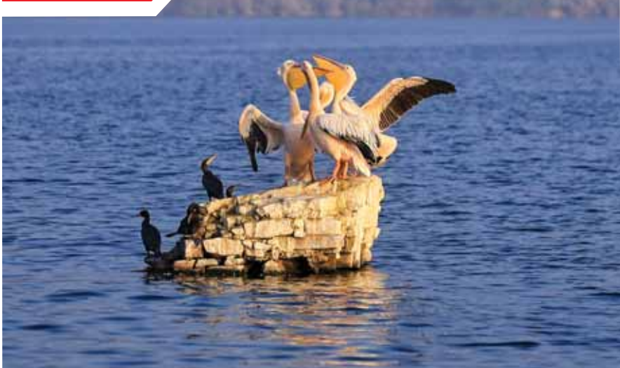
Flocks of pelicans and cormorants congregate at Man Sagar Lake, in Jaipur