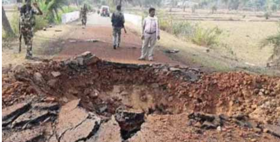
A scene of the blast site.

SPECIAL CORRESPONDENT ■ BIJAPUR Fighting for survival in their forested hideouts in Bastar as security forces have launched a series of deadly attacks against armed insurgents, Maoists hit back today as they blew up a vehicle carrying District Reserve Guard (DRG) and Bastar Fighters jawans in a forested patch of Bijapur. Chhattisgarh government said that four DRG jawans and four Bastar Fighters men besides the vehicle driver were martyred in the powerful IED blast. The incident has been described a total failure of intelligence. The DRG and Bastar Fighters are the units of Chhattisgarh Police. The killing has triggered widespread anger against Maoists in the state and the government vowed to further step up anti-