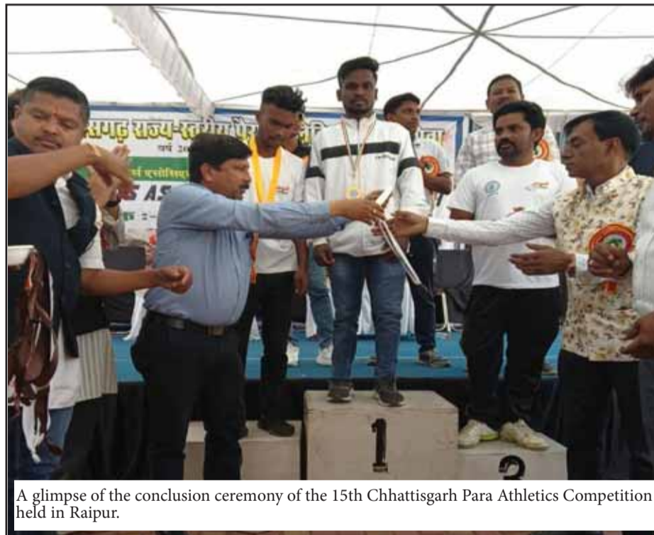
A glimpse of the conclusion ceremony of the 15th Chhattisgarh Para Athletics Competition held in Raipur.