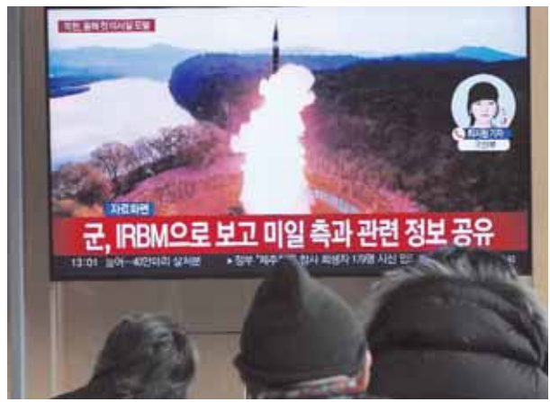
A TV screen shows a file image of North Korea's missile launch during a news program at Seoul Railway Station in Seoul on Monday.

North Korea on Monday fired a ballistic missile that flew 1,100 kilometers (685 miles) before landing in waters between the Korean Peninsula and Japan, South Korea's military said, extending its heightened weapons testing activities into 2025 weeks before Donald Trump returns as US president. The South's Joint Chiefs of Staff said the midrange missile was fired from an area near the North Korean capital of Pyongyang and that the launch preparations were detected in advance by the US and South Korean militaries. It denounced the launch as a provocation that poses a serious threat to peace and stability on the Korean Peninsula. The joint chiefs said the military was strengthening its surveillance and defense posture in preparation for possible additional launches and sharing information on the missile with the United States and Japan. Japan's Defence Ministry said the missile landed outside its exclusive economic zone and that there were no reports of