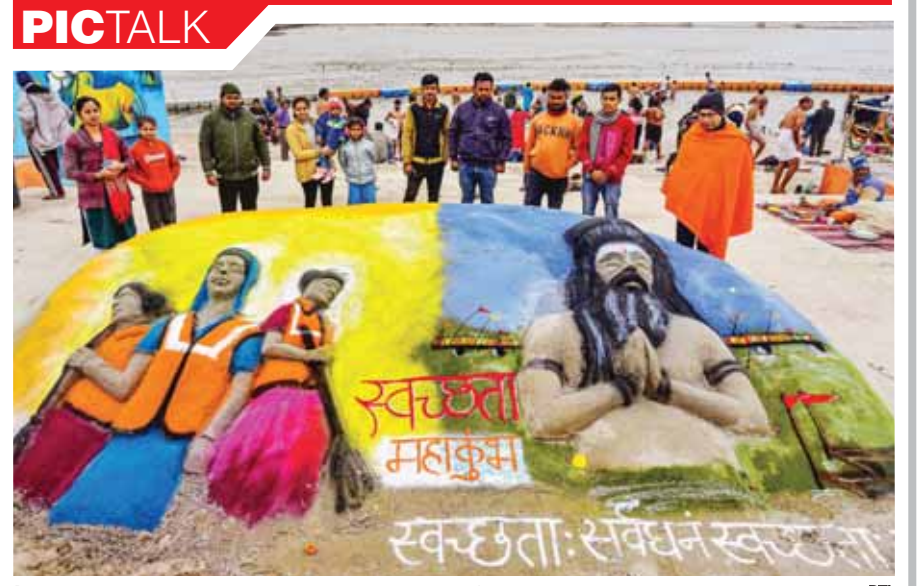
Devotees look at a sand sculpture themed on 'clean Mahakumbh' ahead of Mahakumbh 2025, in Prayagraj

Wishing all our readers a very happy new year!