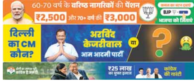
In the last 30 days: BJP spent ₹2.5Cr, followed by the AAP (₹77 Lakhs) and the Congress (₹23 Lakh)

In the intense race to wrest power from Aam Admi Party (AAP), the Congress which ruled 15 years and BJP which has not been in Delhi politics for about three decades now and incumbent AAP looking forward to retain itself have gone for an aggressive campaign by making optimum use of the available social media platforms. Digital platform has become the primary battleground for political messaging, overshadowing traditional forms of campaigning for the February 5 Delhi assembly poll. An analysis conducted by The Pioneer highlights the increasing reliance on digital reach by these political parties, with the BJP leading the charge in terms of spending on platforms like Facebook,