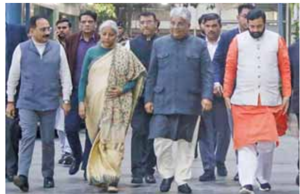
Union Ministers Nirmala Sitharaman, Bhupender Yadav, Haryana CM Nayab Saini and other BJP leaders after meeting the Election Commission of India.