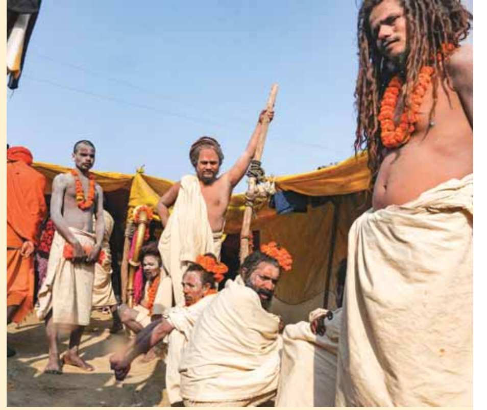
'Sadhus' at a camp during the Maha Kumbh Mela in Prayagraj on Tuesday