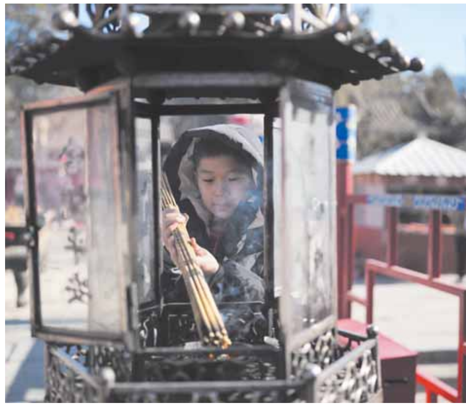
A boy lights incense inside Dongyue Temple ahead of Lunar New Year in Beijing on Tuesday.

Moscow's scorched-earth intervention in support of Assad once turned the tide of Syria's civil war. Syria's new authorities have not cut off relations with Moscow or forced a complete exit of Russian military forces from bases in Syria, but earlier this month, Al Watan reported that a contract with a Russian company to manage the port in Tartous had been cancelled. Following Assad's downfall, Russia relocated its troops and assets from all over Syria to its main hub at the Hmeimim air base near Latakia. There has been no indication that Moscow was preparing to evacuate the Hmeimim base or the naval facility in Tartus altogether. The termination of a contract for a Russian company to modernise the Tartus commercial port did not directly impact the Russian naval facility, which was leased under a separate deal.