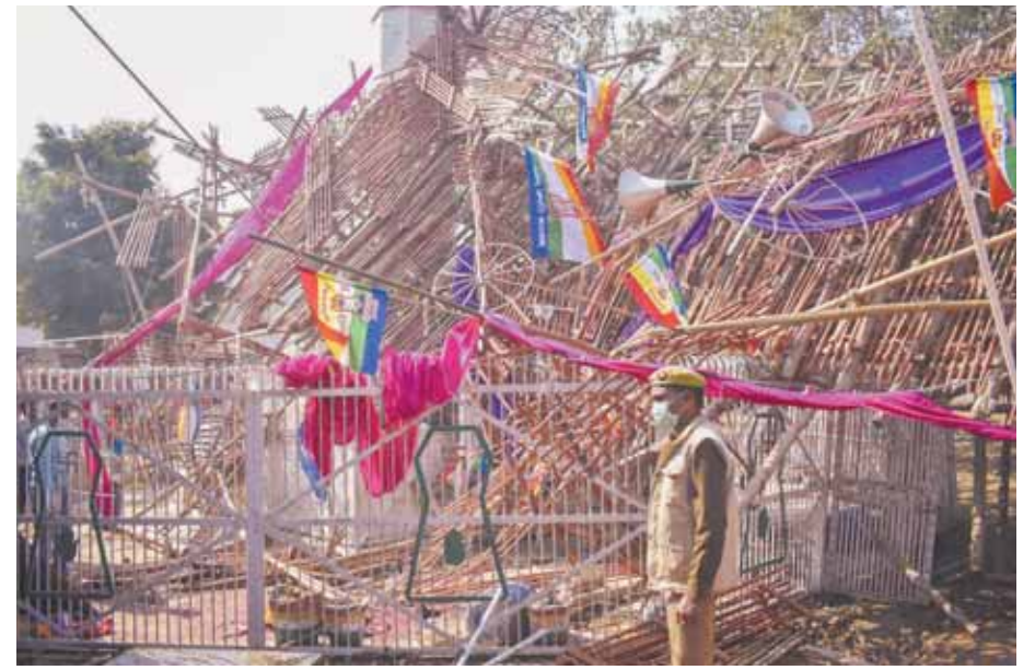
A security personnel stands guard at the site after a wooden structure collapsed during a Jain community event, in Baghpat

A major accident marred the first Tirthankara in Jainism, Bhagwan Adinath, in Baghpat, on Tuesday, as a wooden platform within the Manastamba complex crumpled, leaving seven dead and trapping over 50 devotees beneath the debris. The unexpected collapse resulted in a chaotic scene filled with panic and confusion as rescue efforts were launched at the site. The absence of readily available ambulances meant that many of the injured were transported to hospitals via e-rickshaws. Emergency responders from the Badaut police team quickly arrived to manage the situation and assist in the ongoing rescue operations, further highlighting the urgency of the situation. Chief Minister Yogi Adityanath took cognisance of the incident. He directed officials to immediately reach the location, expedite the relief efforts and prioritise the provision of proper medical treatment to the injured. Additionally, the chief minister expressed his wishes for the speedy recovery of all those affected by the unfortunate event. Baghpat District Magistrate Asmita Lal and Superintendent of Police Arpit Vijayvargiya rushed to the district hospital to