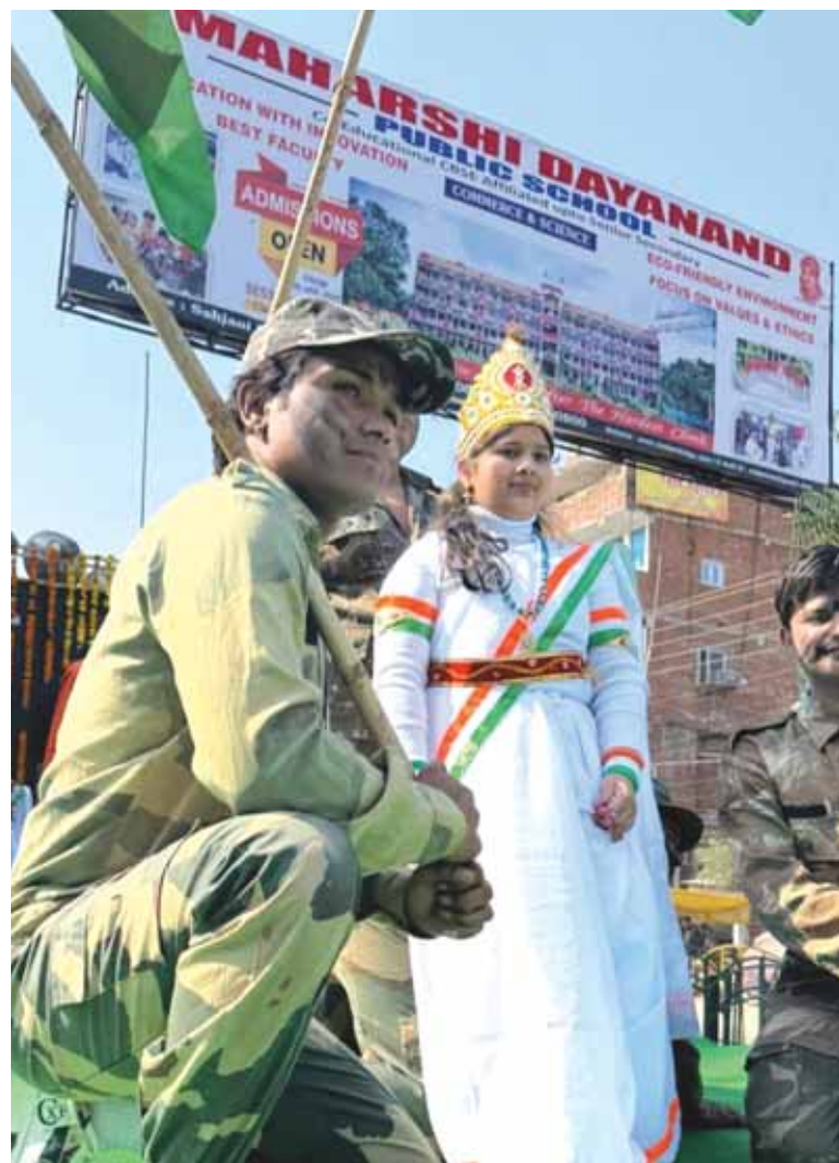
A girl student portrayed Bharat Mata during the Republic Day celebrations at Maharshi Dayanand Saraswati Public School, Sahjani. The school also organised a grand rally and students sang patriotic songs and inspired people by raising the slogan of ‘Vande Matram’.