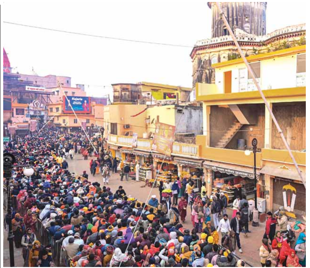
Devotees visit the Hanuman Garhi Temple after taking a holy dip in Sarayu river in Ayodhya on Tuesday.

potential to not only transform its own future but also contribute to global education through innovative approaches, digital platforms and affordable models of learning.” He also emphasised the importance of Uttar Pradesh’s Anganwadi model, promoted by Governor Anandiben Patel, as a remarkable example of community participation. “The Anganwadi model not only strengthens the foundation of our nation but also exemplifies how inclusive development can be achieved through collective efforts. This model must be implemented across India to unlock the true potential of the country,” he said. The key objectives of QS India Summit 2025 include fostering new collaborations between Indian and international academic institutions while strengthening existing partnerships. By promoting deeper cooperation, India aims to expand its role as a global education leader and build bridges to address educational inequalities worldwide.