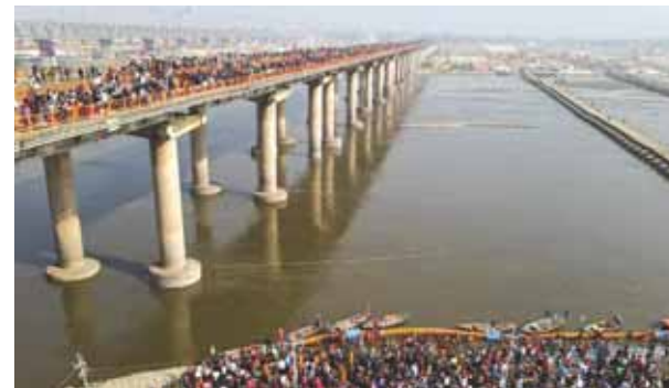
Devotees on Tuesday gather to take a holy dip at Sangam on the eve of Mauni Amavasya in Prayagraj