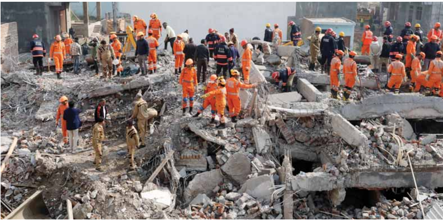
Rescue work underway after a four-storey building collapsed at Burari