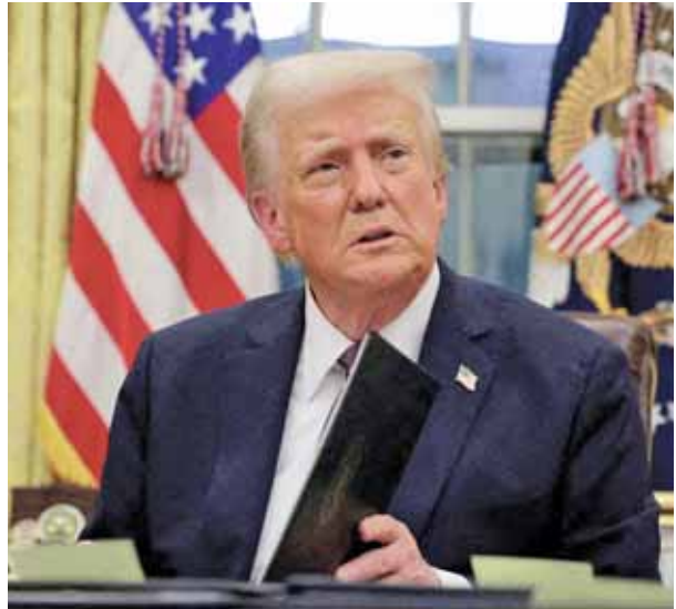
■ WASHINGTON

The United States will impose tariffs on the countries that "harm" America, President Donald Trump has said, as he named China, India and Brazil as high-tariff countries. "We're going to put tariffs on outside countries and outside people that really mean harm to us. Well, they mean us harm, but they basically want to make their country good," Trump told House Republicans at a Florida retreat on Monday, the first after he became the president for the second term last week. "Look at what others do. China is a tremendous tariff maker, and India and Brazil and so many other countries. So we're not going to let that happen any longer because we're going to put America first," he said.