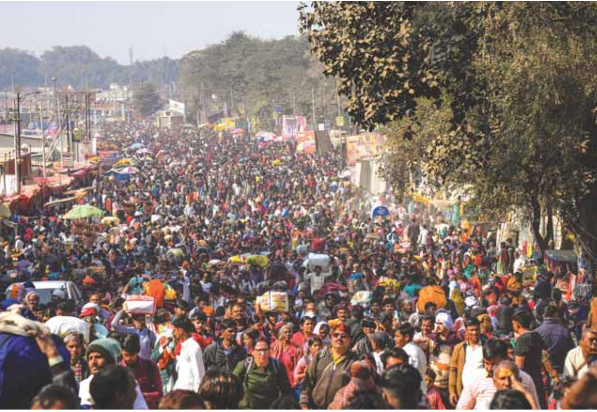
Rush of devotees on Tuesday on the eve of Mauni Amavasya during the Maha Kumbh Mela in Prayagraj.