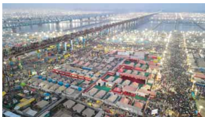
Devotees gather at the Sangam on the eve of 'Mauni Amavasya' during the Maha Kumbh Mela 2025, in Prayagraj, Uttar Pradesh.

accommodate the influx of devotees. To prevent overcrowding, the administration has encouraged pilgrims to bathe at the ghat nearest to their entry points. Devotees entering from different zones will be directed to designated ghats based on their location, ensuring a smooth flow of pilgrims. Special arrangements have been made for different groups of devotees. The Airavat Sangam Ghat will host pilgrims from eastern Uttar Pradesh, Bihar, Odisha, West Bengal, and northeastern states. Devotees from Madhya Pradesh, Gujarat, Rajasthan, Maharashtra, and southern states will bathe at specially developed ghats in Arail while pilgrims from Delhi, western Uttar Pradesh, Haryana, Punjab, and Uttarakhand will be accommodated at ghats extending from Sangam to Nagvasuki. Separate ghats have been reserved for saints, seers, and their disciples from various Akharas, ensuring