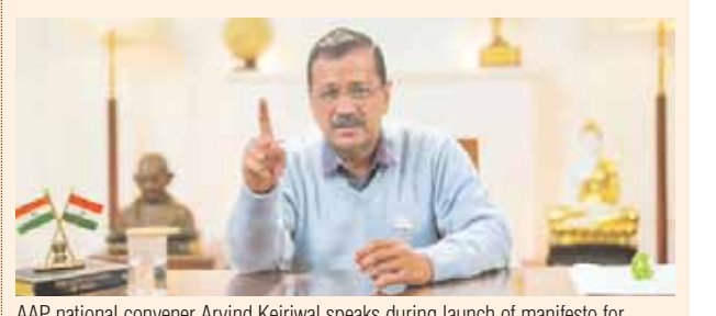
AAP national convener Arvind Kejriwal speaks during launch of manifesto for middle class ahead of the upcoming Delhi Assembly elections