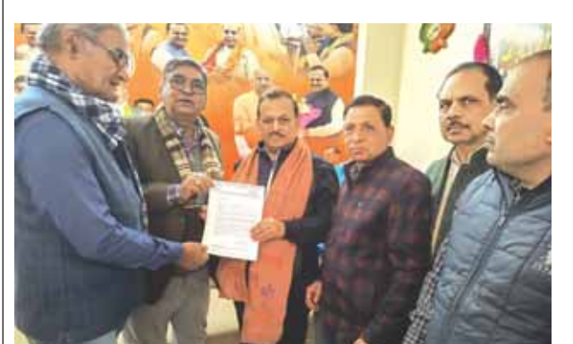
The members of EPS NAC handover memorandum to BJP MP Ramesh Awasthi.