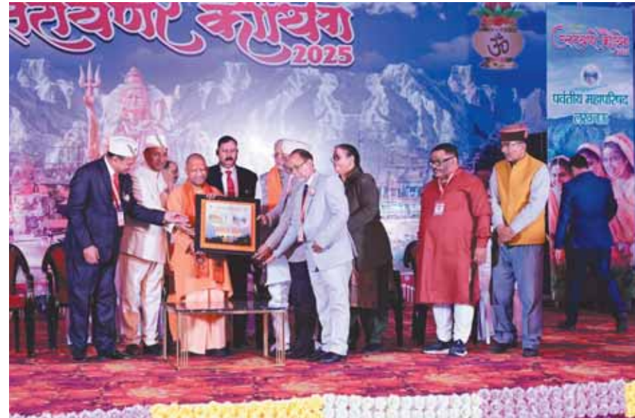
Chief Minister Yogi Adityanath at the concluding function of Uttarayani Mela held in Lucknow

and served as the chief minister of UP and was a Central minister too. Narayan Dutt Tewari, also from Uttarakhand, was the chief minister of both UP and Uttarakhand and gave a vision for progress. There are several such personalities which includes former Chief of Defence Staff General Bipin Rawat who was also from Uttarakhand. The state of Uttarakhand has also given brave soldiers for the army," he said. Yogi said that people from the hills connect with their tradition and orginee festivals for their community with enthusiasm wherever they reside. "I had invitations from Ghaziabad and Bareilly too but owing to my busy schedule could not attend these programmes," he said. Chief Minister Yogi said that Uttarayani Mela was not merely a programme but a platform where cultural programmes and competitions were showcased and where people from the community who contributed to the nation and the state were felicitated.