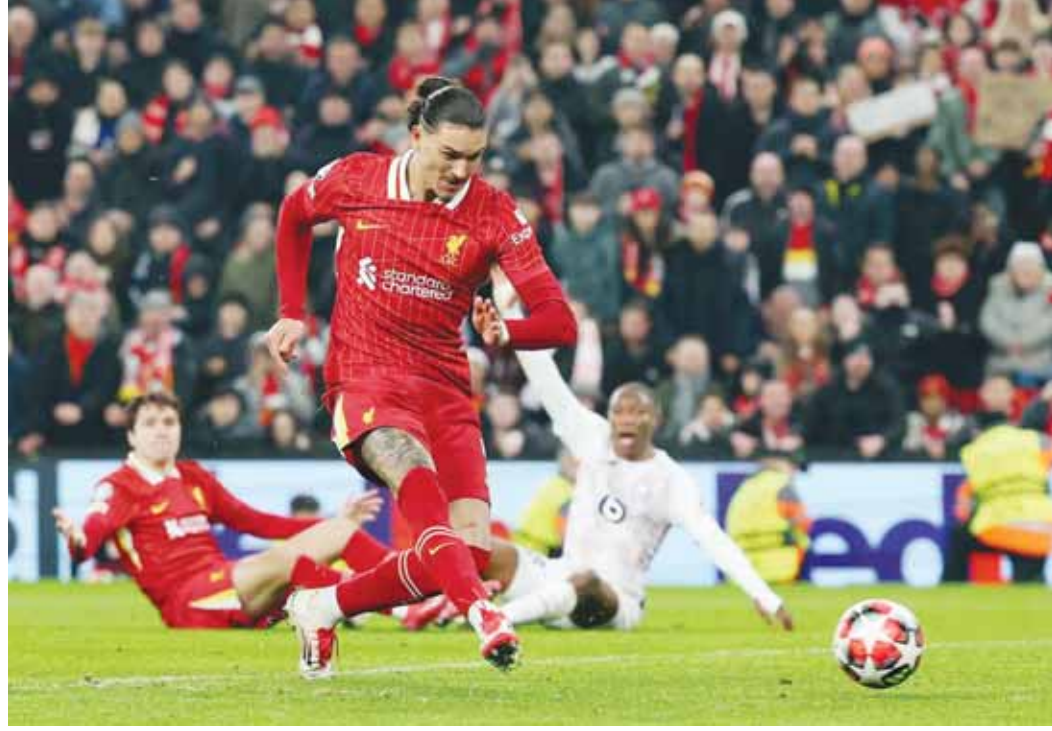
and managed to grab a win." Robert Lewandowski scored two penalties for Barcelona to stay the Champions League's top scorer on nine goals, one ahead of Raphinha, who also scored twice. Another Spanish club staged a comeback as Julian Alvarez scored a 90th-minute winner to lift Atletico Madrid past Bayer Leverkusen 2-1. Atletico lost Pablo Barrios to a 23rd-minute

didn't take long for Liverpool to regain the lead through Elliott's deflected effort five minutes later. "All my life I've dreamt of playing Champions League football, not only for my boyhood club but to play here at Anfield in front of our fans and especially to score, it's kind of a pinch-me moment," Elliott said. Barcelona's comeback win It was a night of high drama in the Champions League with 33 goals scored across nine games. Nine of them came in Barcelona's battle with Benfica. Raphinha scored in stoppage time to complete a rousing comeback as Barcelona won in Lisbon despite having been 4-2 down with less than a quarter of an hour remaining. Benfica's Vangelis Pavlidis scored the third-fastest hat trick at the start of a Champions League game, with two of his goals coming after errors by Barcelona goalkeeper Wojciech Szczesny. Barcelona stays second with 18 points from seven games, and is now unbeaten in six games in all competitions since the new year. "We came with the mindset that we could turn the game," Raphinha said. "We never gave up