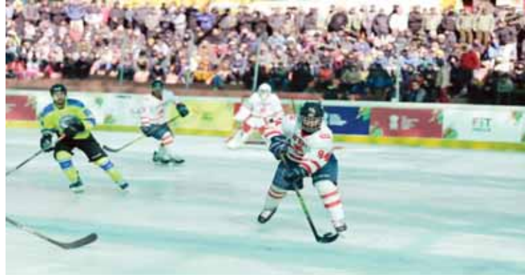
Sports Authority of India and the Ladakh Autonomous Hill Development Council. This will be the second time Ladakh hosts the Winter Games, now in its fifth edition, the spokesperson said. "All teams have arrived in Leh, which is at an altitude of 11,562 feet. Himachal Pradesh has the largest contingent, comprising 78 athletes and support staff," he added. Haryana (62), hosts Ladakh (52), and Maharashtra (48) will compete in the Ladakh edition. Uttarakhand, which will host the National Games later this