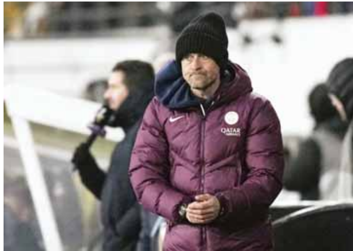
They go back far. "We were mates in Barcelona and our families are really close friends," Guardiola said. "Our friendship will be eternal. The (Enrique's family) love us (and) I

seeing things." Guardiola rose to fame as a coach during a glory era for Barcelona, winning the Champions League twice and multiple other trophies. Guardiola's sides hypnotized opponents with a pulsating brand of attacking soccer led by Lionel Messi that was the envy of Europe. Guardiola then turned City into a Premier League force. "The 4-3-3 with Barcelona was almost the perfect model. He opened up a different way of playing in England and did so with success, he opened many doors for others," Enrique said. "Pep has innovated throughout his career and is not scared to do so again." Guardiola won the Champions League again with City in 2023, while Enrique's PSG reached the semifinals last season. Enrique and Guardiola have history