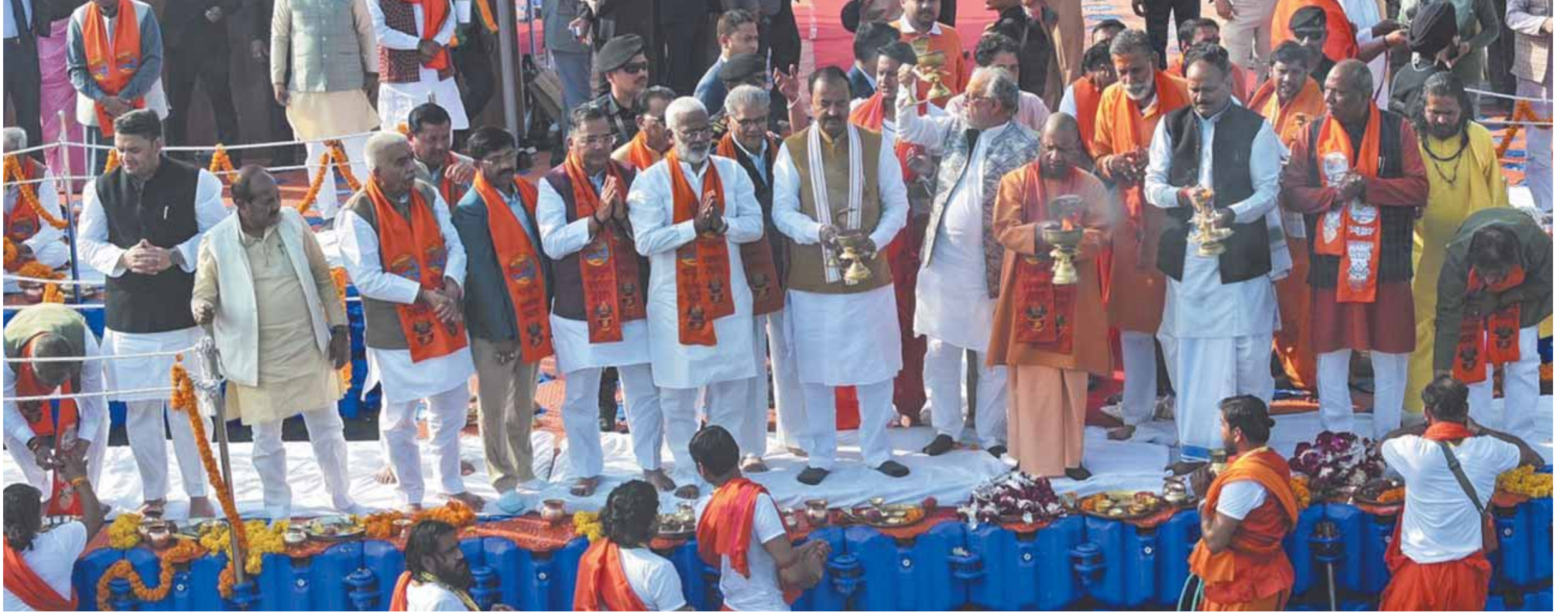
Uttar Pradesh Chief Minister Yogi Adityanath with his Cabinet colleagues performs rituals at the Sangam during the Maha Kumbh Mela 2025, in Prayagraj, on Wednesday.