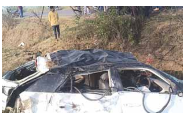
The car which was badly damaged after hitting a tree