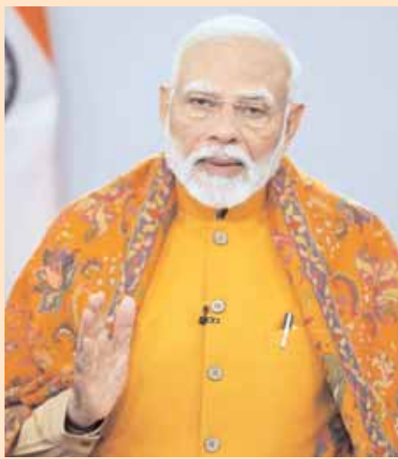
SAUMYA SHUKLA ■ NEW DELHI

Turning the heat up ahead of the Delhi Assembly elections, Prime Minister Narendra Modi on Wednesday slammed the ruling Aam Aadmi Party (AAP) for failing to provide basic needs such as water to the people of the national Capital while taking a jibe at the party on the money laundering linked excise policy scam, stating that 'liquor is available but water is not'. Prime Minister made these remarks during his interaction with the booth level workers in the 'Mera booth, sabse mazboot' programme while urging the members of the Bharatiya Janata Party (BJP) in the Capital to target winning over 50 per cent booths in the Assembly polls. Assuring a landslide victory in the Assembly polls, he asked booth workers to set two goals- breaking all voting records and ensure that the BJP gets more than 50 per cent at each booth. He said that the AAP is making new announcements daily because they are getting the new news of defeat every day. "These AAP-da people are now making a new announcement every day. This means that they are getting new news of defeat every day.