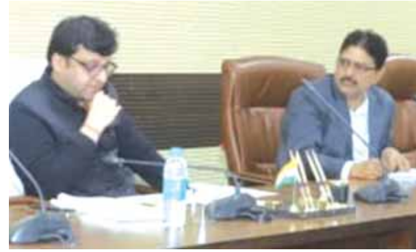
Uttar Pradesh Minister of State (Independent Charge) for Excise and Prohibition Nitin Agarwal reviewing progress of Excise department work in Varanasi on Tuesday.

The minister said the officers should achieve the set revenue target on time and take strict action against overrating and illicit liquor. He said under no circumstances illicit liquor should be allowed to enter the state from outside. "If over-