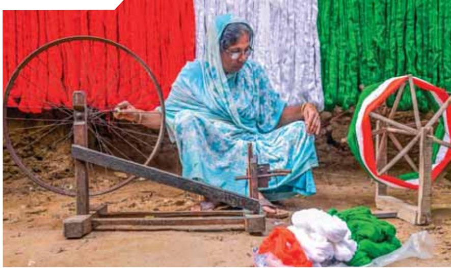
A woman prepares yarn to make the tricolour ahead of Republic Day 2025, in Nadia