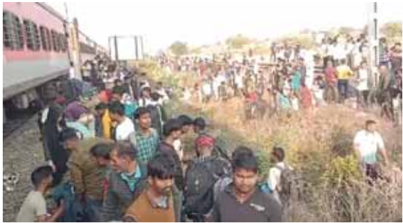
People gather at the site following the death of several passengers after they stepped down due to a rumour of fire and were run over by another train passing on the adjacent tracks, in North Maharashtra's Jalgaon district