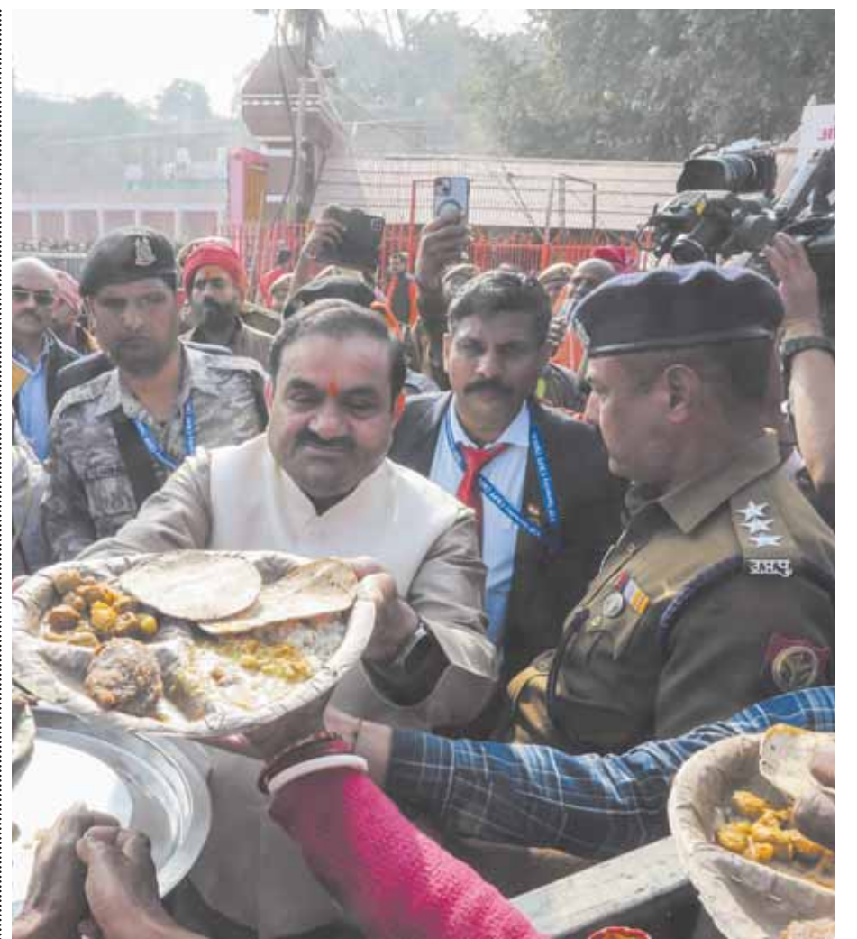
Adani Group Chairman Gautam Adani distributes food to needy at Shri Bade Hanuman Ji Temple during the Maha Kumbh Mela 2025, in Prayagraj on Tuesday

Yogi for orchestrating such an extraordinary event, acknowledging the chief minister's relentless efforts in making this possible. He shared that the event has left everyone in awe, with devotees and tourists from across the globe drawn to its spiritual energy. He said, "The mesmerising aura of Maha Kumbh has left an indelible impression on visitors, compelling them to return repeatedly. The festival is a beacon of unity and vitality, sending the world an unparalleled message of Sanatan Dharma's harmony." Recalling his experience at the Sangam, Chidanand Saraswati remarked that he felt immense pride witnessing the people's enthusiasm. He said, "The scene of devotees from every corner of the nation and beyond taking a dip in the holy waters was divine and magnificent. Even individuals from countries like Pakistan, Bangladesh, Bahrain, and the Arab world are captivated by the spiritual grandeur of Maha Kumbh, with many expressing a desire to join the celebration. The festival showcases the