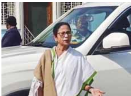
West Bengal Chief Minister Mamata Banerjee addresses the media in Howrah