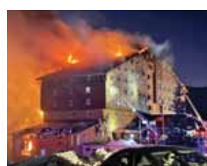
Firefighters work to extinguish a fire in a hotel at a ski resort of Klartalkaya in Bolu province, in northwest Turkey