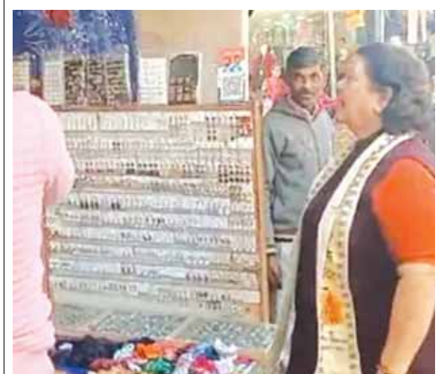
Mayor Pramila Pandey asking encroachers to remove their shops in Parade area on Tuesday.