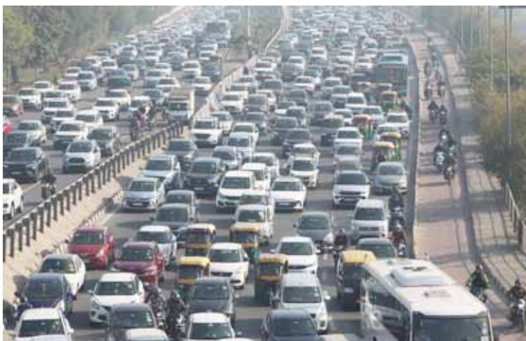
Traffic jam near the Ring Road owing to rehearsal for the Republic Day Parade

Massive traffic congestion was seen in central Delhi due to the Republic Day parade rehearsals on Tuesday, leaving hundreds of commuters stranded on the road. Commuters also complained of long queues at metro stations due to heightened security checks ahead of Republic Day. Routes leading to Bahadur Shah Zafar Marg near the ITO, arterial roads of the Ring Road, between Ashram and IP Estate flyover, Man Singh Road, Rafi Marg, Janpath Road, Shahjahan Road, Akbar Road, Ashoka Road and other routes around the Kartavya Path were severely hit. A traveller shared videos and pictures of a traffic jam in Mundka following which the Delhi Traffic Police said the traffic control room has been informed and the needful is being done. "Don't feel like going out for work. The traffic in Delhi is horrible," another user on X said. Motorists blamed traffic personnel for not regulating traffic properly and said