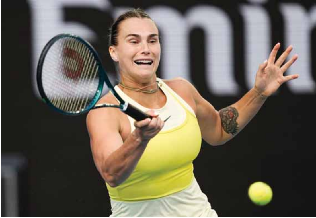
was Martina Hingis from 1997 to 1999. Badosa's 7-5, 6-4 victory over No. 3 Coco Gauff in the day's first

"Honestly," Sabalenka said, "I was just praying." She won her first major championship at Melbourne Park in 2023, then added another last January, before raising her total to three Grand Slam trophies at the U.S. Open last September. The last woman to win the Australian Open three straight years