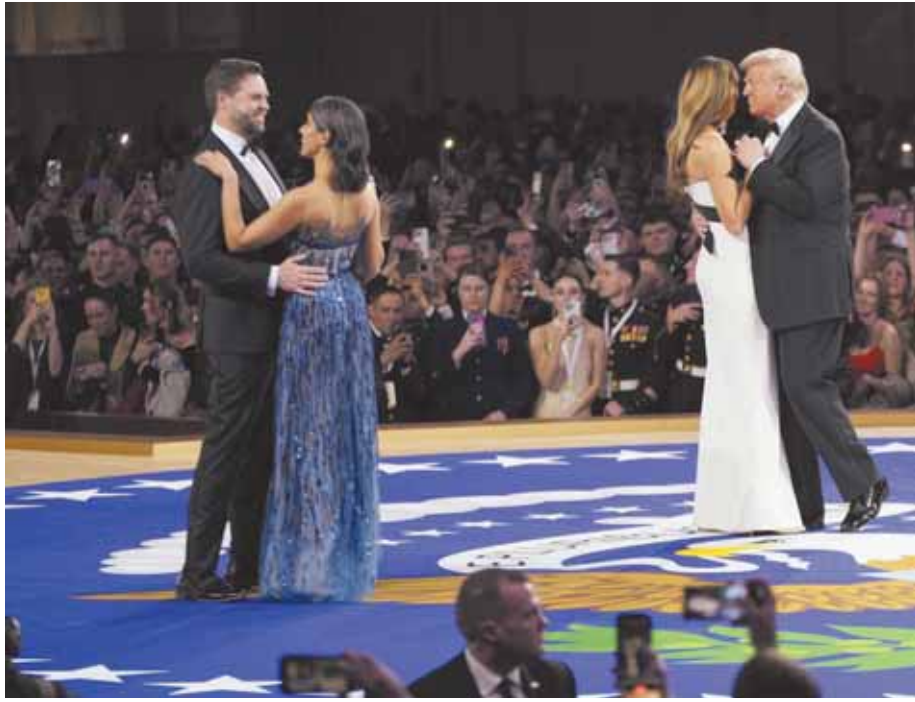
President Donald Trump, from right, with first lady Melania Trump and Vice President JD Vance, from left, with his wife Usha Vance, dance at the Commander in Chief Ball, Monday, in Washington, during the 60th Presidential Inauguration.

President Donald Trump on Monday pardoned, commuted the prison sentences or vowed to dismiss the cases of all of the 1,500-plus people charged with crimes in the Jan 6, 2021, US Capitol riot, including people convicted of assaulting police officers, using his clemency powers on his first day back in office to undo the massive prosecution of the unprecedented assault on the seat of American democracy.