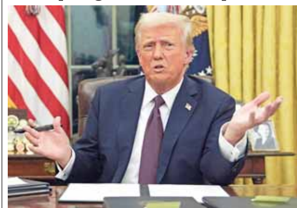
President Donald Trump talks to reporters as he signs executive orders in the Oval Office of the White House