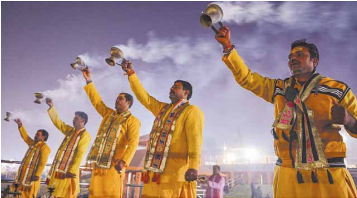
Priests perform 'Ganga Arti' during the Maha Kumbh Mela 2025 in Prayagraj on Tuesday