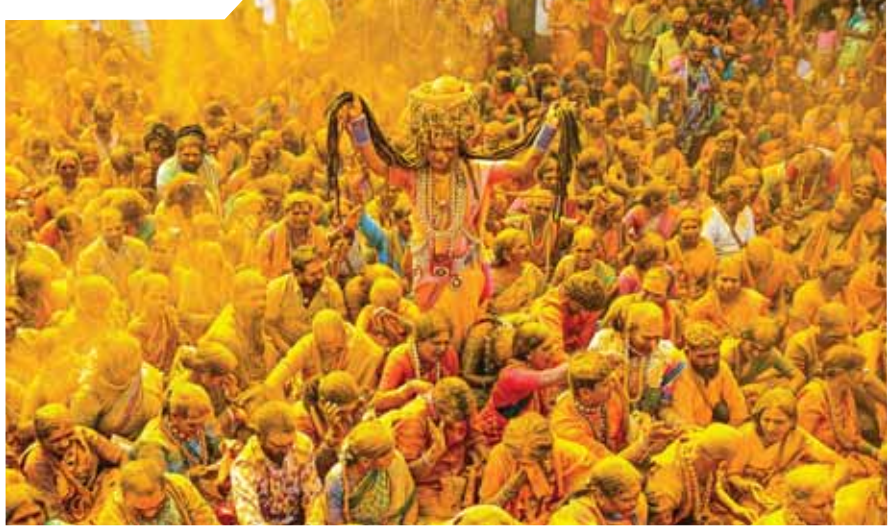
Devotees celebrate 'Komuravelli Mallanna Jathara' festival, at Komuravelli in Siddipet