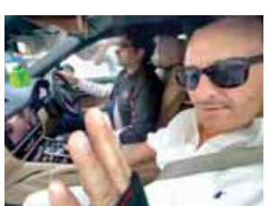
Bollywood actor Saif Ali Khan on his way to home after he was discharged from Lilavati Hospital, in Mumbai

Saif was seen with friends and neighbours, as he walked into his "Satguru Sharan" building. Minutes later, the actor returned to his 12th floor apartment where he had sustained six stab injuries, including the one in his spine, in a knife attack on him by an