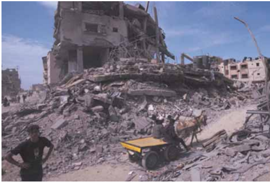
the size of the Great Pyramid of Giza. With over 100 trucks working full time, it would take over 15 years to clear the rubble

months of the war. Israel blames the destruction on Hamas, which ignited the war with its October 7, 2023, attack into Israel, killing some 1,200 people, mostly civilians, and abducting another 250. Israel's retaliatory offensive has killed over 46,000 Palestinians, more than half of them women and children, according to Gaza's health ministry, which does not say how many of the dead were fighters. Israel claims it has killed over 17,000 militants, without providing evidence. The military has released photos and video footage showing that Hamas built tunnels and rocket launchers in residential areas, and often operated in and around homes, schools and mosques. Before anything can be rebuilt, the rubble must be removed — a staggering task in itself. The UN estimates that the war has littered Gaza with over 50 million tonnes of rubble — roughly 12 times