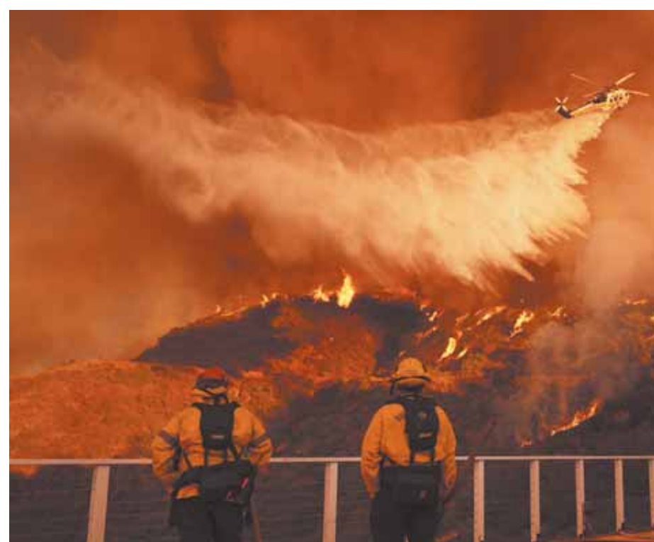
Firefighters watch a helicopter drop water on the Palisades Fire in Mandeville Canyon in Los Angeles, on Saturday.

gents who ousted Assad in December, The Associated Press toured several facilities to view the graffiti left behind. Nothing can be known about the men who drew and wrote them. Only a few bear names, and few are dated. It's impossible to know who of them lived or died. Some walls have layers of graffiti on top of each other, marking generations of suffering. "Don't be sad, mother. This is my fate," reads one, dated Jan 1, 2024. Underneath it are traces of an older text, so faded that only a few words are legible: "... except for you" — a hint of longing for a loved one. Many of the writings and drawings are cries to parents or loved ones. Someone drew a heart broken in two, with "mother" written in one side, "father" in the other.