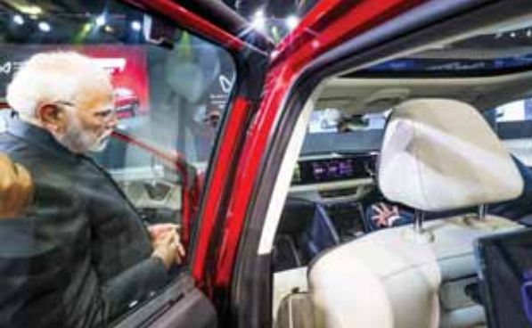
Prime Minister Narendra Modi during the Bharat Mobility Global Expo 2025 at Bharat Mandapam, in New Delhi

India has emerged as a major automobile hub in the world and number of cars sold in the country annually surpasses the population of many countries, Prime Minister Narendra Modi said here on Friday. Underlining this, he also said future of mobility belongs to India that saw an unprecedented sale of 2.5 crore vehicles a year, and attracted USD 36 billion foreign direct investment in just four years. Addressing a gathering after inaugurating the Bharat Mobility Global Expo 2025 at Bharat Mandapam, the prime minister also emphasised that India stands as an outstanding destination for every investor looking to shape one's future in