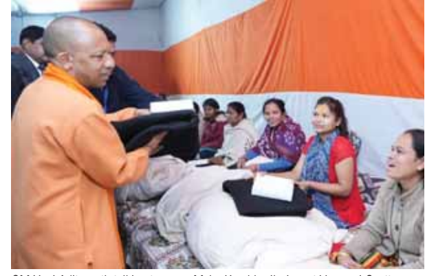
CM Yogi Adityanath talking to some Maha Kumbh pilgrims at Varanasi Cantt station shelter home on Thursday night.

Chief Minister Yogi Adityanath inspected the shelter homes built at Varanasi Junction (Cantt) station premises and Town Hall on Thursday night during his two-day visit. He gave necessary instructions to the officials. Along with lighting a bonfire in the shelter home, he directed to ensure proper arrangements of toilets, cleanliness, beds and blankets etc for the people living there. The CM especially emphasised that no one should sleep on the roadside in the open sky during the cold. Arrangements for such destitute people to stay in the shelter homes should be ensured in every condition. He asked about the well-being of the people living in the shelter homes. People expressed hap-