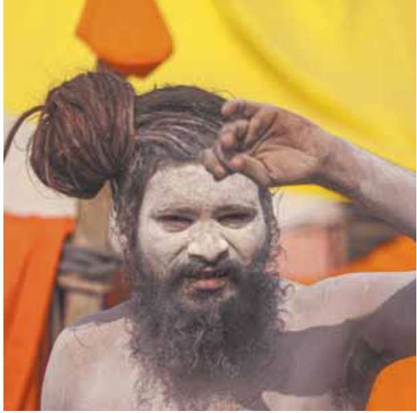
(Top) A worker sprays medicine near tents during the Maha Kumbh Mela at Sangam in Prayagraj on Friday. (Above) Sadhus during the grand event at Sangam

classes and languages, are participating in the age-old tradition of Kalpavas. Rich or poor, traders or officials, men, women or transgender individuals, everyone forgets their differences and unites in the spirit of devotion, taking a holy dip at the confluence.