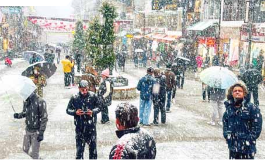
Tourists at Mall Road amid snowfall, in Manali