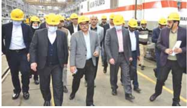
Iranian delegation visiting BLW workshop in Varanasi on Friday.