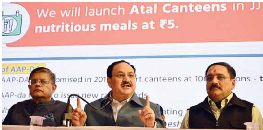
BJP National President JP Nadda along with Delhi BJP President Virendra Sachdeva and others leaders during addresses the media during the launch of 'BJP Sankalp Patra Part-I' for Delhi Assembly elections, in New Delhi