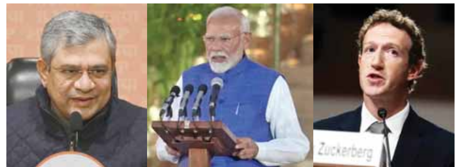
(Left to right): Ashwini Vaishnaw; PM Narendra Modi taking oath in June 2024 and Mark Zuckerberg