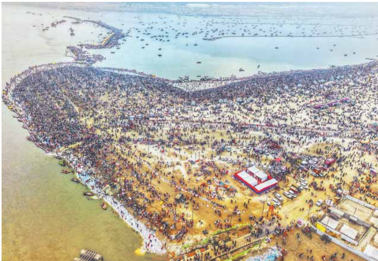
In this image posted by @myogiadityanath via X on Tuesday, a view of devotees at the Sangam area during the first 'Amrit Snan' of Maha Kumbh on Makar Sankranti