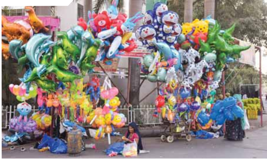
A vendor sells balloons, at the roadside in Surat