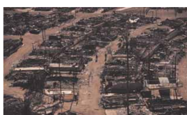
Firefighters walk along a road in a fire-ravaged community in the aftermath of the Palisades Fire in the Pacific Palisades neighborhood of Los Angeles, Monday.

Los Angeles (AP): Additional water tankers and scores of firefighters arrived at the Los Angeles area on Monday ahead of fierce winds that were forecast to return and threaten the progress made so far on two massive infernos that have destroyed thousands of homes and killed at least 24 people. Planes doused homes and hillsides with bright pink fire-retardant chemicals, while crews and fire engines were being placed near particularly vulnerable spots with dry brush. Dozens of water trucks rolled in to replenish supplies after hydrants ran dry last week when the two largest fires erupted. Tabitha Trosen and her boyfriend said she feels like they are "teetering" on the edge with the constant fear that their neighbourhood