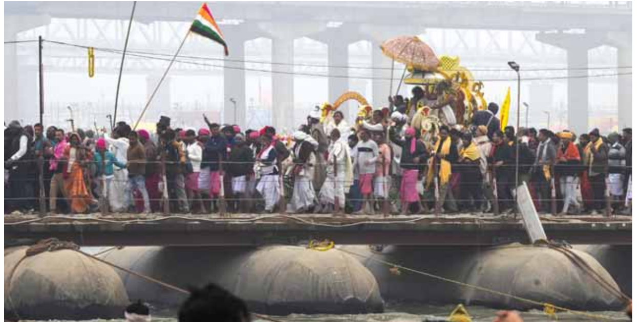
Devotees on Tuesday taking part in a procession at Sangam on the occasion of Makar Sankranti during the Maha Kumbh Mela 2025 in Prayagraj