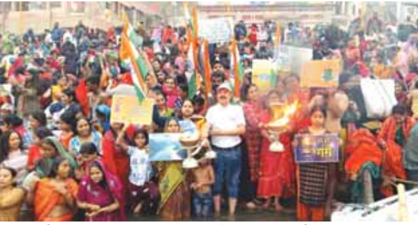
Namami Gange activists performing aarti at Dashashwamedh Ghat during Makar Sankranti in Varanasi on Tuesday.

Vishwanath Temple (KVT) which also saw long queues of devotees throughout the day. The personnel of National Disaster Response Force (NDRF) and Water Police were deployed at ghats to keep a close watch on the activities and avoid any untoward incident. After taking a bath, the devotees also donated rice, jagery and products made with sesame seeds, coins etc to the Brahmins and beggars as per tradition of importance of donation in this festival, which is popularly known as Khichdi in this region of Purvanchal (eastern UP). Throughout the day, the 'khichdi' was also distributed among devotees at Khichadi Baba Temple in Dashashwamedh area. Like Gujarat, the city is also famous for kite flying. A large number of people, including Gujaratis, went across the river to enjoy kite flying. Markets selling jagery-sesame, groundnut items, chuda (made from flattened rice), lai (parched rice) etc saw heavy crowds of customers during the day. The rush of people, especially children and youth, was seen at stalls selling kites and related