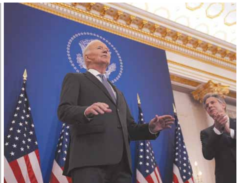
President Joe Biden, left, standing next to Secretary of State Antony Blinken, right, tells the audience to sit as he gets a standing ovation before making a speech about foreign policy at the State Department in Washington, Monday.

more than a dozen top administrative positions. The Republican-led Senate is rushing to have some of Trump's picks ready to be confirmed as soon as Inauguration Day, Jan. 20, despite potential opposition to some from both sides of the aisle. "We're going to grind them down," Senate Majority Leader John Thune, R-S.D., said on Fox News. Hegseth faces perhaps the most difficult path to confirmation. He will be forced to confront allegations of sexual assault, which he has denied, and his own comments that are far from the military mainstream, though he has the support of some veterans' groups that say his past indiscretions are not as important as his focus on improving military readiness to fight. And Hegseth will have to answer for his comments that women should "straight up" not be in combat roles in the military, a view he has softened following recent meetings with senators. Two former female combat veterans, Republican Joni Ernst of Iowa and Democrat Tammy Duckworth of Illinois, are among those grilling him from the dais. "He can try to walk back his comments on women in combat all he wants, but we know what he thinks, right?" said Duckworth, an Iraq War veteran who lost her legs and partial use of her right arm when the Black Hawk helicopter she was piloting in the Army National Guard was shot down. "He's the most unqualified person to ever be nominated for secretary of defense."