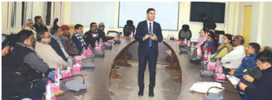
An interactive session for library staff being held at BHU in Varanasi on Monday.