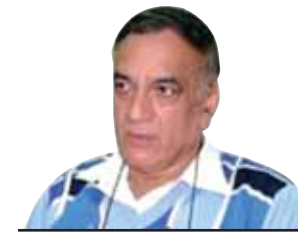
V K BAHUGUNA

While the total forest and tree cover rose by 1,445.81 sq km since 2021, the findings reveal deeper concerns about the health and sustainability of India's natural forests