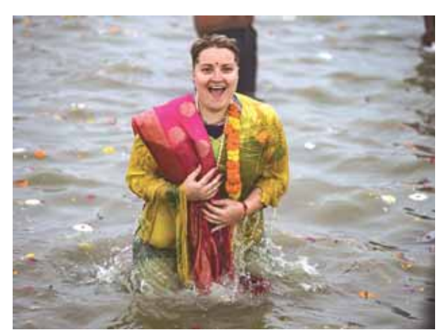
A foreign devotee takes a holy dip at Sangam in Prayagraj on Monday.