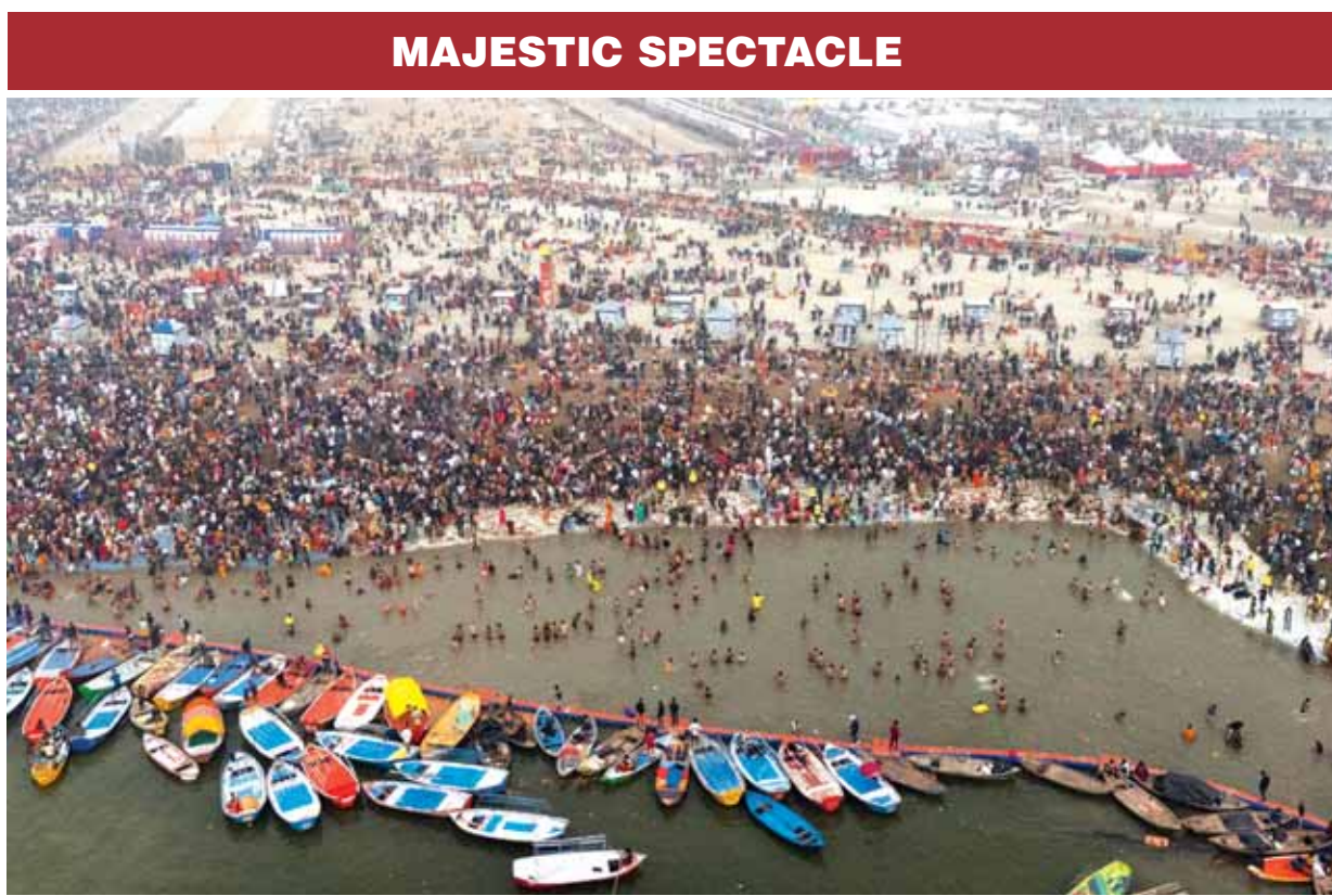
Devotees take a holy dip at the Sangam on the first day of Maha Kumbh Mela 2025, in Prayagraj on Monday

day-long Maha Kumbh 2025 might surpass the Uttar Pradesh government's crowd projections. The massive turnout in the initial days suggests that this year's congregation will be larger than ever before. This year, the coincidence of Paus Purnima falling on a Monday, an auspicious day for the worship of Mahadev, made the occasion even more spiritually significant. Devotees were seen chanting "Har Har Mahadev", "Jai Shri Ram", and "Jai Bajrang Bali" while taking the holy dip at all the major ghats, including Sangam Noj. Pilgrims from various states like Bihar, Haryana, Bengal, Odisha, Delhi, Uttarakhand, Punjab, Himachal Pradesh, Maharashtra and Madhya Pradesh were seen participating in large numbers. The splendor of Maha Kumbh has captivated not only Indian devotees but also visitors from across the world. At Sangam Ghat, a stream of international pilgrims and spiritual seekers joined the festivities. Several YouTubers from South Korea were seen capturing the heavenly experience on their cameras, while tourists from Japan engaged with local guides to understand the cultural and spiritual significance of the event. Sanatani devotees from various countries of Europe including Russia and America also witnessed this great festi-