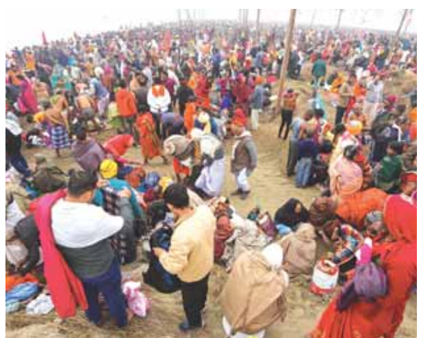
Devotees gather to perform rituals at Sangam on Monday