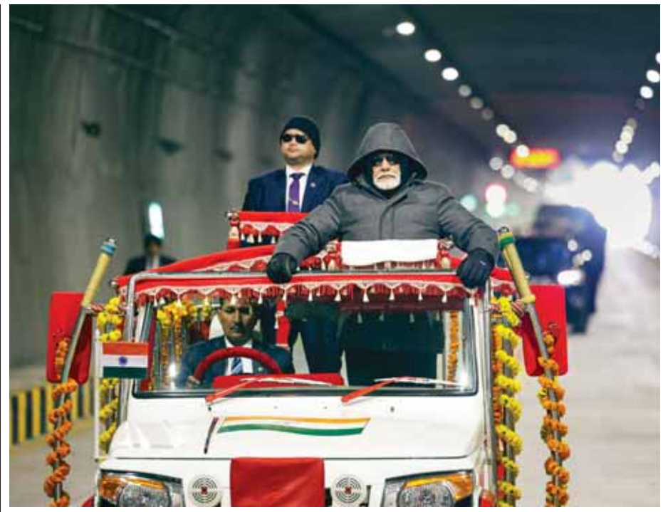
Prime Minister Narendra Modi during the inauguration of the Z-Morh tunnel.