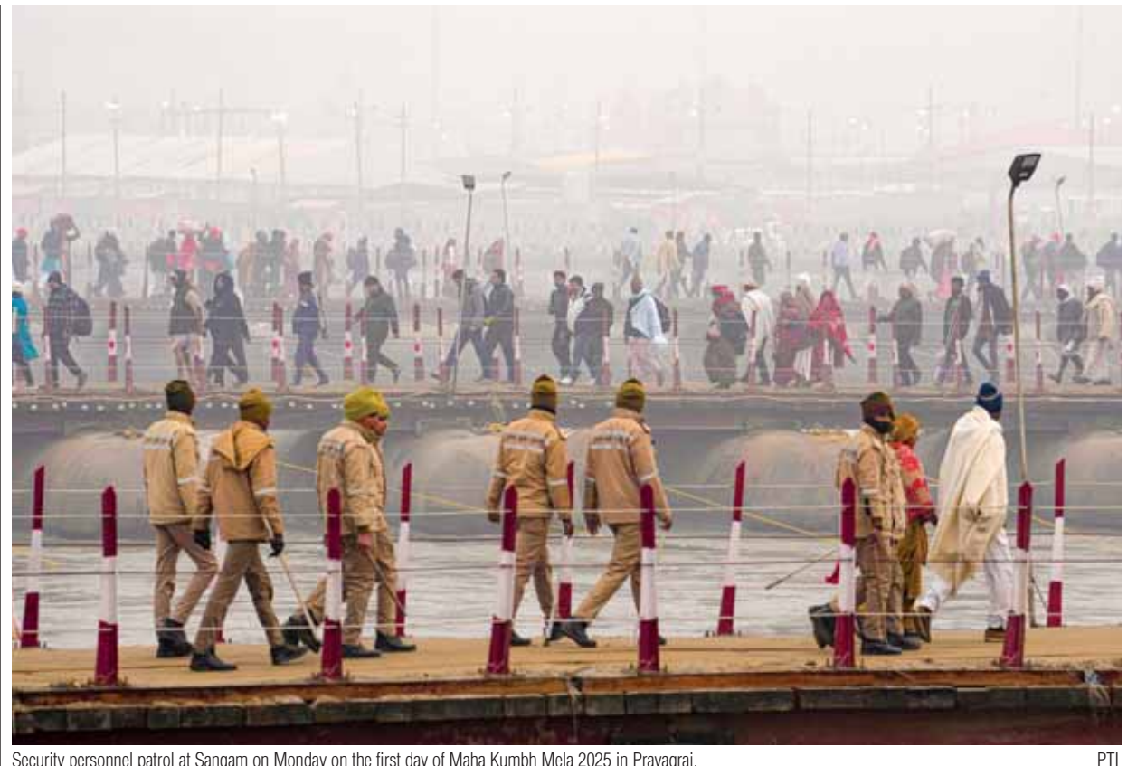
Security personnel patrol at Sangam on Monday on the first day of Maha Kumbh Mela 2025 in Prayagraj.

The ACP directed the police officers to coordinate and ensure smooth running of traffic system. After this, both the officers inspected the temporary bus stand built in front of Aryan International School (in Chitapur). He said they should talk to the local four-wheeler drivers, tempo and e-rickshaw operators and inform them about the entire process. He directed to level the ground and get necessary barricading done for parking the vehicles. After this, he also inspected Banaras railway station and stressed on better crowd management and strengthening the traffic system. During the inspection, the police station in charge of the area concerned and other police officers were present.