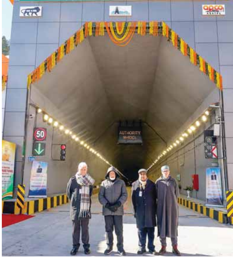
Prime Minister Narendra Modi with Union Minister for Road Transport and Highways Nitin Gadkari, J&K Lt. Governor Manoj Sinha and Chief Minister Omar Abdullah during the inauguration of the Z-Morh tunnel.

the pipeline across Jammu and Kashmir. After inaugurating the Rs 2,700 crore project, the prime minister went inside the tunnel and interacted with the project officials. He also met the construction workers who worked meticulously amid harsh conditions to complete the tunnel. Announcing the inauguration of the Sonamarg Tunnel the Prime Minister highlighted that this tunnel will significantly ease the lives of people in Sonamarg, Kargil, and Leh. The 6.5-km-long two-lane bi-directional road tunnel between Gagangir and Sonamarg in central Kashmir's Ganderbal district is equipped with a parallel 7.5-metre escape passage for emergencies. Situated at an altitude of over 8,650 feet above sea level, the tunnel will enhance all-weather connectivity between Srinagar and Sonamarg en route to Leh, bypassing routes prone to landslides and avalanches. It will also promote tourism by