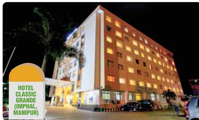
HOTEL CLASSIC GRANDE (IMPHAL, MANIPUR)

Blessed with nature's bounty, Northeast India is a safe haven for many travellers who wish to escape the overcrowded and over-polluted city life from time to time. With the winter season worsening the pollution's threat to healthy living, Northeast India is the best place to take refuge in to revitalise your health and take a step back to centre within. Here are a few of the many scenic vacation spots that can do just that.