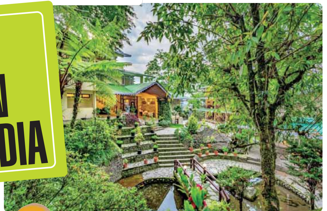
SUMMIT NORLING RESORT AND SPA (GANGTOK, SIKKIM)

Situated on the outskirts of Kaziranga National Park, Diphlu River Lodge offers an authentic experience with its rustic ethnic design. The lodge features comfortable accommodations and a range of activities such as bird watching, vehicle safaris, and village treks, making it an excellent choice for nature lovers. A land of rolling tea gardens, the mighty Brahmaputra, and rich wildlife, Assam is brimming with its natural beauty and vibrant cultural heritage.