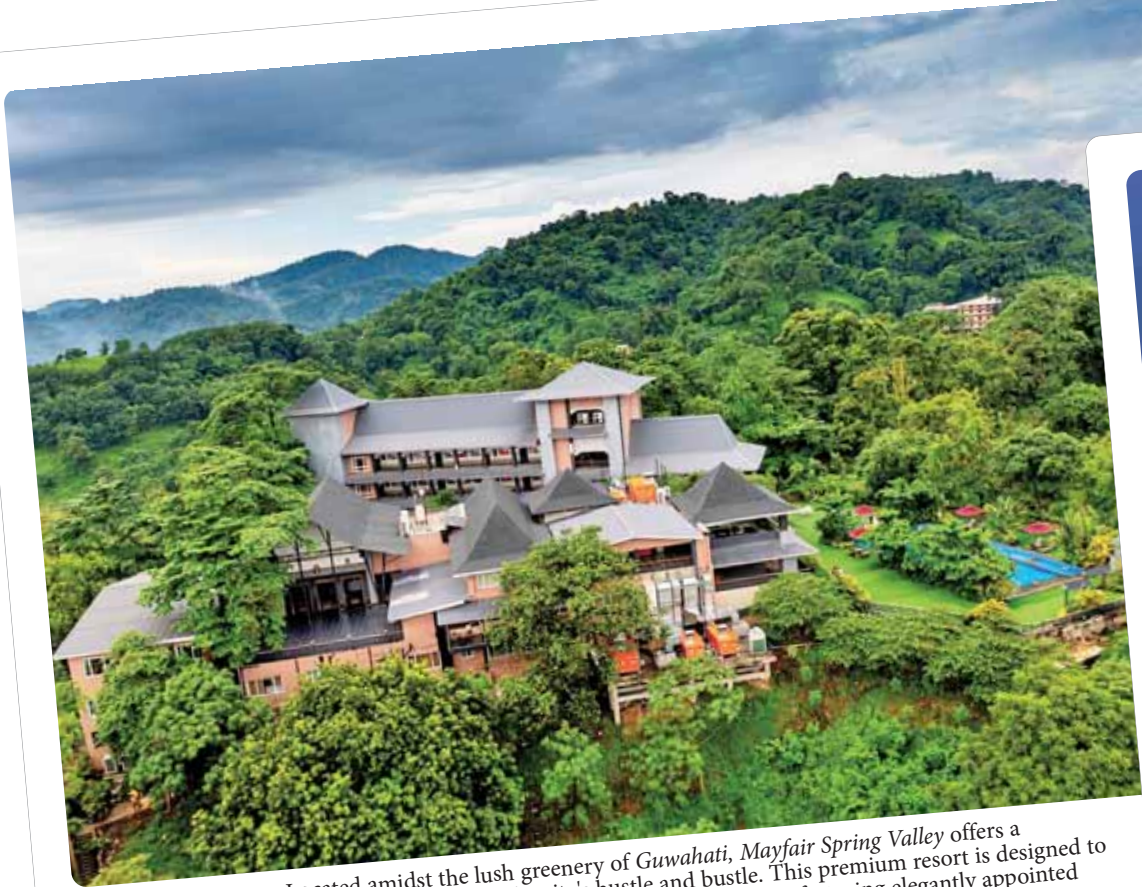
MAYFAIR SPRING VALLEY (GUWAHATI, ASSAM)

Located amidst the lush greenery of Guwahati, Mayfair Spring Valley offers a luxurious escape from the city's hustle and bustle. This premium resort is designed to provide guests with ultimate comfort and relaxation, featuring elegantly appointed rooms, a rejuvenating spa, a dedicated kids' play area and top-notch dining experiences. Surrounded by picturesque landscapes, the resort offers serene views of rolling hills and verdant gardens, making it an ideal retreat for nature enthusiasts and luxury seekers alike. Guests can also explore nearby attractions, such as the famous Kamakhya Temple and Brahmaputra Riverfront, ensuring a blend of tranquillity and adventure during their stay.