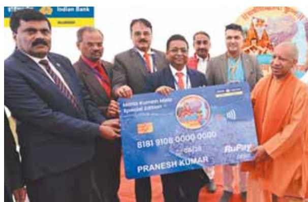
Indian Bank has come up with Mahakumbh Special Edition ATM debit cards. The Special Edition ATM debit card was unveiled on Friday by Chief Minister Yogi Adityanath in Prayagraj.