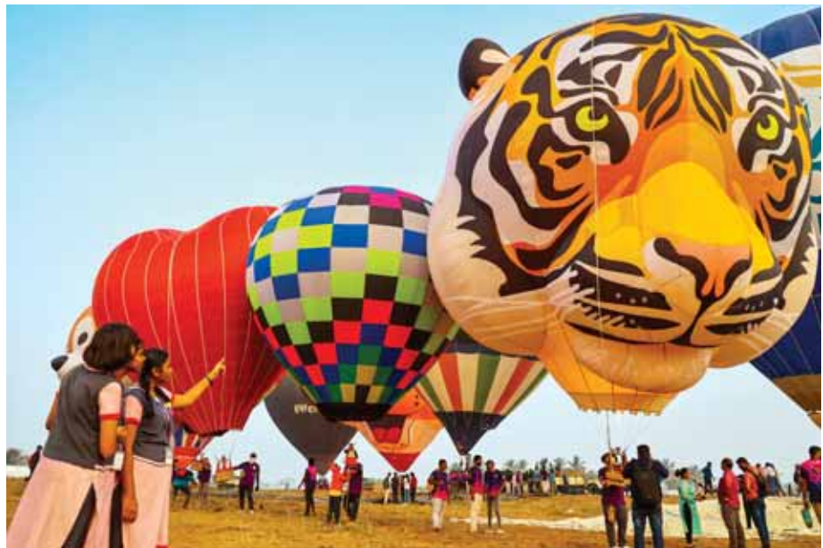
Enthusiasts at the 10th Tamil Nadu International Balloon Festival, in Mamallapuram