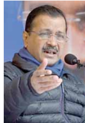
AAP national convener Arvind Kejriwal addresses a press conference

The political discourse in Delhi is currently being dominated by conversations around "freebies" ahead of the Assembly polls overshadowing other major issues including pollution, law and order, crimes against women and infrastructure. Aam Aadmi Party (AAP) chief Arvind Kejriwal announced his 10th freebies on Friday, pledging to provide Resident Welfare Associations (RWAs) with funds to hire private security guards if the party is voted back into power, as he took digs at the BJP for turning the city into a "crime capital". This was his 10th guarantee of the ongoing freebies being offered by his government. Announcing funds for security guards in RWAs, Kejriwal said if the AAP forms the government, all RWAs will be provided with appropriate funds from the Delhi government to appoint security guards in their areas. "A systematic approach will be developed to ensure fairness and proper implementation," he added. Reacting to the new poll promise by AAP, the BJP slammed Kejriwal and accused him of making