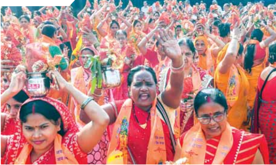
Devotees carry 'kalash' during 'Hindu Rashtra Seva Mela' at Goregaon