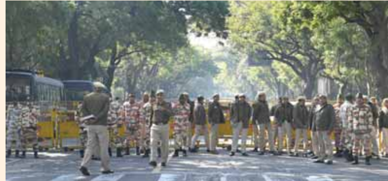
Police and security personnel stand guard outside Prime Minister's official residence at Lok Kalyan Marg, in New Delhi.