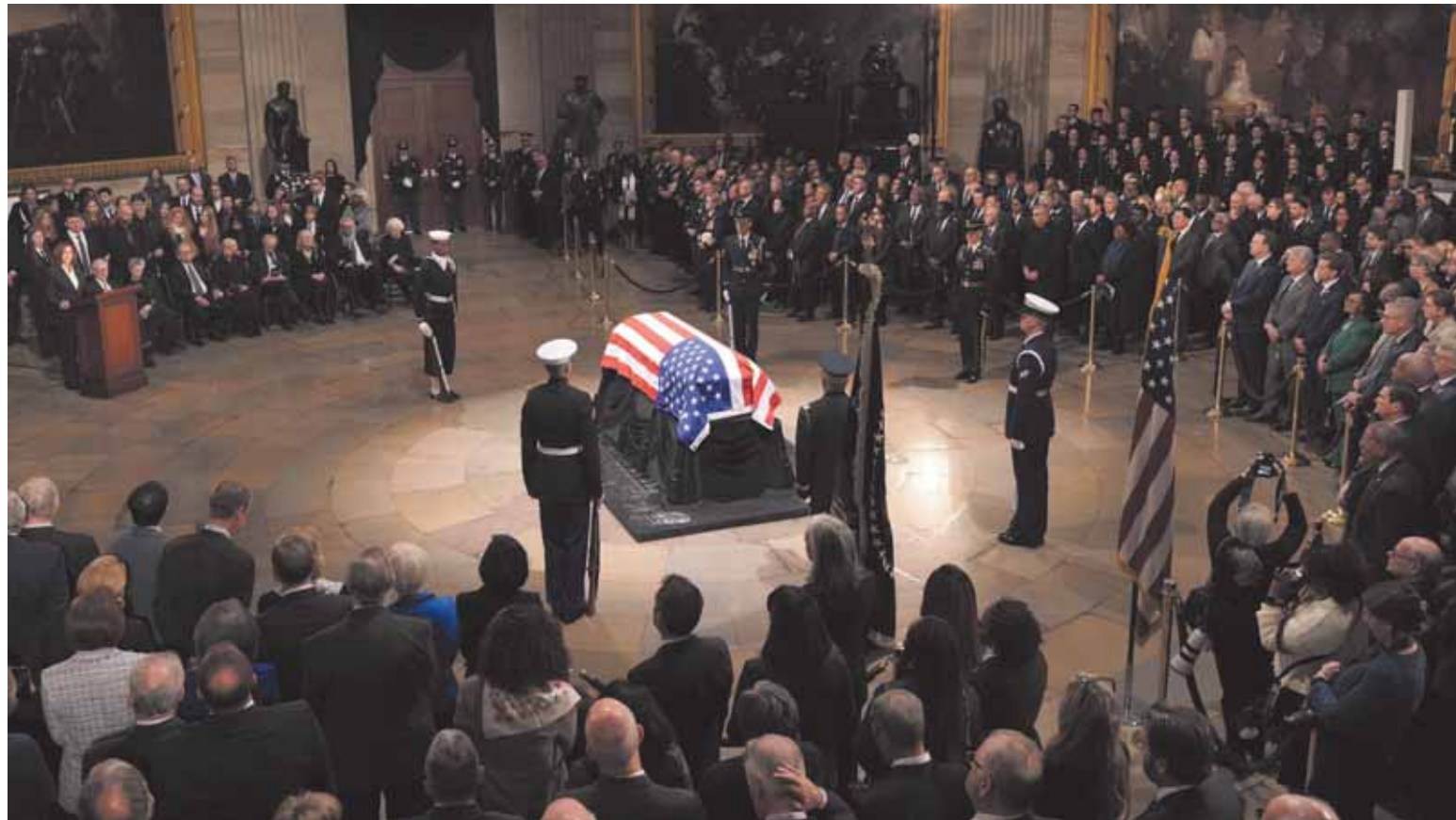
The flag-draped casket of former President Jimmy Carter lies in state during a ceremony in the Capitol on Tuesday in Washington. Carter died on Dec. 29 at the age of 100.

But if they do that, then I would tariff Denmark at a very high level," he said. Trump said he has not drawn up a plan for acquisition of Greenland yet. Hawaii was the last territorial acquisition of the United States. It was admitted as the 50th State on August 21, 1959. Alaska, the largest US State, was admitted as the 49th State on January 3, 1959. On New Year's eve, Greenland's Prime Minister Mute Egede has expressed his desire to obtain independence from Denmark. "The Greenlandic people's opportunity for independence has been adopted through the provisions of the Self-Government Act, thereby creating a legal basis for how independence can be achieved," Egede said on the eve of the new year celebrations. "A draft constitution for our country has also been prepared. Work has already begun with regard to creating the framework for Greenland as an independent state within the possibilities and provisions of the Self-Government Act," he said.