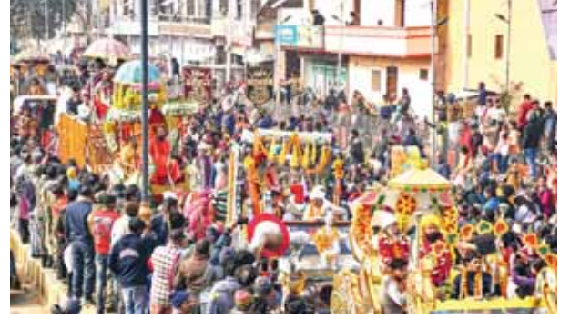
Mahants and sadhus of Shri Panch Digambar Ani Akhara, Shri Panch Nirmohi Ani Akhara and Shri Panch Nirvani Ani Akhara on Wednesday taking part in the 'Chavni Praveshi', the royal entry procession for Maha Kumbh Mela 2025, towards Sangam in Prayagraj.

The procession of the three Ani Akharas of Akhil Bhartiya Vaishnav was taken out from KP Ground with traditional fervour on Wednesday. A large number of saints came out riding on elephants, horses and camels. A large force was deployed for security arrangements. The procession of Akhil Bhartiya Shri Panch Nirmohi, Shri Panch Digambar and Shri Panch Nirvani Ani Akhara was taken out with religious fervour. With spears, swords, maces etc in their hands, the saints showcased their skills while chanting 'Jai Shri Ram' and 'Har Har Mahadev'. Extensive security arrangements were made in view of the procession. Crowds gathered on both sides of the road to see the procession (royal entry into the Mahakumbh area). Around 10,000 saints left for Sangam at 11 am on Wednesday. Saints demonstrated their skills at various places. They were welcomed with flower showers at various