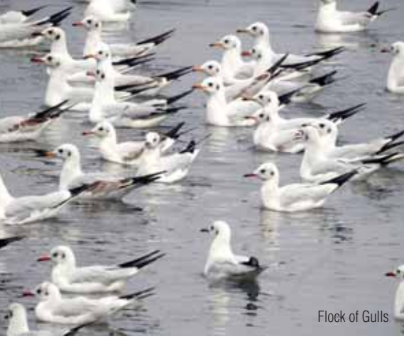
Flock of Gulls