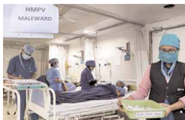
Nagpur: Preparations underway at Meditrina Hospital for patients of Human Metapneumovirus (HMPV), a day after two suspected cases of the virus were reported from the city, in Nagpur, Maharashtra.