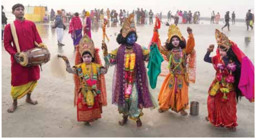
A man and children perform for alms at Sagar Island on a foggy winter morning, in South 24 Parganas