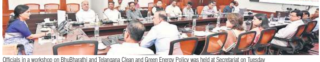
Officials in a workshop on BhuBharathi and Telangana Clean and Green Energy Policy was held at Secretariat on Tuesday