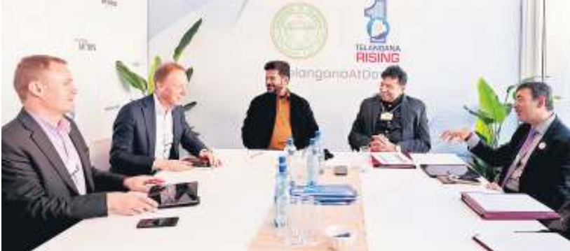
Chief Minister A. Revanth Reddy, IT & Industries Minister D. Sridhar Babu and officials of the Telangana Rising delegation meet Hein Schumacher, CEO, Unilever, and Willem Uijen, Chief Supply Chain Officer, Unilever, to discuss investment and business opportunities for the global FMCG giant in Telangana

"We are here to support Unilever's growth in Telangana. This partnership will grow alongside our commitment to sus-