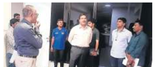
HYDRAA Commissioner AV Ranganath inspecting the proposed building for HYDRAA police station

The Commissioner emphasised the need for proper infrastructure, including designated rooms and cabins resembling those of a standard police station. He also reviewed arrangements for complaint registration and facilities for complainants visiting the sta-