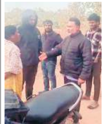
Real Estate broker, who received a slap from Eatala Rajender, arguing with local woman

Rajender said, "I came here after informing the local Minister and the police. However, the goons tried to threaten the poor even after I came here. The goons warned the poor to inform me. The police are losing their respect day-by-day. We will chase away goons while taking the responsibility to protect the poor if police fail to provide security to the poor."