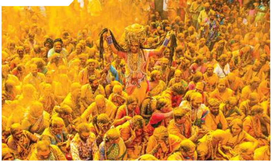
Devotees celebrate 'Komuravelli Mallanna Jathara' festival, at Komuravelli in Siddipet