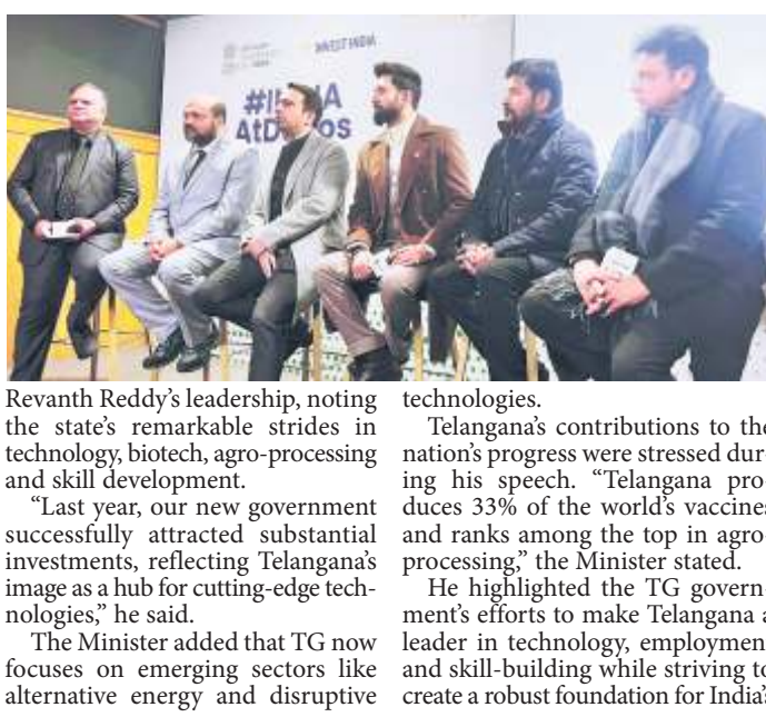
Revanth Reddy's leadership, noting the state's remarkable strides in technology, biotech, agro-processing and skill development. "Last year, our new government successfully attracted substantial investments, reflecting Telangana's image as a hub for cutting-edge technologies," he said. The Minister added that TG now focuses on emerging sectors like alternative energy and disruptive

PNS ■ HYDERABAD The World Economic Forum's annual summit kicked off on a grand note with the inauguration of the India Pavilion, a celebration of India's federal spirit and its hopes for global leadership. Telangana Chief Minister A. Revanth Reddy, Union Minister Jayant Chaudhary, Telangana Industries Minister Sridhar Babu and several other state leaders, officials and dignitaries attended the event. Speaking at the India Pavilion, Sridhar emphasised the collective strength of India's federal structure. "Bringing all states under a single banner showcases our unity in diversity. Together, we hope to make India a superpower, elevating humanity to the highest level," he stated. Sridhar highlighted Telangana's achievements under Chief Minister