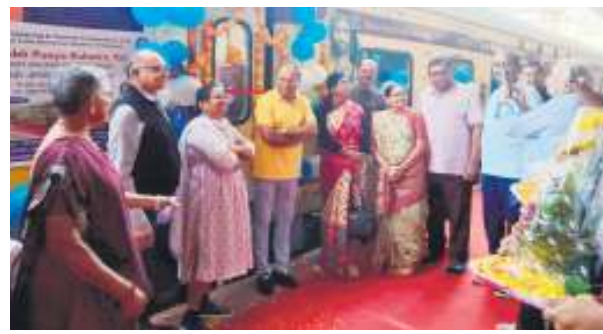
A senior citizen and IRCTC officials inaugurating the Maha Kumbh Bharat Gaurav train at Secunderabad railway station on Monday

This 7-night, 8-day journey offers comprehensive facilities like rail and road transport, accommodation, meals, onboard security with CCTV cameras, travel insurance and