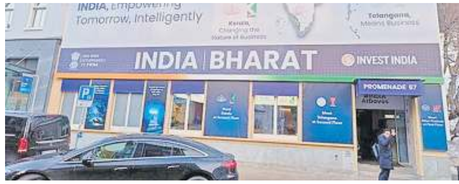
INDIA AT DAVOS

A revised fiscal consolidation roadmap starting FY27 is crucial as high deficit and debt levels would remain a highlight of Indian public finances. "Notwithstanding the growth slowdown in FY25 and the likely minor growth improvement in FY26, Ind-Ra expects the government to adhere to its fiscal consolidation roadmap provided in the medium-term fiscal policy-cum-fiscal strategy statement," it said in a statement.