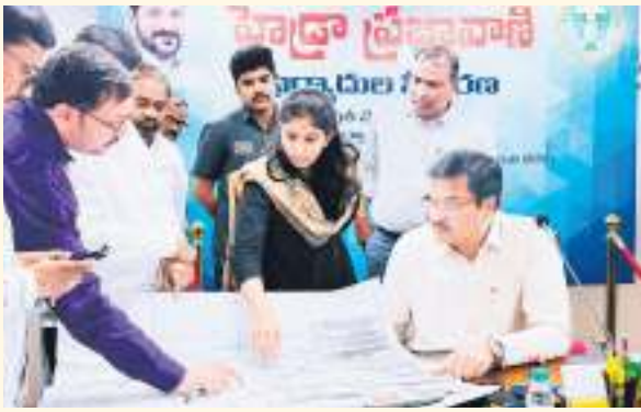
The Prajavani programme at HYDRAA office on Monday

Anjaneya Nagar, Moosapet residents have said that the 2,000-square-yard park site has been encroached upon, with locals reporting threats and assaults