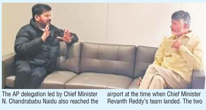
The AP delegation led by Chief Minister N. Chandrababu Naidu also reached the airport at the time when Chief Minister Revanth Reddy's team landed. The two

PNS ■ HYDERABAD The Telangana Rising delegation led by Chief Minister Revanth Reddy landed at Zurich in Switzerland on Monday. The Telangana diaspora accorded a warm welcome to the CM's delegation at the Zurich Airport. The delegation will attend the World Economic Forum annual conference at Davos. The CM is accompanied by IT and Industries Minister D. Sridhar Babu and senior Industries Department officials.