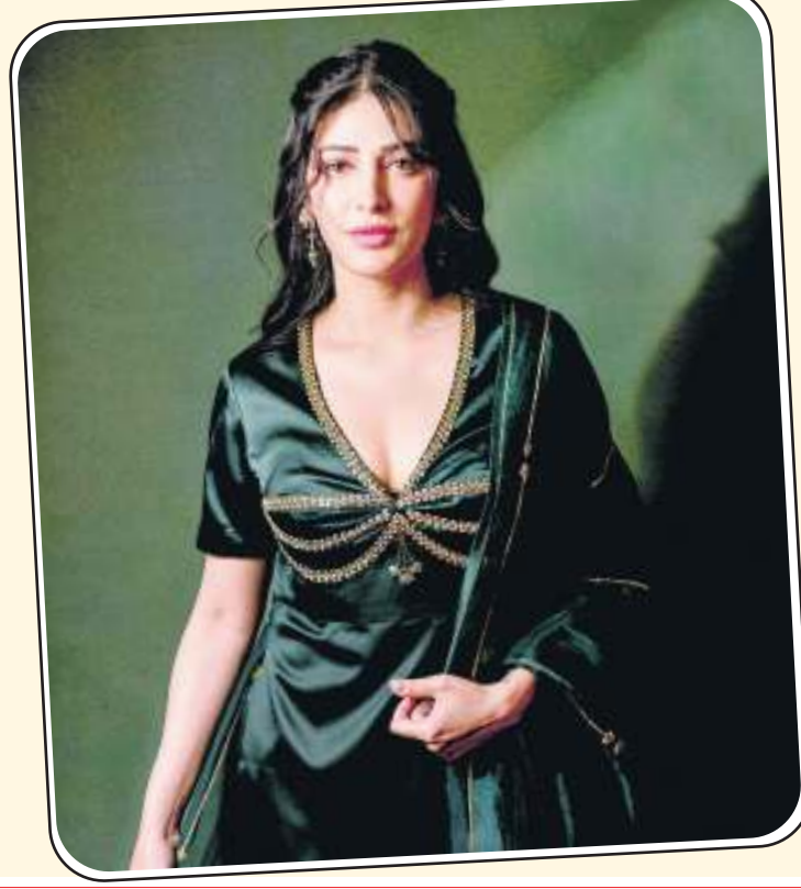
Actor Shruti Haasan stunned in pieces from Raw Mango's recently launched collection, Garland - Festive 2024, showcasing the brand's unique fusion of tradition and modernity. Shruti wore the Apsara kurta in dark green silk satin, featuring cascading zardozi embroidery that reimagines the garlanded statues of the Mauryan empire. She paired it with the Nivriti odhani in silk organza, adorned with a linear pattern of hand embroidery along the border, reminiscent of the jhol of the three-string garlands. Completing the look, Shruti wore the matching Varga pant, making a bold and sophisticated statement.