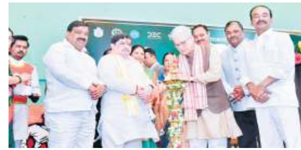
Governor Jishnu Dev Varma, along with Transport Minister Ponnamp Prabhakar, inaugurating a student awareness programme and Traffic Park at Delhi Public School, Nacharam on Monday

The programme included a guard of honour by the ATT Team, a lighting ceremony (Deepaprajwalana), and visits to the Route Lab, Art Gallery,