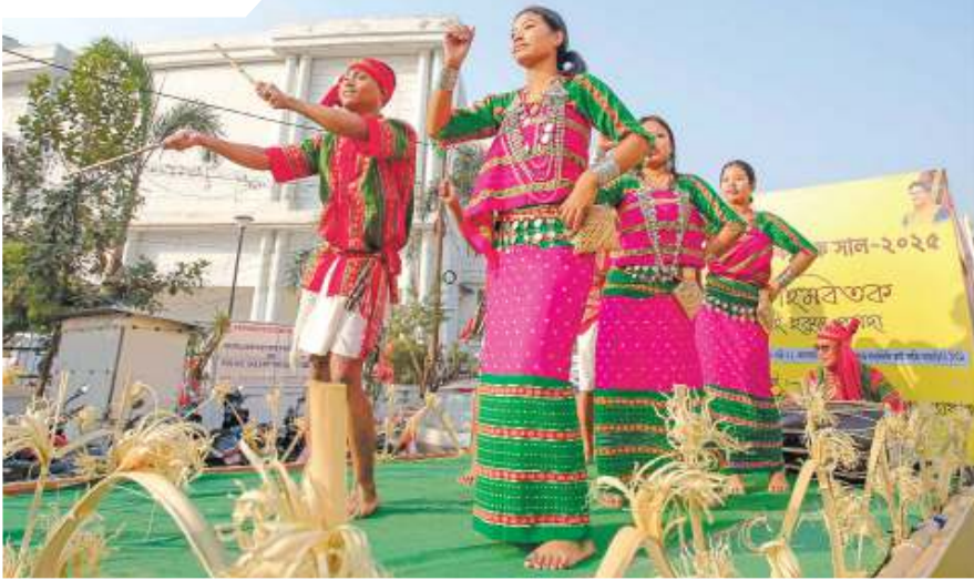
School students perform during Kokborok Day celebrations, in Agartala