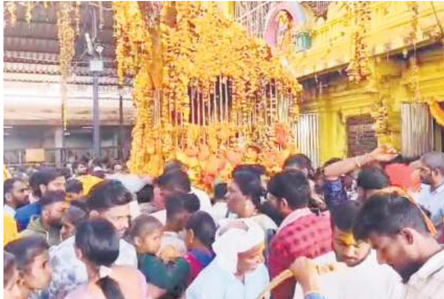
Devotees arriving to witness Komuravelli Mallikarjuna Swamy Jatara on Sunday