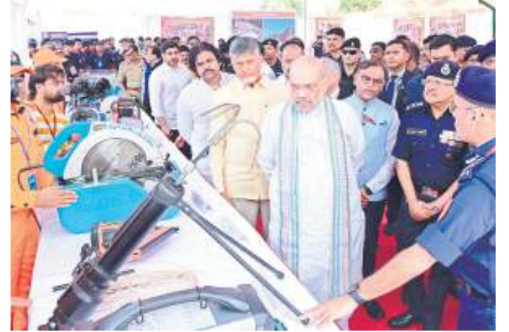
PNS ■ VIJAYAWADA

Union Home Minister Amit Shah on Sunday highlighted India's global leadership in disaster management, attributing the country's success to its resilient infrastructure and the adoption of a 'zero casualty' approach during disasters.