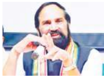
Bhatti Vikramarka is committed to ensuring food security for all those eligible through a fair and transparent process.

He said that the Congress government led by Chief Minister Revanth Reddy and Deputy Chief Minister