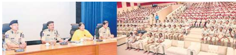
Commissioner CV Anand interacts with the police constables at ICCC Building, Banjara Hills on Sunday

On Sunday, an interaction session was held with the constables at the ICCC building, Banjara Hills. The police constables