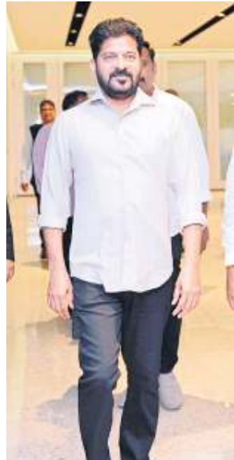
PNS ■ HYDERABAD

Mangalpalle and Ibrahimpatnam have become hubs for girls' and boys' hostels, catering to students from