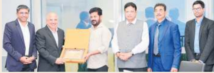
CM A Revanth Reddy and Industries Minister D. Shridhar Babu with Capital Land Group representatives at Singapore on Sunday