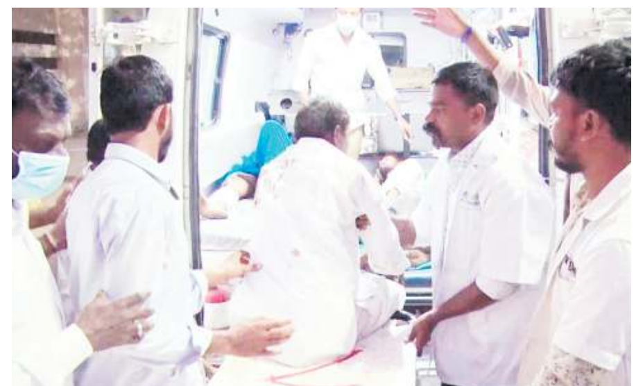
Devotees, who were injured in an accident, being administered first aid in an ambulance in Adilabad on Sunday

The van turned turtle and fell into a ditch. The rescuers had to struggle to extricate people from the van.