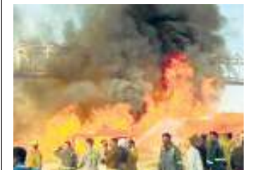
MAHAKUMBH NAGAR (UP)

A big fire broke out at the Maha Kumbh Mela here on Sunday due to a cylinder blast, engulfing 18 tents in Sector 19, officials said. No casualty was reported in the incident.