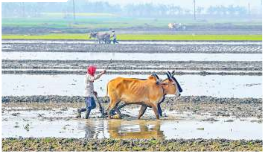
A farmer prepares an agricultural land for paddy cultivation, in Nadia