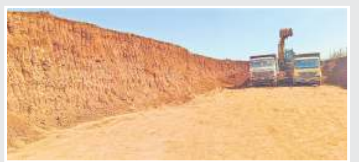
Machinery for soil mining in Parigi constituency