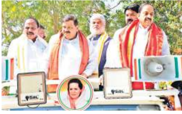
Agriculture Minister Tummala Nageshwara Rao visits Sardar Nagar of Shadnagar mandal on Monday

There are no cuts in 'Rythu Bharosa' as some newspapers and opposition leaders say, Agriculture Minister Tummala Nageshwara Rao said. Tummala visited Sardarnagar and Shabaad Mandal on Monday. "Opposition parties are criticising the government saying that they are unable to swallow and gag after seeing the government's announcement," Tummala said.