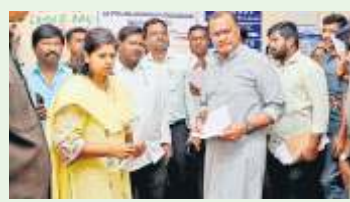
Roads and Buildings Minister Komatireddy Venkat Reddy inspecting Government Hospital in Nalgonda on Monday

The building is being constructed to assist pregnant women visiting the hospital daily for prenatal care, as well as those admitted for delivery and their attendants. The Minister emphasised the importance of quality construction and a quick completion timeline, directing the contractor accordingly. During his visit, the Minister also inspected various hospital wards and emphasised the establishment of a ward for postnatal care. He directed the installation of air conditioners in the ward under the Prake Foundation's guidance. The ward will