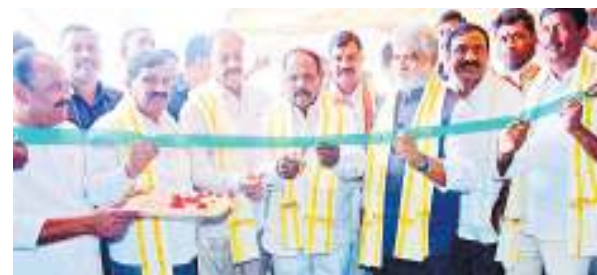
Assembly Speaker Gaddam Prasad Kumar and Agriculture Minister Tummala Nageswara Rao inaugurating shopping complex and warehouse in Chevella constituency on Monday