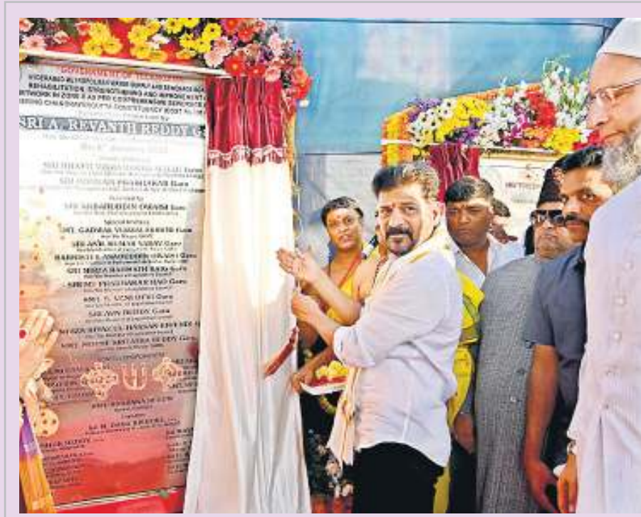
Chief Minister A Revanth Reddy inaugurating the Zoo park - Aramghar flyover in Hyderabad on Monday