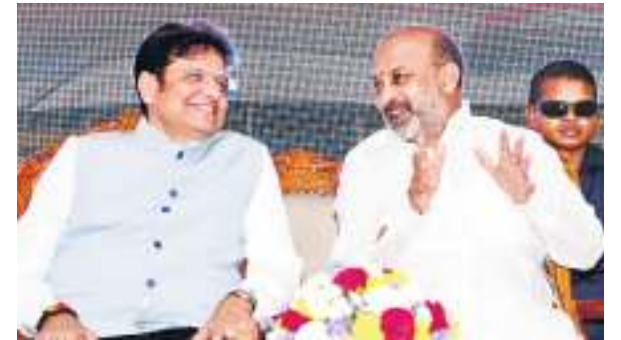
Union Minister of State for Home Affairs Bandi Sanjay Kumar and Telangana IT Minister Duddilla Sridhar Babu at the inauguration of Cherlapally Railway Terminal on Monday

The CEO emphasized that new enrolments, corrections and roll purification will continue during the updation period. Eligible citizens turning 18 on subsequent quality-