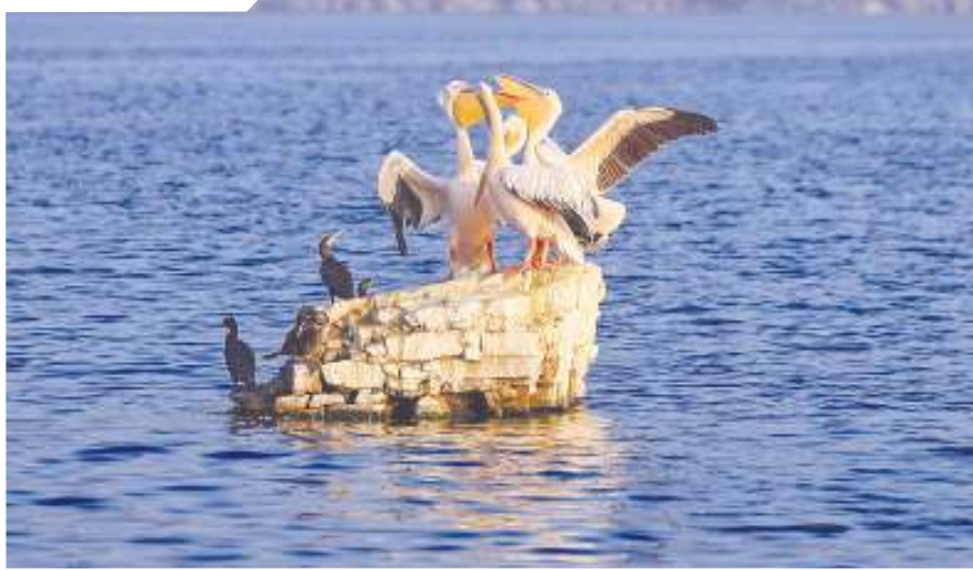
Flocks of pelicans and cormorants congregate at Man Sagar Lake, in Jaipur