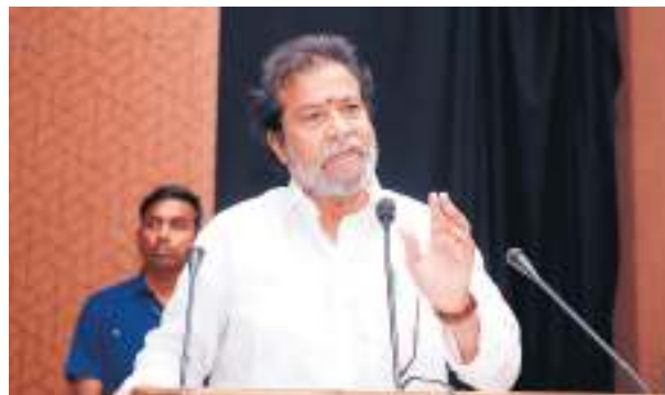
Health Minister Damodar Raja Narasimha speaking at the e-Aushadhi workshop

Three-member committees will be established in