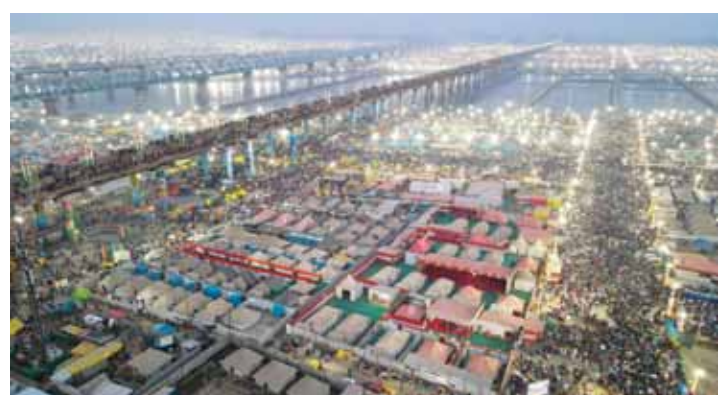
Devotees gather at the Sangam on the eve of 'Mauni Amavasya' during the Maha Kumbh Mela 2025, in Prayagraj, Uttar Pradesh.

accommodate the influx of devotees. To prevent overcrowding, the administration has encouraged pilgrims to bathe at the ghat nearest to their entry points. Devotees entering from different zones will be directed to designated ghats based on their location, ensuring a smooth flow of pilgrims. Special arrangements have been made for different groups of devotees. The Airavat Sangam Ghat will host pilgrims from eastern Uttar Pradesh, Bihar, Odisha, West Bengal, and northeastern states. Devotees from Madhya Pradesh, Gujarat, Rajasthan, Maharashtra, and southern states will bathe at specially developed ghats in Aarail while pilgrims from Delhi, western Uttar Pradesh, Haryana, Punjab, and Uttarakhand will be accommodated at ghats extending from Sangam to Nagvasuki. Separate ghats have been reserved for saints, seers, and their disciples from various Akharas, ensuring