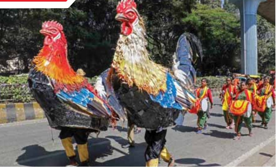
Folk artists take part in a procession on the eve of the unveiling of 'Bhuvaneshwari Devi' statue, in Bengaluru