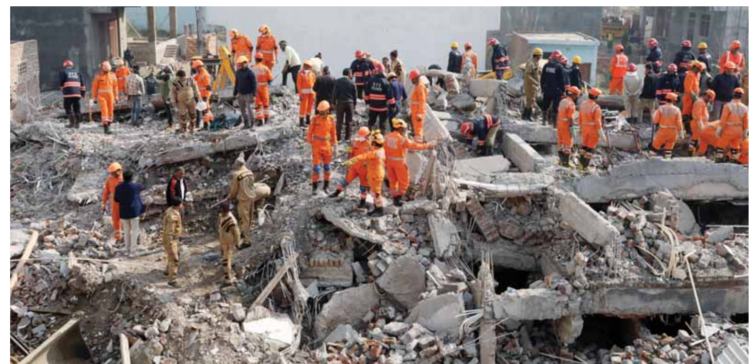
Rescue work underway after a four-storey building collapsed at Burari