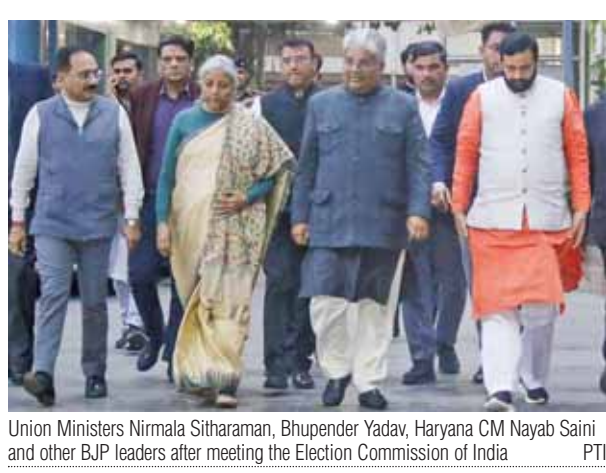
Union Ministers Nirmala Sitharaman, Bhupender Yadav, Haryana CM Nayab Saini and other BJP leaders after meeting the Election Commission of India.

The Election Commission (EC) on Tuesday asked AAP national convener Arvind Kejriwal to substantiate with facts his allegations of poisoning of Yamuna River and mass genocide. The poll body has sought a response, a proof from the AAP national convener by 8 pm on 29 January. The Commission has asked the AAP led Delhi government to provide evidence of Haryana government 'poisoning' Delhi water supply. This comes after both the BJP and Congress had complained to the poll panel against Kejriwal for levelling allegations of poisoning of