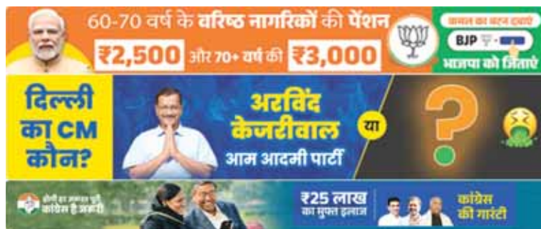
In the last 30 days: BJP spent ₹2.5Cr, followed by the AAP (₹77 Lakhs) and the Congress (₹23 Lakh)

In the intense race to wrest power from Aam Admi Party (AAP), the Congress which ruled 15 years and BJP which has not been in Delhi politics for about three decades now and incumbent AAP looking forward to retain itself have gone for an aggressive campaign by making optimum use of the available social media platforms. Digital platform has become the primary battleground for political messaging, overshadowing traditional forms of campaigning for the February 5 Delhi assembly poll. An analysis conducted by The Pioneer highlights the increasing reliance on digital reach by these political parties, with the BJP leading the charge in terms of spending on platforms like Facebook,