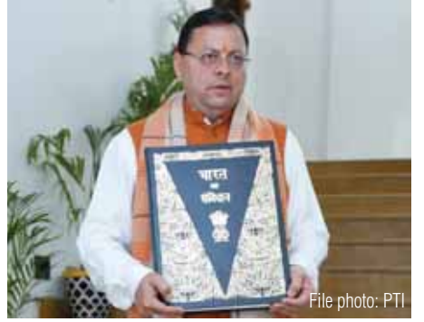
PIONEER NEWS SERVICE ■ DEHRADUN/NEW DELHI

Uttarakhand is all set to implement the Uniform Civil Code (UCC) on the occasion of Republic Day making it the first State in the country. Sources said a cabinet meeting led by Chief Minister Pushkar Singh Dhami on Monday decided to start the process of enforcement of the UCC on January 26 as the cabinet also approved the rules under UCC as how to move ahead in the historic step. In fact last month the State government had announced that UCC would be implemented in January and with municipal elections scheduled for January 23 the results of which would be declared on January 25, sources said the government is prepared to announce UCC implementation on Republic Day. "The mandatory communiqué in this regard will be given the Union Home Ministry sooner," said a senior government source. Set to become the first Indian state to roll out the UCC, its rules manual includes provisions for tatkal registration, door-to-door services in remote areas and a state-wide mock drill on Tuesday. The list of services provided on the portal includes registration of marriage, divorce, and live-in registrations, termination of live-in relationships, intestate succession and declaration of legal heirs, testamentary successions, appeal in cases where application is