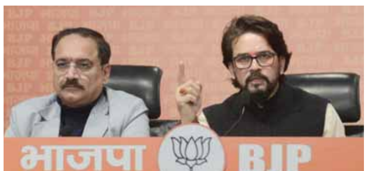
BJP MP Anurag Thakur with Delhi party President Virendra Sachdeva addresses a press conference, in New Delhi.

and free 'clean drinking' water. There were speculations that the second part of the manifesto will also include 300 free units of electricity for households. However, party sources said that the BJP, which is vying to end its drought of not being in power in the national capital for more than two decades, will wait for the ruling party to first announce its scheme regarding electricity bill and strategies accordingly if they want to increase the units. The AAP led Delhi government currently has a scheme that provides electricity free up to 200 units for households. In a bid to counter the AAP's free bus ride for women, which proved