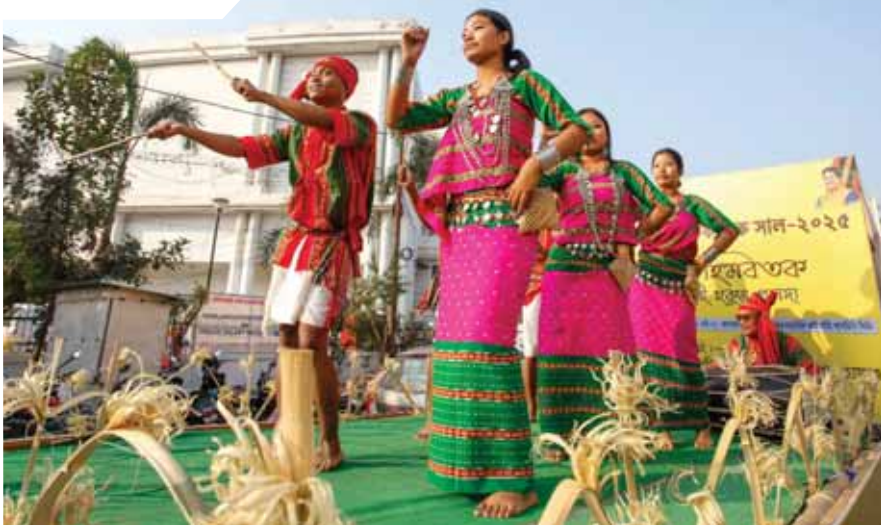
School students perform during Kokborok Day celebrations, in Agartala