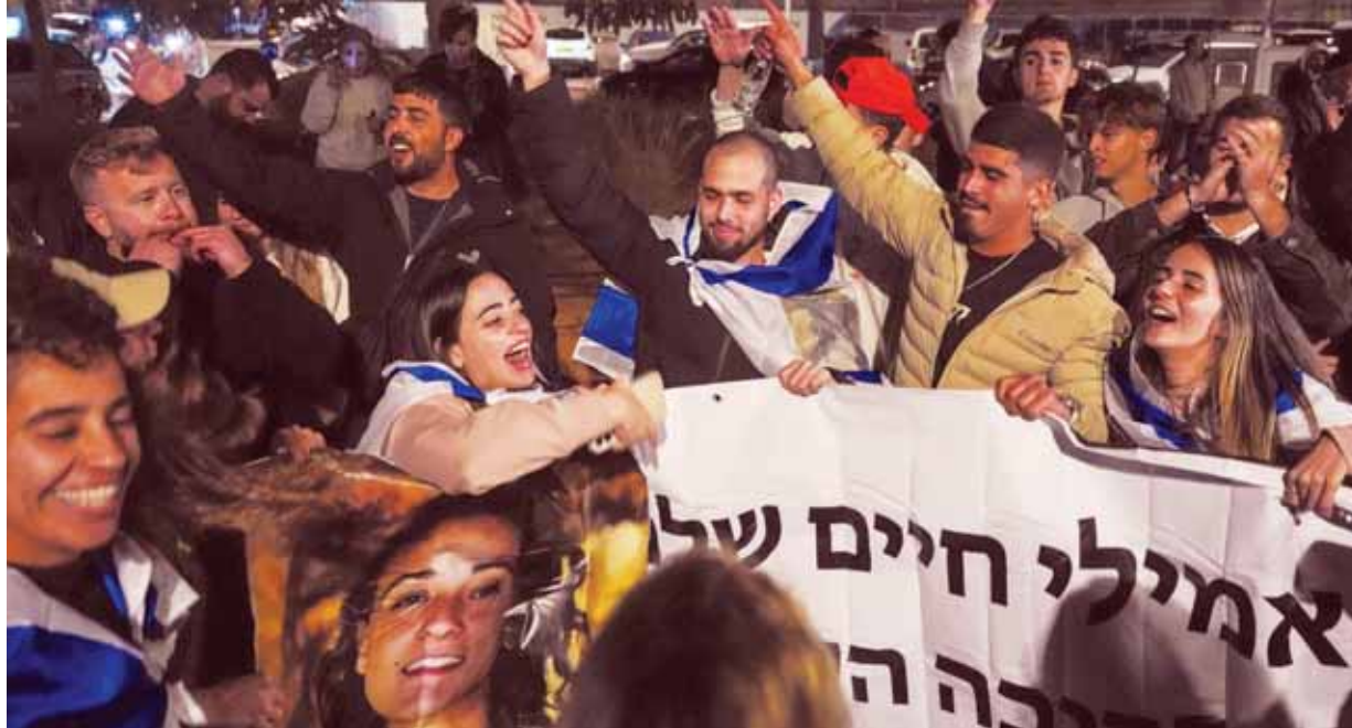
Israelis celebrate the release of three hostages who had been held captive by Hamas in Gaza as they gather in Tel Aviv, Israel, on Sunday

After 15 months of collective grief and anxiety, three Israeli hostages left Hamas captivity and returned to Israel, and dozens of Palestinian prisoners walked free from Israeli jail, leaving both Israelis and Palestinians torn between celebration and trepidation as the ceasefire between Israel and Hamas took hold Sunday. The skies above Gaza and Israel were silent for the first time in over a year, and Palestinians began returning to what was left of the homes they fled across the war-ravaged enclave, started to check on relatives left behind and, in many cases, to bury their dead. After months of tight Israeli restrictions, more than 600 trucks carrying humanitarian aid rolled into the devastated territory.