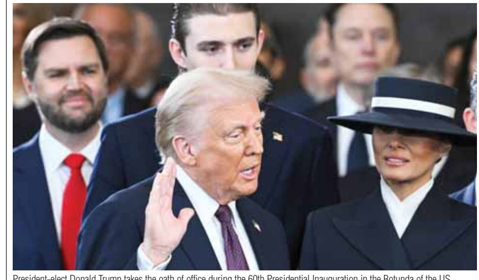
President-elect Donald Trump takes the oath of office during the 60th Presidential Inauguration in the Rotunda of the US Capitol in Washington.

Donald J Trump was on Monday sworn in as the 47th president of the United States, marking his remarkable return to power for a second term four years after he left the American capital as a pariah. The 78-year-old Republican leader storms back to the White House with a strongman persona and a vision of an all-powerful presidency with a promise to aggressively reset US policies in a range of domains, including immigration, tariffs and energy. Trump registered a spectacular victory over his Democratic