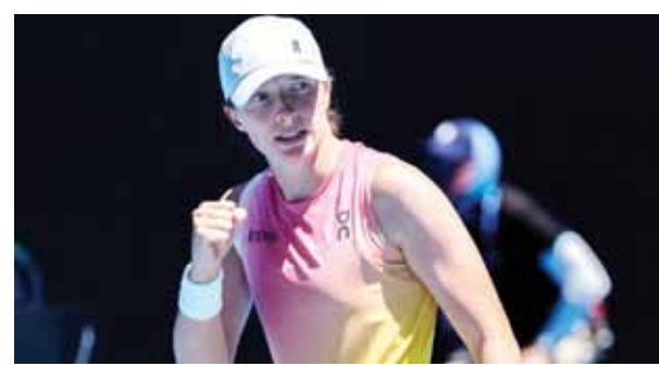
for an anabolic steroid in March. The resolution of Swiatek's case was made public by the ITIA in late November. She already had been sidelined provisionally, missing three tournaments in October, and finished her ban during the sport's offseason. "WADA sought advice from external legal counsel, who considered that the athlete's contamination explanation was well evidenced, that the ITIA decision was compliant with the World Anti-Doping Code, and that there was no