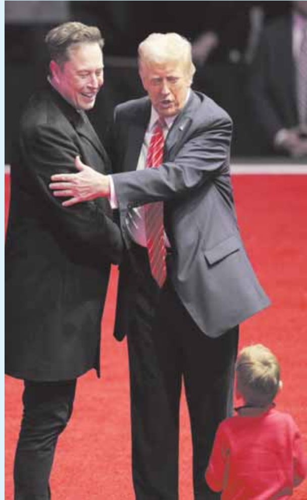
Elon Musk, left, and President-elect Donald Trump embrace as they look at Musk's son X vJ A-Xii, at a rally ahead of the 60th Presidential Inauguration, Sunday, in Washington.

On the eve of his inauguration, President-elect Donald Trump promised his supporters and countrymen that he will act at historic speed to fix every single crisis facing the United States. "Starting tomorrow, I will act with historic speed and strength and fix every single crisis facing our country. We have to do it," Trump told his supporters at the Capitol One Arena, which was full to its capacity of 20,000 for a "Make America Great" victory celebration, with a large number of people waiting outside in chilling cold. Trump, 78, made a stunning comeback when he defeated Vice President Kamala Harris in last year's general election to become only the second person in US history to be sworn in as the president after a gap of four years. Trump, who will replace Joe Biden as the 47th president of the United States on Monday, arrived at the US Capitol on Saturday. On a jam-packed day full of engagements, Trump addressed thousands of his supporters at what he called a "victory rally." "Before even taking office, you are already seeing results that nobody expected to see. Everyone is calling it the Trump effect. It's you. You're the effect," Trump said. "Since the election, the stock market has surged, while small business optimism has soared a record 41 points to a 39-year high. Bitcoin has shattered one record after another. Major investment company DMACC Properties has announced that it will invest between USD 20 billion and USD 40 billion in the US.