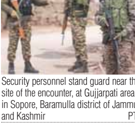
Security personnel stand guard near the site of the encounter, at Gujjarpatli area in Sopore, Baramulla district of Jammu and Kashmir.

In an overnight anti-terrorist operation, a soldier of the Indian Army laid down his life in the line of duty in the Gujjarpatli area of Sopore in North Kashmir's Baramulla district on Monday. This is the first incident of terrorist-related violence this year in which a soldier has sacrificed his life in the valley. Braving adverse weather conditions, the security forces have been maintaining a tight vigil along the Line of Control and the International Border amid reports of desperate infiltration bids by heavily armed terrorists from across the border in Pakistan. Meanwhile, the entire security grid has been beefed up in the run-up to the Republic Day celebrations across the Union Territory of Jammu and Kashmir.