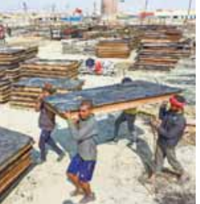
Workers move the charred remains of a tent site, a day after a fire broke out at the Maha Kumbh Mela due to a cylinder blast, in Prayagraj.

A fire broke out near the Kinnar Akhara camp in Sector 16 of the Maha Kumbh on Monday morning, triggering panic among devotees and camp residents. This is the second fire incident at the Kumbh in two days, raising concerns about fire safety measures at the massive religious gathering.