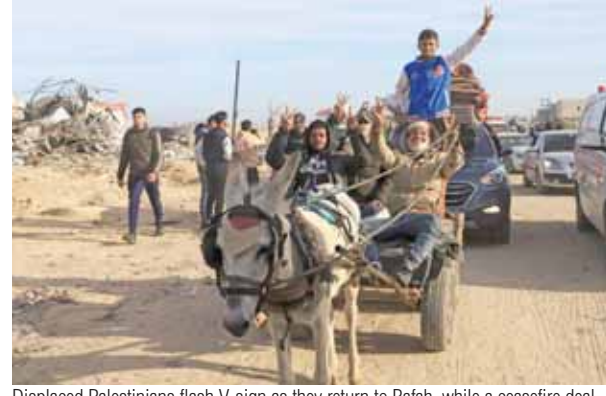
Displaced Palestinians flash V-sign as they return to Rafah, while a ceasefire deal between Israel and Hamas went into effect, in Rafah, Gaza Strip.