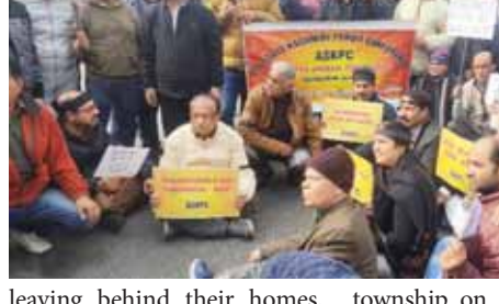
leaving behind their homes, businesses, and ancestral heritage. Paying solemn tributes in the memory of countless martyrs, killed at the hands of Pakistan-sponsored terrorists, the members of the Kashmiri Pandit community, sporting bandanas, took out a solidarity march and also organized a signature campaign in the Jagti