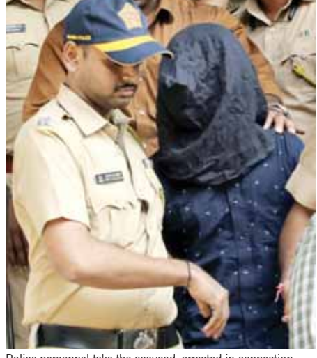
Police personnel take the accused, arrested in connection with the alleged attack on Bollywood actor Saif Ali Khan, to a hospital for medical examination before producing him at a court, in Mumbai.