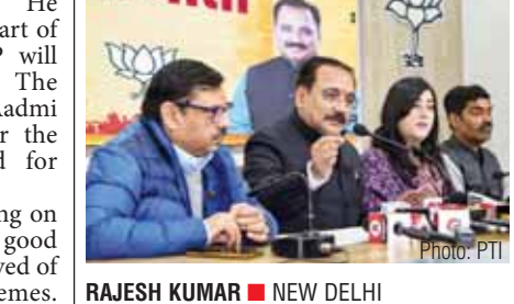
Arvind Kejriwal and other AAP leaders sitting at a table.