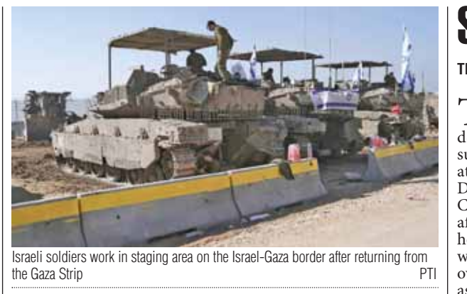
Israeli soldiers work in staging area on the Israel-Gaza border after returning from the Gaza Strip