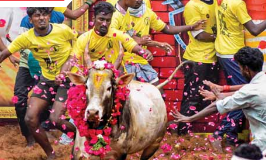
People try to tame a bull as they participate in the 'Jallikattu' event as part of 'Pongal' celebrations, in Tiruchirappalli