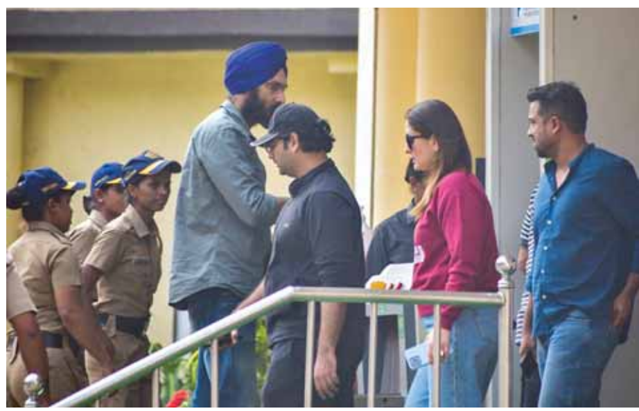
Bollywood actor Kareena Kapoor at the Lilavati Hospital where actor Saif Ali Khan was admitted after he was injured in an attack by an intruder with a knife, in Mumbai