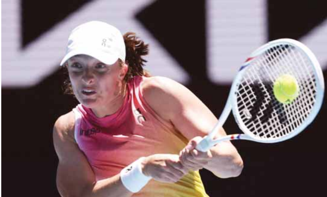
during her match against Anisimova to get treatment on her back from a trainer. After advancing beyond the second round for the first time at Melbourne Park, the No. 61-ranked Raducanu was confident she'd recover in time for her next challenge against Swiatek. "It'll be a very good match for me, another opportunity to test my game," she said. "Going into it, I

an early break in the second set to hold off Amanda Anisimova 6-3, 7-5. Taylor Fritz hasn't wasted any time advancing to the third round, dropping just eight games across two rounds and spending just over three hours on court. The 2024 U.S. Open runner-up and No. 4 seed beat Cristian Garin 6-2, 6-1, 6-0 to move into a third-round match against 38-year-old Gael Monfils, who last week became the oldest player to win an ATP Tour title. Also advancing on the men's side were local hope Alex de Minaur, seeded 8th, No. 16 Lorenzo Musetti, No. 19 Karen Khachanov and No. 21 Ben Shelton, who beat Pablo Carreno Busta 6-3, 6-3, 6-7 (4), 6-4. Raducanu has struggled with injuries since her breakthrough major in 2021, when she became the first qualifier to win a Grand Slam singles title. She didn't play a warmup tournament ahead of this year's Australian Open because of a muscle strain and needed time