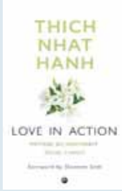
Book: Love in Action: Writings on Nonviolent Social Change Author: Thich Nhat Hanh Publisher: Alpha book company Price: ₹399