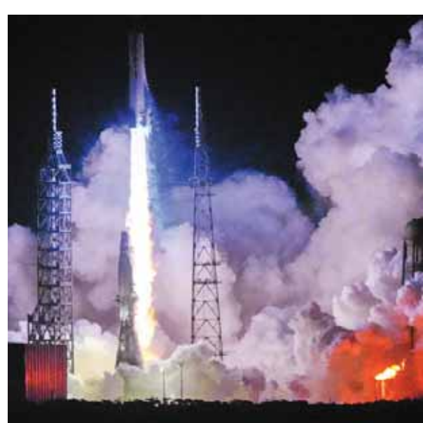
Blue Origin's New Glenn rocket lifts off from Launch Complex 36 at the Cape Canaveral Space Force Station, Thursday in Cape Canaveral.

13 minutes later, a feat that drew quick praise from SpaceX's Elon Musk. Bezos — taking part in the launch from Mission Control — declined to disclose his personal investment in the program.