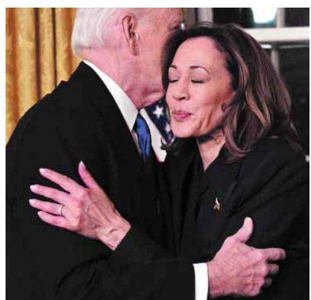
President Joe Biden hugs Vice President Kamala Harris after giving his farewell address from the Oval Office of the White House Wednesday, in Washington.

President Kamala Harris in both popular votes and the electoral college. Biden said that he wanted to warn the country of dangers that are concerning him. "That's a dangerous concentration of power in the hands of a very few ultra-wealthy people," he said.