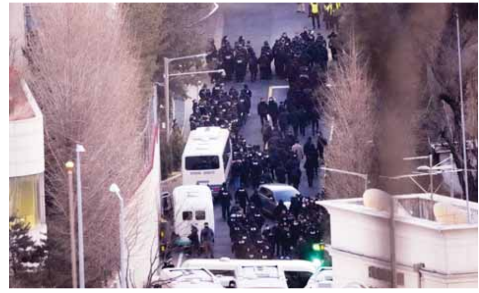
Investigators from the state anti-corruption agency and police officers make their way to the residence of impeached President Yoon Suk Yeol to execute a warrant to detain Yoon in Seoul, South Korea on Wednesday.

tion of martial law December 3 as a legitimate act of governance against an "anti-state" opposition employing its legislative majority to thwart his agenda.