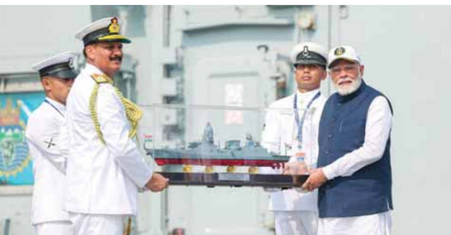
Prime Minister Narendra Modi with Chief of the Naval Staff Admiral Dinesh K. Tripathi during the commissioning ceremony of three Indian Navy warships INS Surat, INS Nilgiri and INS Vaghsheer, at the Naval Dockyard in Mumbai