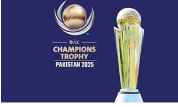
opening match is on 19th the opening ceremony can be expected either on the 16th or 17th," the source added. He said the schedule of the opening ceremony would depend on the warm-up matches list. The source said that recently three Indian nationals, who were a part of the ICC delegation which came to Pakistan, were promptly issued visas once the world body sent their names to the PCB.

PTI ■ LAHORE The opening ceremony of the Champions Trophy will be held either on February 16 or 17 and the Pakistan Cricket Board (PCB) is confident that India captain Rohit Sharma will be in attendance at the event. The PCB source also said that it is awaiting communication from the ICC on the schedule of the customary captains' photo-shoot and the pre-event press conference. The eight-team tournament will get underway on February 19 in Karachi. However, India will play all their matches in Dubai, starting with the clash against Bangladesh on February 20, after refusing to travel to Pakistan owing to the security concerns. The source said PCB has procured all relevant clearances from its government to promptly