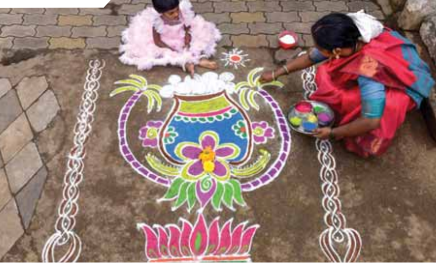
A woman makes 'rangoli' during 'Pongal' festival celebrations, in Chikkamagaluru