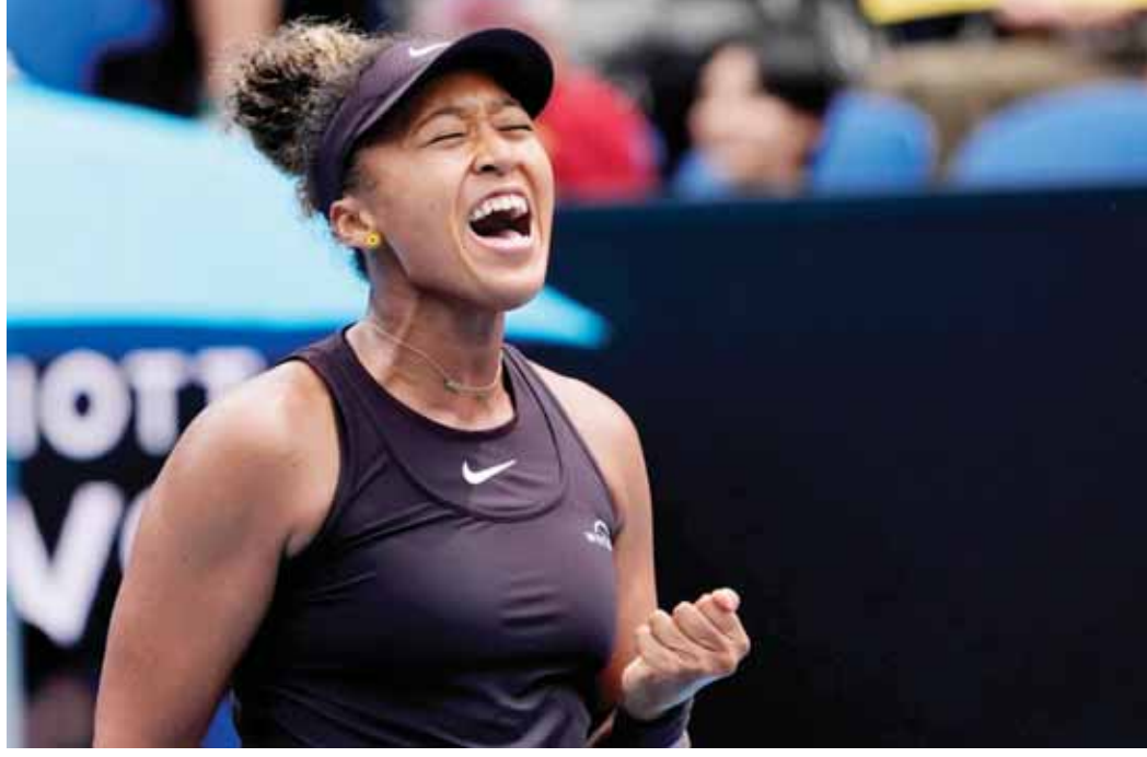
getting her game back together, including a memorable and narrow loss to then-No. 1 Iga Swiatek at the French Open. This, though, followed a win against 2022 U.S. Open semifinalist Caroline Garcia in Melbourne and meant the progress is real. "It definitely was something that is a goal of mine, especially after last year; I wasn't able to beat a seed in a Grand Slam," Osaka

forgot about that disappointing start and came all the way back to win 1-6, 6-1, 6-3 on Wednesday. What was her mindset? "Just be aware and try not to get so negative on yourself. I think, for me, the score in the first set was very dramatic, but there was key points that I could have maybe won a game here or there," Osaka explained afterward. "So I kept trying to tell myself that." This was, in some ways, a significant moment for Osaka, who once reigned atop women's tennis, winning four Grand Slam titles — two at the Australian Open, two at the U.S. Open — and ascending to No. 1 in the WTA rankings. The victory allowed her to reach the third round at a major tournament for the first time since the 2022 season. Getting to that stage was not considered a big deal at one point for her. But time off because of mental health breaks and then a pregnancy — Osaka's daughter, Shai, was born in July 2023 — changed things. Since returning to action a year ago, Osaka has shown signs of