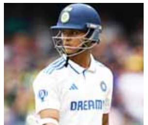
"The selectors are expected to announce the squad on January 20, during which they will follow the due process of checking for the availability of every player. Rohit will also be approached around the time for selection," a Mumbai Cricket Association (MCA) official told PTI. The 37-year-old is looking to put an end to his poor run with the bat after he managed a mere 31 runs in three Tests that he played against Australia in the Border-Gavaskar Trophy.

PTI ■ MUMBAI India opener Yashasvi Jaiswal on Wednesday joined the Mumbai camp after confirming his availability for the next round of Ranji Trophy but skipper Rohit Sharma was not to be seen after turning up for a couple of practice on the opening day of training. Rohit, who batted alongside Mumbai captain Ajinkya Rahane on Tuesday here at the Wankhede Stadium, is expected to resume training in a day or two. However, it remains to be seen if the incumbent Indian skipper would play in the domestic giant's next Ranji Trophy fixture. Rohit is yet to confirm his availability for the Elite Group A contest against Jammu and Kashmir starting on January 23 but so far, no formal discussions have been taken place.