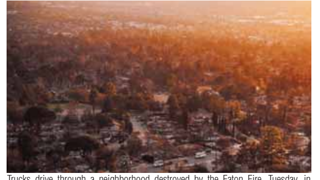
Trucks drive through a neighborhood destroyed by the Eaton Fire, Tuesday, in Altadena, Calif.

Easing winds delivered a brief but much-needed reprieve to firefighters Tuesday as they battled two massive blazes burning in the Los Angeles area, and the National Weather Service pushed back its unusually dire warning of critical fire weather until early the following day.