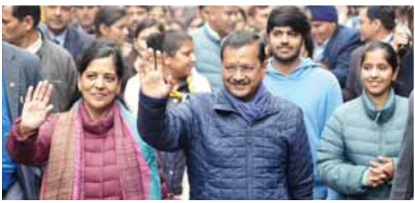
AAP National Convener Arvind Kejriwal file his nomination for Delhi Assembly polls