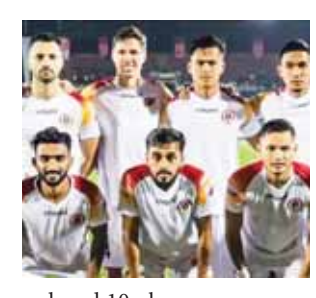
reduced 10 players. In an emotional plea to the sports minister, East Bengal highlighted how the "refugees club" tag has led to their ongoing marginalisation in Indian football. "Fight, Fight and Fight -- this has been the perennial motto of East Bengal club for the last 150 years. This club and its supporters have endured the tumultuous period pre and post-partition only through its fighting spirit. "While the displaced people fought tooth and nail for their substance, the club had to