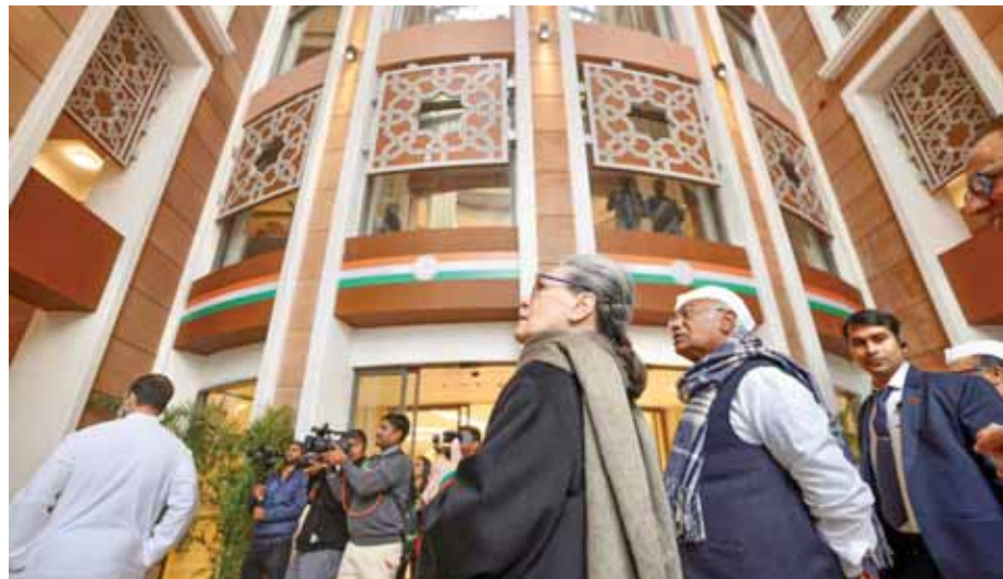
Congress President Mallikarjun Kharge with Congress Parliamentary Party chairperson Sonia Gandhi during the inauguration of the new All India Congress Committee (AICC) headquarters 'Indira Bhawan', in New Delhi

that grand old party is fighting the BJP, the RSS and the Indian State itself. Sharing a video clip of Rahul's remarks, BJP IT department head Amit Malviya said, "Rahul Gandhi has now declared an open war against the Indian State itself. This is straight out of George Soros's playbook." The BJP president charged that the Congress has a history of encouraging all those forces who want a weak India. "Their greed for power meant compromising the nation's integrity and betraying the trust of the people," Nadda said, adding, people of India are wise, and they have decided they will always reject Rahul Gandhi and his rotten ideology. At a press conference, BJP spokesperson Gaurav Bhatia said Rahul Gandhi had taken oath to preserve the country's sovereignty and integrity but is now speaking fighting the Indian state.