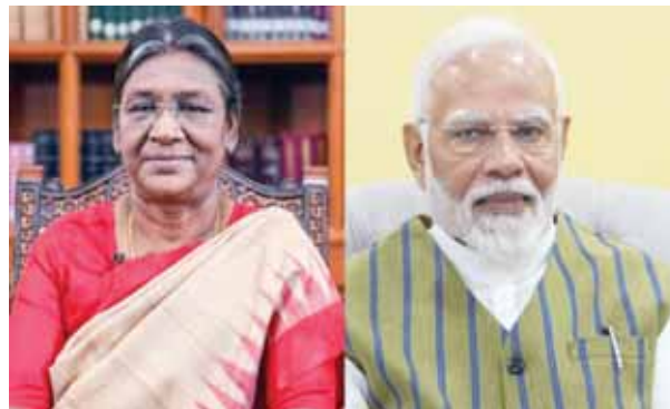
This will continue in the times to come."

their families. In social media posts, he said, "Today, on Army Day, we salute the unwavering courage of the Indian Army, which stands as the sentinel of our nation's security. We also remember the sacrifices made by the bravehearts who ensure the safety of crores of Indians every day." The Indian Army, he said, epitomises determination, professionalism and dedication. In addition to safeguarding our borders, it has made a mark in providing humanitarian help during natural disasters, he added. He said, "Our government is committed to the welfare of the armed forces and their families. Over the years, we have introduced several reforms and focused on modernisation.