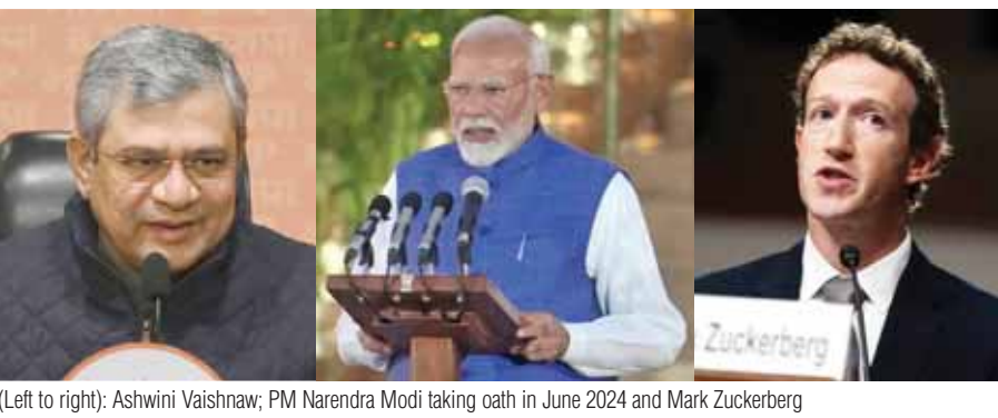
(Left to right): Ashwini Vaishnaw, PM Narendra Modi taking oath in June 2024 and Mark Zuckerberg