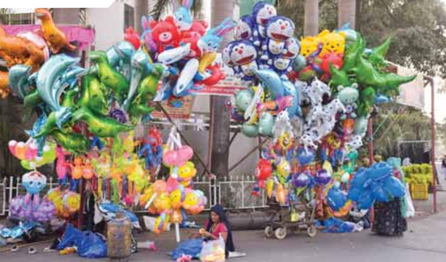
A vendor sells balloons, at the roadside in Surat