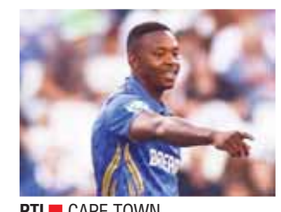
■ CAPE TOWN

MI Cape Town returned to winning ways with a comprehensive 33-run victory over neighbours Paarl Royals in their first home match of the season in Betway SA20 here. Newlands, which was filled to capacity for MI Cape Town's first home game of Season 3, delivered a near-perfect all-round performance to clinch the win here on Monday. New signing Reeza Hendricks led the way with the bat with his first half-century for home side. His 59 off 37 balls provided the foundation for