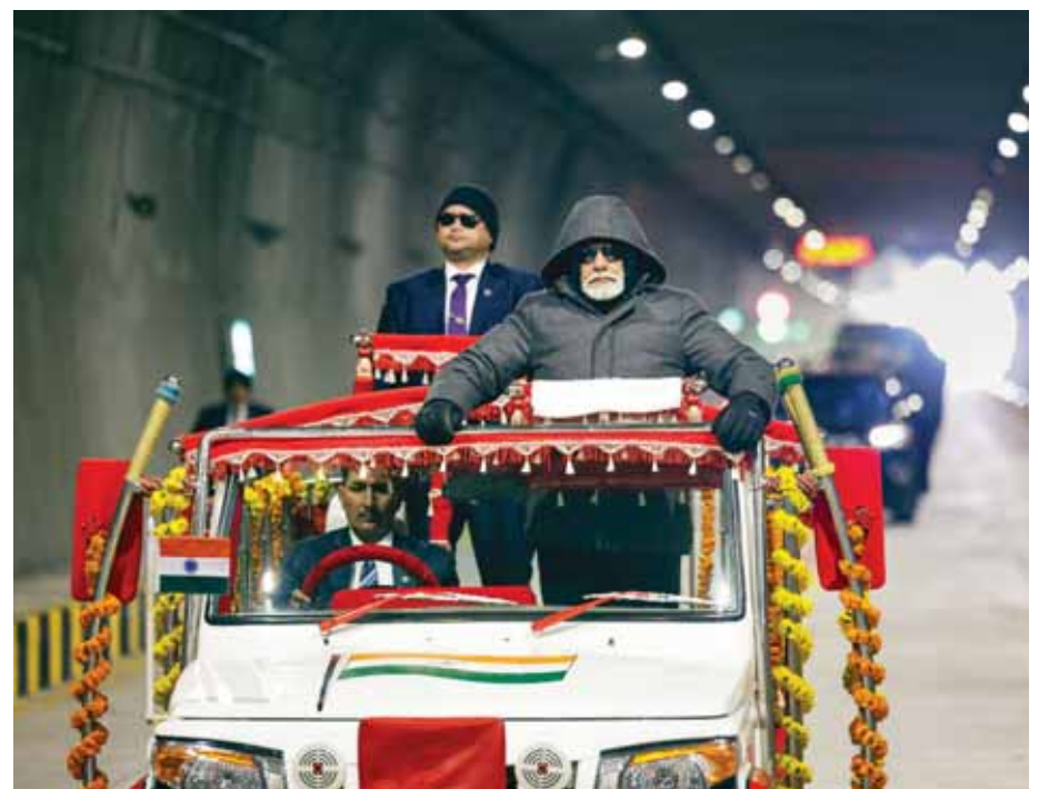
Prime Minister Narendra Modi during the inauguration of the Z-Morh tunnel.