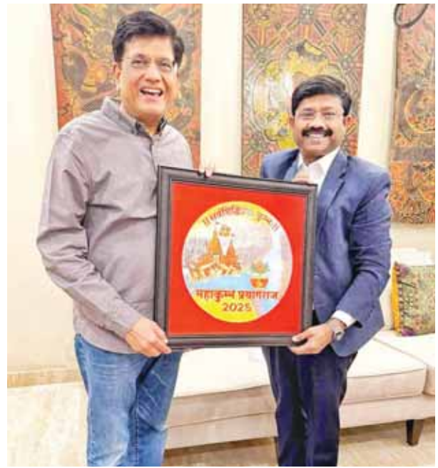
Uttar Pradesh Minister for Industrial Development, Export Promotion, NRI, and Investment Promotion, Nand Gopal Gupta 'Nandi' met Union Minister of Commerce and Industry Minister Piyush Goyal in New Delhi to invite him for the Prayagraj Mahakumbh scheduled for January 13, 2025 to February 26, 2025.

Highlighting the significance of January 12, the birth anniversary of Swami Vivekananda, he said the day has a symbolic connection to youth and India's cultural and spiritual heritage. He said, "With Swami Vivekananda as an inspiration, Yuva Utsav celebrates the power of youth and allows participants to explore and learn about the nation's diversity." "The festival, held annually in Delhi with inspiration from Prime Minister Narendra Modi, will feature programmes where youth can engage with leaders, including the prime minister and the defence minister, fostering invaluable moments of dialogue and learning," he added.