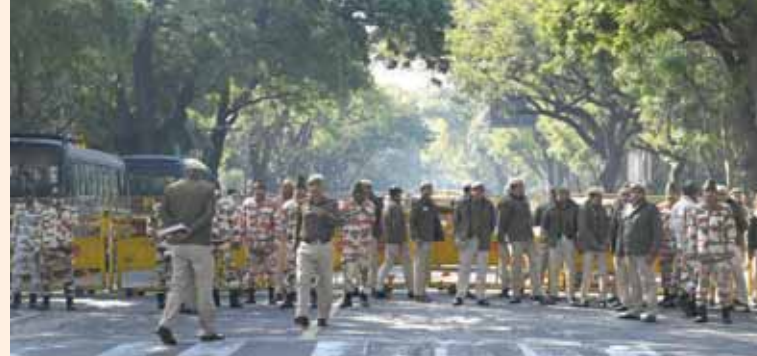
Police and security personnel stand guard outside Prime Minister's official residence at Lok Kalyan Marg, in New Delhi.