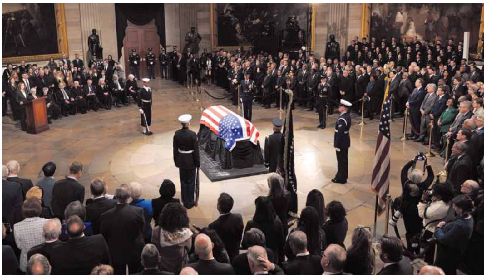
The flag-draped casket of former President Jimmy Carter lies in state during a ceremony in the Capitol on Tuesday in Washington. Carter died on Dec. 29 at the age of 100.

some really great progress and I'm really hopeful that by the inauguration we'll have some good things to announce on behalf of the president." Negotiations between Hamas and Israel are ongoing in Qatar, with Hamas this week naming 34 hostages in Gaza — including two dual US citizens — it would be willing to release in a ceasefire deal, the National Public Radio reported. Trump, in response to a question, warned Hamas to release all the hostages by January 20. "It will not be good for Hamas and it will not be good frankly for anyone. All hell will break out. I don't have to say anymore, but that's what it is. They should have given them back a long time ago — they should have never taken them. There should have never been the attack of October 7th. People forget that, but there was and many people were killed," he said.