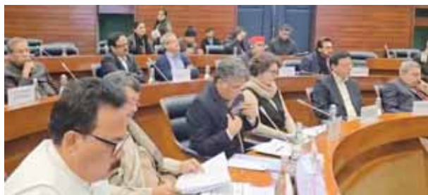
PIONEER NEWS SERVICE ■ NEW DELHI

First meeting of Joint Parliamentary Committee (JPC) meeting on one Nation one poll bills on Wednesday witnessed exchange of opinions between the Opposition and ruling party MPs. Opposition MPs criticised the bills as an attack on the basic fabric of the Constitution and federalism and BJP MPs hailing it as reflective of popular opinion. All MPs were given a trolley carrying over 18,000 pages, including one volume of the Kovind committee report each in Hindi and English, and 21 volumes of annexure, besides a soft copy as well. The MPs attending the meeting of the 39-member JPC expressed their views and asked questions following a presentation by the Ministry of Law and Justice on the provisions of the bills and the