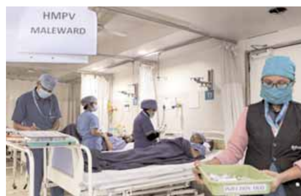
Nagpur: Preparations underway at Meditirina Hospital for patients of Human Metapneumovirus (HMPV), a day after two suspected cases of the virus were reported from the city, in Nagpur, Maharashtra.