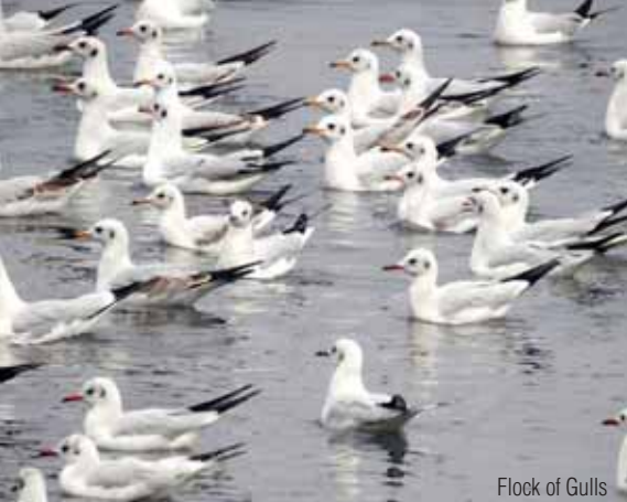
Flock of Gulls