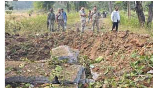
Security personnel at the site following the death of eight jawans of District Reserve Guards (DRG) and a civilian driver after Naxals blew up their vehicle with an improvised explosive device, in Chhattisgarh's Bijapur district

DRG draws its personnel mostly from local tribal population and ranks of surrendered Naxalites. Reinforcement was rushed to the spot and the bodies were being evacuated. A search operation was launched in the area by security forces to