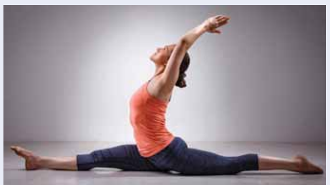
6. "The purpose of yoga is to stop suffering even before it arises. Yoga is a holistic way of energising and integrating mind, body and spirit.

5. "Peace is our very nature, and yoga leads you to inner peace." Yoga teaches one how to pay attention to what one experiences inside and what is the state of mind. Declutter the mental chatter.