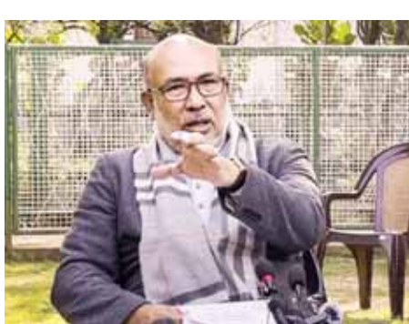
Manipur Chief Minister N. Biren Singh addresses a press conference

Continued on page 2 | Singh said firing incidents have declined in the