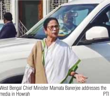
West Bengal Chief Minister Mamata Banerjee addresses the media in Howrah