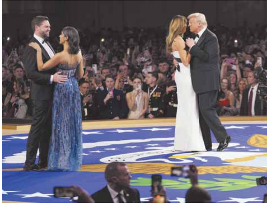
President Donald Trump, from right, with first lady Melania Trump and Vice President JD Vance, from left, with his wife Usha Vance, dance at the Commander in Chief Ball, Monday, in Washington, during the 60th Presidential Inauguration.

The pardons are a culmination of Trump's years-long campaign to rewrite the history of the Jan 6 attack that left more than 100 police officers injured as the angry mob of Trump supporters — some armed with poles, bats and bear spray — overwhelmed law enforcement, shattered windows and sent lawmakers and aides running into hiding.