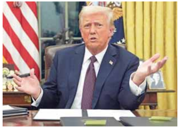
President Donald Trump talks to reporters as he signs executive orders in the Oval Office of the White House