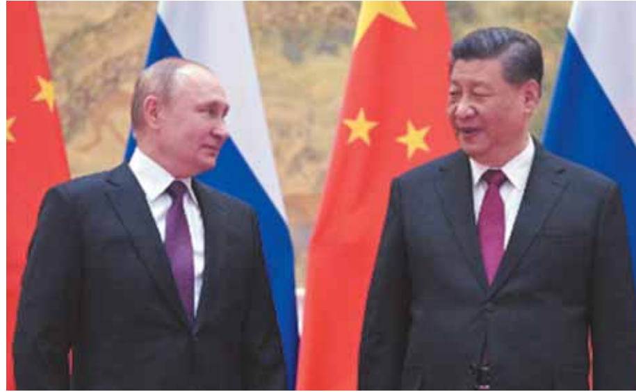
administration. The Chinese president had a call with Trump on Friday and expressed hope for positive ties with the US. Trump had threatened to

factors and the current international environment." "We jointly support the development of a more just multipolar global order and work to ensure indivisible security in Eurasia and the world as a whole," Putin told Xi in remarks carried by the Russian state TV. "Joint efforts by Russia and China play an important stabilising role in global affairs." Xi similarly praised close cooperation between Moscow and Beijing, saying it helps "bring positive energy to reforming and developing the global system." While neither leader directly mentioned Trump in the televised fragment of their call, the timing of the conversation may signal that Putin and Xi want to coordinate their action in dialogue with the new US