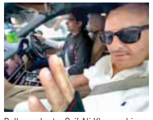
Bollywood actor Saif Ali Khan on his way to home after he was discharged from Lilavati Hospital, in Mumbai

Six days after he survived a Smurderous attack at his Bandra residence, Bollywood actor Saif Ali Khan was discharged from the Lilavati Hospital here on Tuesday evening. Fifty-four-year-old Saif — dressed in a white shirt and a pair of denims — looked hale, hearty and cheerful, as he walked out of the hospital and briefly raised his arm to wave at his fans and media persons, before heading in a car towards his home. A few close aides and private security personnel accompanied him. Saif was seen with friends and neighbours, as he walked into his 'Satguru Sharan' building. Minutes later, the actor returned to his 12th floor apartment where he had sustained six stab injuries, including the one in his spine, in a knife attack on him by an