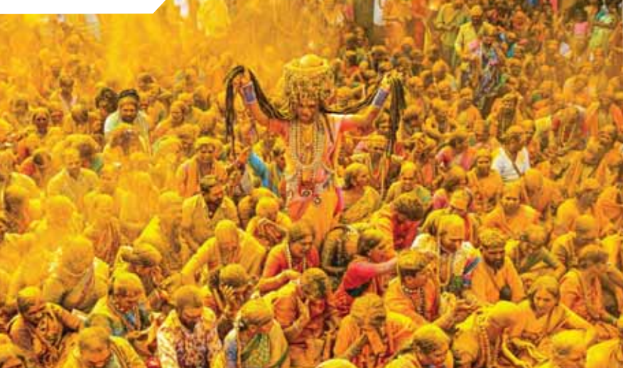
Devotees celebrate 'Komuravelli Mallanna Jathara' festival, at Komuravelli in Siddipet