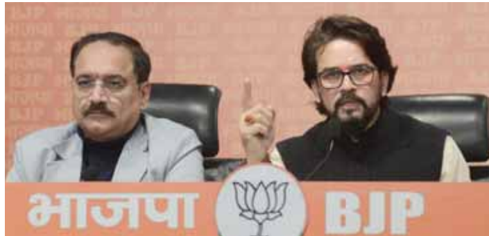
BJP MP Anurag Thakur with Delhi party President Virendra Sachdeva addresses a press conference, in New Delhi

The BJP will release the second part of the 'Sankalp Patra' (manifesto) for the upcoming state assembly polls on Tuesday in the presence of former union minister Anurag Thakur. It is expected the second part will have three to five poll promises including free bus rides to women, male students and senior citizens