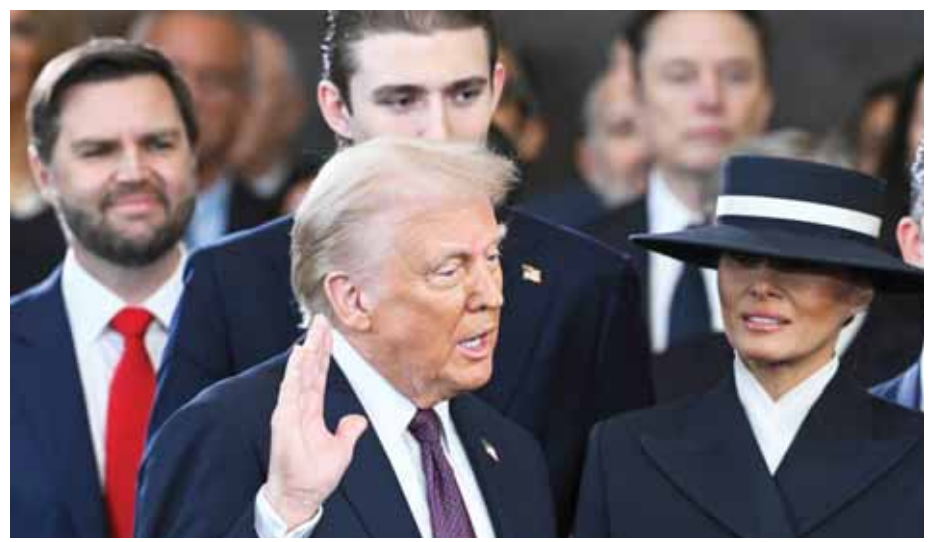
President-elect Donald Trump takes the oath of office during the 60th Presidential Inauguration in the Rotunda of the US Capitol in Washington