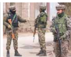
Security personnel stand guard near the site of the encounter, at Gujjarpatli area in Sopore, Baramulla district of Jammu and Kashmir