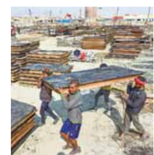
Workers move the charred remains of a tent site, a day after a fire broke out at the Maha Kumbh Mela due to a cylinder blast, in Prayagraj

A fire broke out near the Kinnar Akhara camp in Sector 16 of the Maha Kumbh on Monday morning, triggering panic among devotees and camp residents. This is the second fire incident at the Kumbh in two days, raising concerns about fire safety measures at the massive religious gathering.