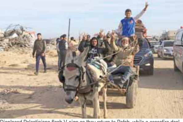
Displaced Palestinians flash V-sign as they return to Rafah, while a ceasefire deal between Israel and Hamas went into effect, in Rafah, Gaza Strip.