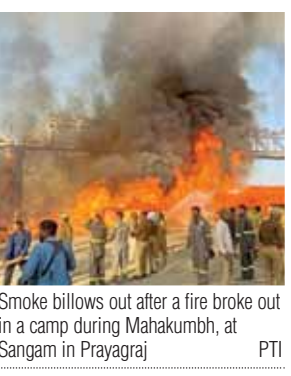
Smoke billows out after a fire broke out in a camp during Mahakumbh, at Sangam in Prayagraj.