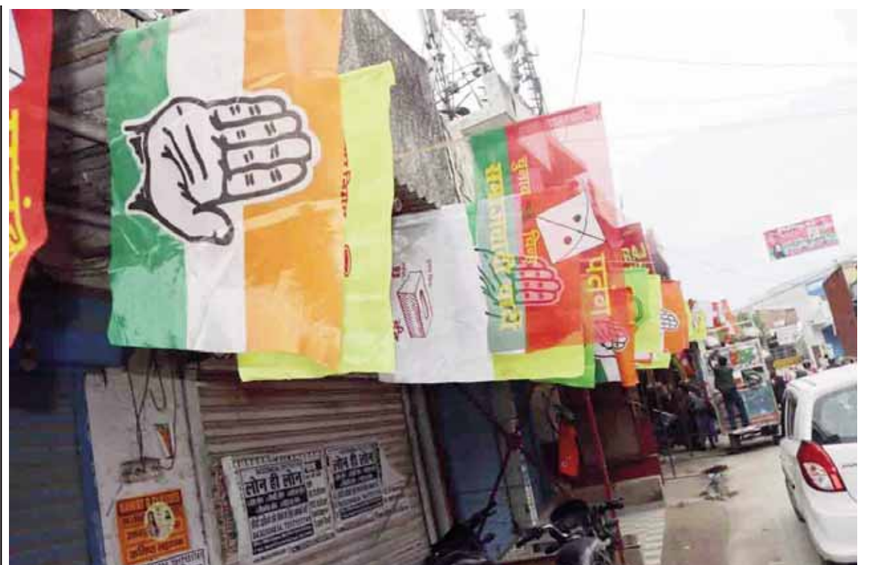
As campaigning for ULB polls continues, publicity material has become a common sight in the city. Flags of various political parties and candidates dot the roadside in Premnagar area of Dehradun on Sunday

politics whenever the BJP takes decisive actions against illegal encroachments and demographic changes. Chauhan referenced earlier statements by Congress leaders, including inflammatory remarks, as evidence of their attempts to destabilise harmony for political gains. Reiterating the BJP's commitment, he assured that the BJP-led government would not back down from its campaign against what it calls love Jihad and land Jihad. He emphasised that the State government will continue to act against those attempting to alter the demographic structure of the Uttarakhand. He averred that with the support of the people, the BJP will preserve the State's cultural and religious identity.