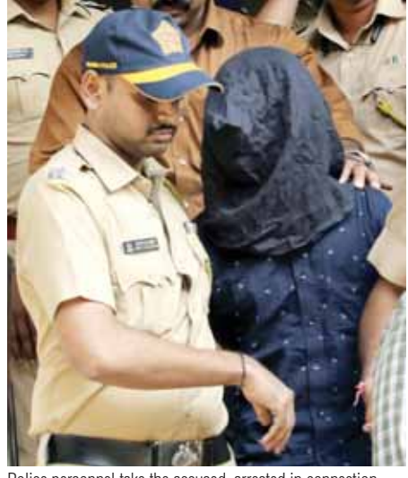
Police personnel take the accused, arrested in connection with the alleged attack on Bollywood actor Saif Ali Khan, to a hospital for medical examination before producing him at a court, in Mumbai.