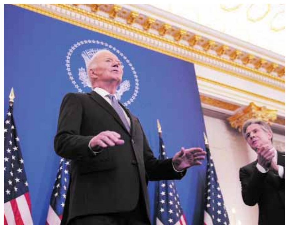
President Joe Biden, left, standing next to Secretary of State Antony Blinken, right, tells the audience to sit as he gets a standing ovation before making a speech about foreign policy at the State Department in Washington, Monday.

the report focused on Trump's hoarding of classified documents at Mar-a-Lago, actions that formed the basis of a separate indictment against Trump, will remain under wraps for now. The report is unsparing in its details about schemes undertaken by Trump to undo the presidential contest, accusing him of an "unprecedented criminal effort to overturn the legitimate results of the election in order to retain power". It recounts his role in trying to force the Justice Department to use its law enforcement authorities to advance his personal interests, participating in a scheme to enlist fake electors in battleground states won by Biden and having directed "an angry mob to the United States Capitol to obstruct the congressional certification of the presidential election and then leverage rioters' violence to further delay it". And it documents his fallout with his vice president, Mike Pence, over Trump's demands that he refuse