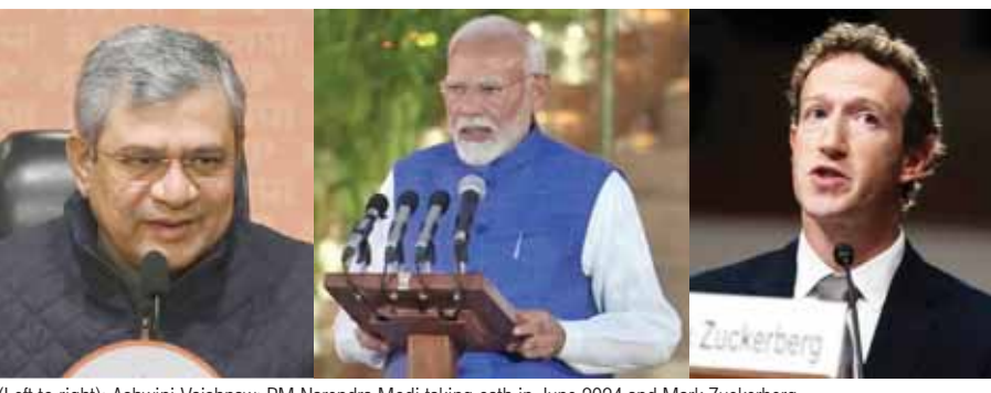
(Left to right): Ashwini Vaishnaw, PM Narendra Modi taking oath in June 2024 and Mark Zuckerberg