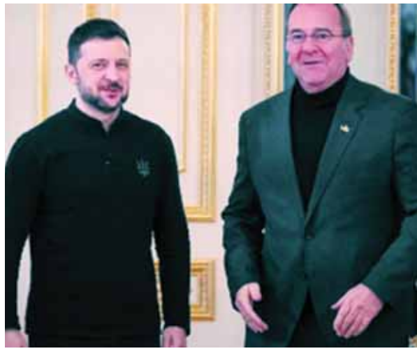
Ukrainian President Volodymyr Zelensky, left, and German Defence Minister Boris Pistorius greet each other in Kyiv, Ukraine, Tuesday.

Ukrainian President Volodymyr Zelensky said that he has held further discussions with French President Emmanuel Macron about the possibility of Western troops deploying in Ukraine to safeguard any peace deal ending the nearly three-year war with Russia. Zelensky's disclosure came before an official visit to Kyiv on Tuesday by German Defence Minister Boris Pistorius. He arrived in Kyiv on an unannounced visit following a meeting in Warsaw on Monday with his counterparts from France, the United Kingdom, Italy and Poland. Germany and the four other countries are Europe's five top military spenders. Pistorius told German news agency dpa that his visit to Kyiv aims to underscore Germany's strong support for Ukraine at a time when US President-elect Donald Trump's term beginning next week looks set to bring deep changes to Washington's policy on the war. Pistorius said that his visit "is a signal that Germany, as the biggest NATO country in Europe, stands by Ukraine — not alone, but with the group of five and many other allies." Trump has criticised the cost