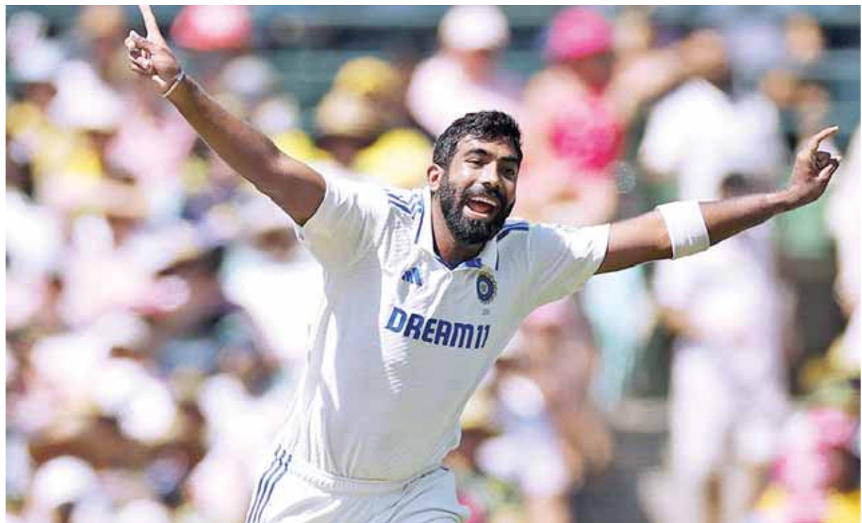
bowler to take 200 Test wickets at an average below 20.

India pace spearhead Jasprit Bumrah was on Tuesday named ICC Men's Player of the Month for December 2024 after his sensational performance during the recent tour of Australia for the Border-Gavaskar Trophy. Leading India's attack single-handedly, Bumrah relentlessly kept Australian batsmen under intense pressure, claiming 22 wickets in three Tests in December last year at an outstanding average of 14.22. He ended with 32 wickets in the five-match series which concluded on January 5. The first match was played in November. His match-winning contributions included a nine-wicket haul in Brisbane and a five-wicket display in Melbourne as he edged out Australian skipper Pat Cummins and South African Dane Paterson for the award, stated the ICC. He also reached a significant milestone, becoming the first