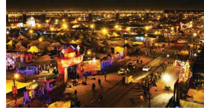
(Top) A young devotee at Sangam on the occasion of ‘Makar Sankranti’ during the Maha Kumbh Mela 2025, in Prayagraj, Uttar Pradesh. (Left) Tent city at the Mahakumbh Nagar

A video of Maha Kumbh showing a Rs 10,000 loan from a kind friend, and the grandeur of the largest human gathering on Earth have lured four siblings from Gorakhpur to Prayagraj. While this could be anybody’s story, what sets the four siblings apart is that they left home without informing their parents, bought a pushcart, and set up a tea and snacks stall near Kali Road in Prayagraj, quietly slipping into the sea of humanity that has descended on this holy city for the Maha Kumbh. Requesting anonymity, the 22-year-old elder sister told PTI, “Our father is a policeman, while our mother is a homemaker. My father bears all the expenses for our education and running the household. It is painful to see him struggle so much.” “One day, we came across a video of the Kumbh showing people earning good profits. My younger sister then suggested that we should also set up a stall at the Kumbh. Our father was against the idea. So we ran away from home when he was out for duty, bought a pushcart, and set up a stall near Kali Road.” The runaway brigade comprises her 20-year-old younger sister, and two brothers aged 15 and 17. “My sister borrowed Rs 10,000 from a friend, and I pawned my earrings for Rs 5,000. With this amount, we started this stall,” she said.