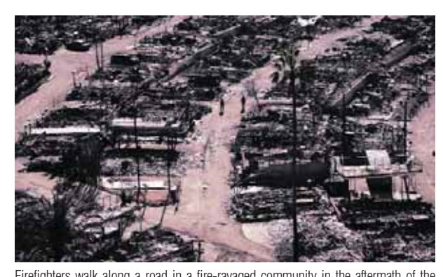
Firefighters walk along a road in a fire-ravaged community in the aftermath of the Palisades Fire in the Pacific Palisades neighborhood of Los Angeles, Monday.

Los Angeles (PTI): Additional water tankers and scores of firefighters arrived at the Los Angeles area on Monday ahead of fierce winds that were forecast to return and threaten the progress made so far on two massive infernos that have destroyed thousands of homes and killed at least 24 people. Planes doused homes and hillsides with bright pink fire-retardant chemicals, while crews and fire engines were being placed near particularly vulnerable spots with dry brush. Dozens of water trucks rolled in to replenish supplies after hydrants ran dry last week when the two largest fires erupted. Tabitha Trosen and her boyfriend said she feels like they are "teetering" on the edge with the constant fear that their neighbourhood