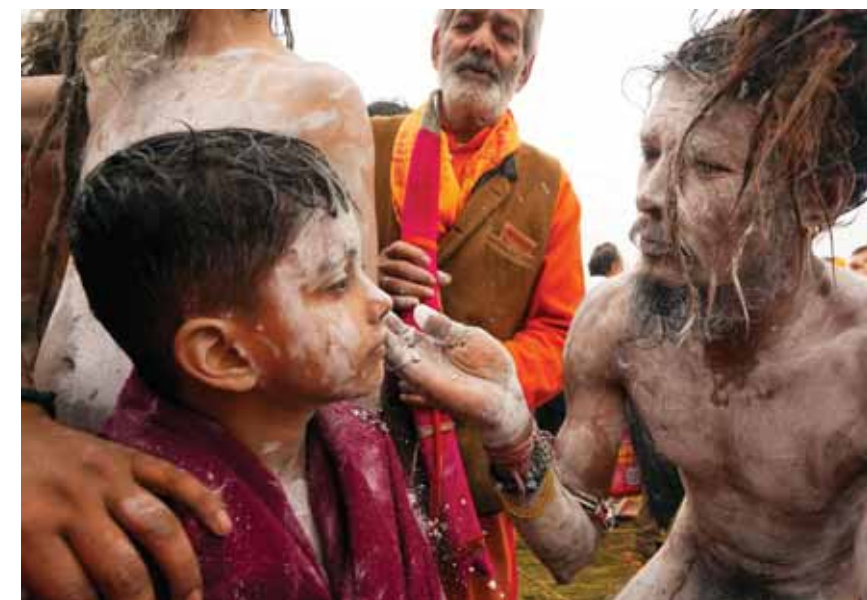
MAHAKUMBH NAGAR

A video of Maha Kumbh showing a Rs 10,000 loan from a kind friend, and the grandeur of the largest human gathering on Earth have lured four siblings from Gorakhpur to Prayagraj. While this could be anybody’s story, what sets the four siblings apart is that they left home without informing their parents, bought a pushcart, and set up a tea and snacks stall near Kali Road in Prayagraj, quietly slipping into the sea of humanity that has descended on this holy city for the Maha Kumbh. Requesting anonymity, the 22-year-old elder sister told PTI, “Our father is a policeman, while our mother is a homemaker. My father bears all the expenses for our education and running the household. It is painful to see him struggle so much.” “One day, we came across a video of the Kumbh showing people earning good profits. My younger sister then suggested that we should also set up a stall at the Kumbh. Our father was against the idea. So we ran away from home when he was out for duty, bought a pushcart, and set up a stall near Kali Road.” The runaway brigade comprises her 20-year-old younger sister, and two brothers aged 15 and 17. “My sister borrowed Rs 10,000 from a friend, and I pawned my earrings for Rs 5,000. With this amount, we started this stall,” she said.