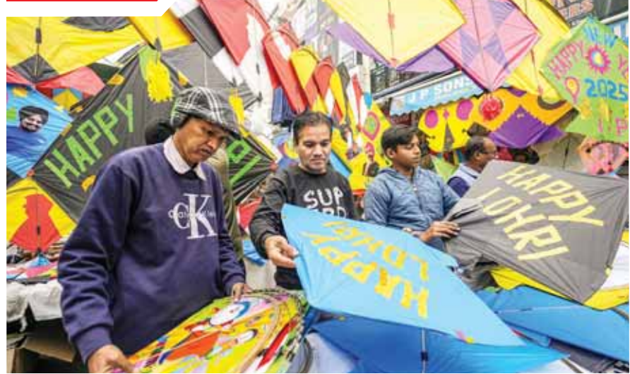
People buy kites ahead of 'Makar Sankranti' festival, in Amritsar