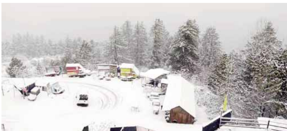
Winter sports destination Auli in Chamoli district covered in a blanket of white after fresh snowfall on the weekend

Meanwhile, the maximum and minimum temperatures recorded on Sunday were 12.8 degrees Celsius and 10.2 degrees Celsius respectively in Dehradun, 22.5 degrees Celsius and eight degrees Celsius in Pantnagar, 3.4 degrees Celsius and minus one degrees Celsius in Mukteshwar and 7.7 degrees Celsius 2.3 degrees Celsius in New Tehri.