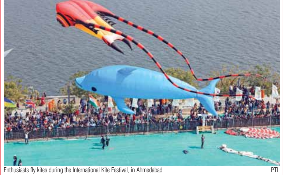
Enthusiasts fly kites during the International Kite Festival, in Ahmedabad