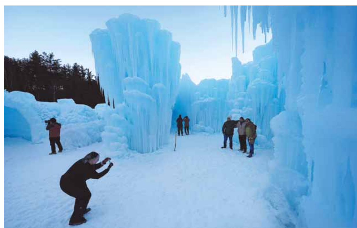
Visitors pose for a photo on opening day at the Ice Castles, in North Woodstock, N.H.