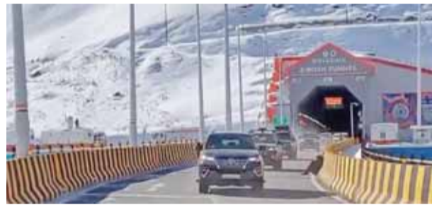
and the movement of Indian armed forces in case of emergency. Currently the average travel time to cross the Zojila Pass is three hours. After the completion of this tunnel, the travel time will come down to 20 minutes, resulting in fuel savings.

of the corridor to the Nation on Monday the focus will be shifted to the timely completion of the 13.15 km long Zojila Tunnel. The Z-Morh tunnel will link Kangan with Sonamarg, a famous tourist destination on the Srinagar-Leh highway. The Zojila tunnel will provide year-round connectivity between the Kashmir Valley and Ladakh, which will be extremely important for the development of Ladakh, the promotion of tourism, the free movement of local goods,