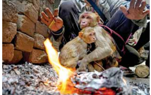
A juggler with monkeys sits around a bonfire on a cold winter day

Lashed out in parts of Delhi and the national Capital region on Saturday evening leading to traffic jams and cold wave conditions. The instant rain triggered traffic congestion at key routes in Delhi at the peak hours, frustrating commuters. ISBT Kashmiri Gate, ITO, Mehrauli Badarpur road, Anand Vihar road, Chirag Dilli, Dhaura Kuan, Sainik Farm, Azad Market road, Karol Bagh, Peeragarhi Road, New Rohtak Road are among those stretches that witnessed traffic jams during the peak hours in the evening. The weather department forecasts that weather is expected to remain the same on Sunday. The minimum temperature was recorded a low of 7.7