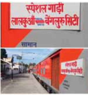
to depart for Bengaluru on January 18 have already been fully booked this week itself. According to the information provided by the Railways, the

319 seats in the four sleeper coaches in the Lalkuan-Bengaluru City Express train were fully booked while 95 per cent of the 798 seats in the 10 third AC economy coaches were full on the first day. Officials informed that the fare for the 2,635 kilometre train journey from Lalkuan to Bengaluru city is Rs 1,050 in the sleeper class and Rs 2,550 in the third AC economy. There are a total of 40 stoppages on the entire route. The train will depart from Lalkuan every Saturday at 5:55 PM. It will pass through Bareilly junction, Mathura, Agra, Gwalior and Jhansi on the first day, Bhopal, Betul, Nagpur, Balharashah, Tedpalli, Warangal, Ongal and Krishnarajapuram on the second day before reaching Bengaluru on the third day at 3:25. From Bengaluru, this train will depart on Tuesdays and reach Lalkuan at 9:05 AM on the third day.