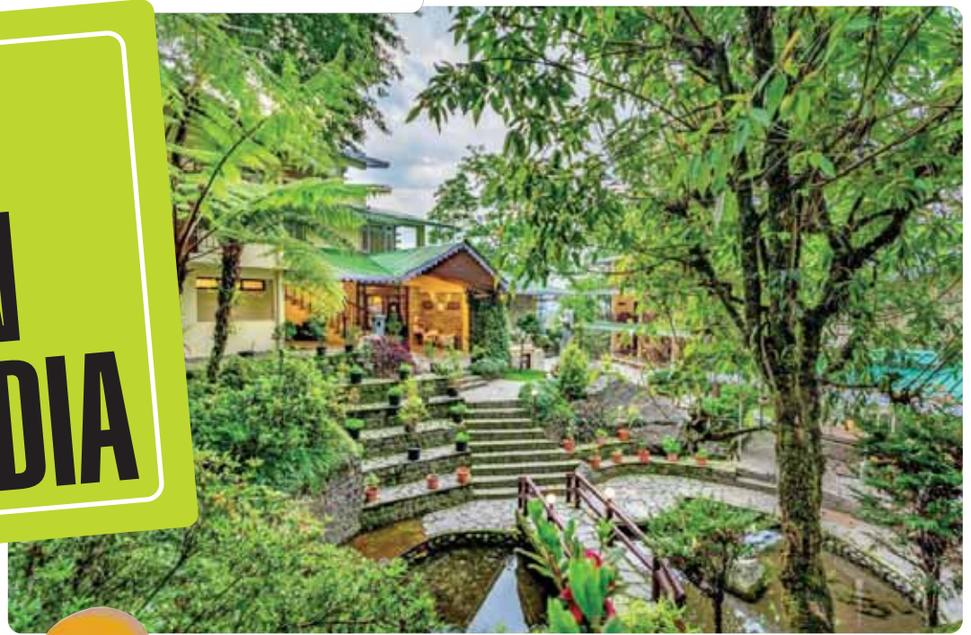
SUMMIT NORLING RESORT AND SPA (GANGTOK, SIKKIM)

Situated on the outskirts of Kaziranga National Park, Diphlu River Lodge offers an authentic experience with its rustic ethnic design. The lodge features comfortable accommodations and a range of activities such as bird watching, vehicle safaris, and village treks, making it an excellent choice for nature lovers. A land of rolling tea gardens, the mighty Brahmaputra, and rich wildlife, Assam is brimming with its natural beauty and vibrant cultural heritage.