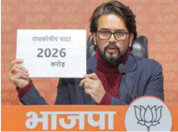
BJP leader Anurag Thakur addresses a press conference at the party headquarters, in New Delhi

Supply of liquor in Delhi, some retailers surrendered their licenses before the policy expired, and the government did not re-tender them which led to the loss of Rs 890 crores. It said that the government made exemptions for zonal licensees, which caused a loss of Rs 941 crores. For the purpose of retail vends, Delhi was divided into 32 zones (containing 849 vends) whose licenses were granted to 22 entities through tendering. Whereas during the old policy, 377 retail vends were run by four Government Corporations and 262 retail vends were run by the private individuals. The report revealed a loss of revenue to the tune of Rs 144 crore owing to irregular grant of waiver on account of COVID-19 to zonal licenses. It also revealed that incorrect collection of security deposit from zonal licenses leading to loss of revenue of around Rs