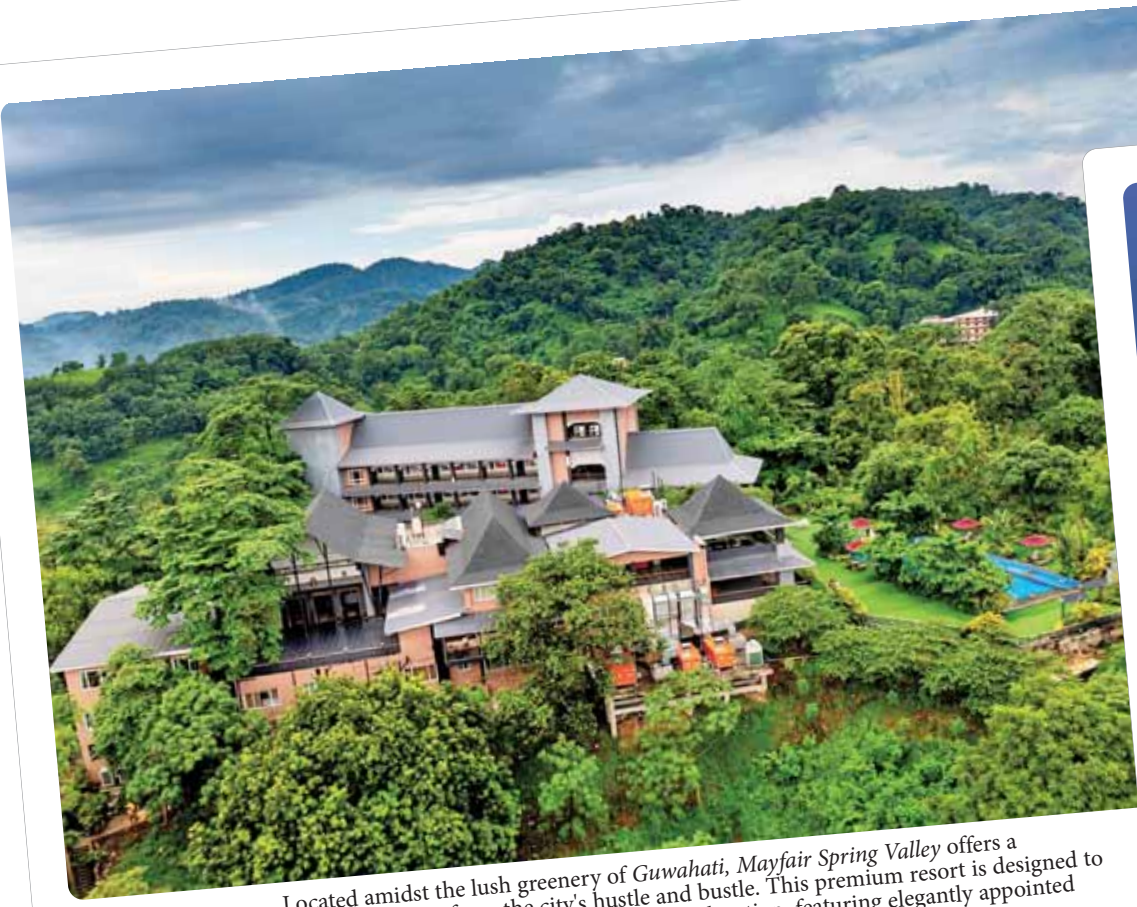
MAYFAIR SPRING VALLEY (GUWAHATI, ASSAM)

Located amidst the lush greenery of Guwahati, Mayfair Spring Valley offers a luxurious escape from the city's hustle and bustle. This premium resort is designed to provide guests with ultimate comfort and relaxation, featuring elegantly appointed rooms, a rejuvenating spa, a dedicated kids' play area and top-notch dining experiences. Surrounded by picturesque landscapes, the resort offers serene views of rolling hills and verdant gardens, making it an ideal retreat for nature enthusiasts and luxury seekers alike. Guests can also explore nearby attractions, such as the famous Kamakhya Temple and Brahmaputra Riverfront, ensuring a blend of tranquillity and adventure during their stay.