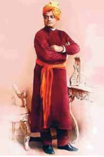
realm of spiritual and cultural exchange between the East and the West.

Among the Swami’s biographers from the West, Rolland, who won the Nobel Prize in literature, is considered the best. A true Vedantist in his soul, he viewed Vivekananda’s journey to the West as an epoch-making event in the