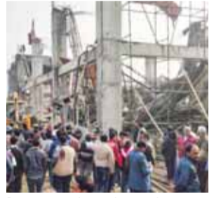
Rescue operation underway after an under-construction building collapsed at the Kannauj railway station