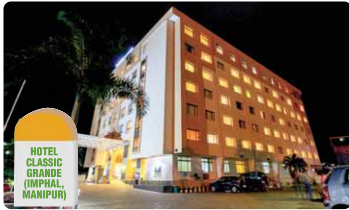
HOTEL CLASSIC GRANDE (IMPHAL, MANIPUR)

Blessed with nature's bounty, Northeast India is a safe haven for many travellers who wish to escape the overcrowded and over-polluted city life from time to time. With the winter season worsening the pollution's threat to healthy living, Northeast India is the best place to take refuge in to revitalise your health and take a step back to recentre within. Here are a few of the many scenic vacation spots that can do just that.