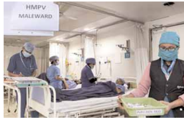
Nagpur: Preparations underway at Meditirina Hospital for patients of Human Metapneumovirus (HMPV), a day after two suspected cases of the virus were reported from the city, in Nagpur, Maharashtra.

committed in the construction of Sheesh Mahal (6, Flagstaff Road, occupied by Arvind Kejriwal as chief minister). Why did they not think of showing the Sheesh Mahal earlier and now insist on a visit when the administration is bound by a model code of conduct?" In a veiled attack on AAP leaders, BJP national spokesperson Sudhanshu Trivedi, addressing a press conference, said their conduct was also an example of "political etiquette and ethics" being demolished. This shows the writing on the wall is clear to them that the AAP is losing the Delhi assembly polls, he said. Earlier, outside the Chief Minister's house, the AAP leaders engaged in a heated argument with the police and staged a dharna outside the 6 Flag Staff Road bungalow after being denied entry, which they had invited the media to tour with them in a bid to counter the BJP's "Sheesh Mahal" jibes. Police set up barricades and deployed personnel in front of the bungalow, preventing the AAP leaders from entering the premises.