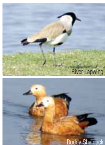
River Lapwing and Ruddy Shelduck

He said Wetlands International's annual Asian Waterbird Census (AWC) part of the global International Waterbird Census is carried out in the month of January in 27 countries together in Asia and Australasia. Indian volunteers participate in it under coordination of the AWC State Coordinators as per the confirmed annual