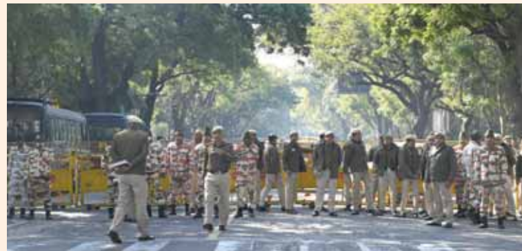
Police and security personnel stand guard outside Prime Minister's official residence at Lok Kalyan Marg, in New Delhi.