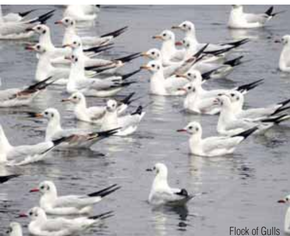
Flock of Gulls