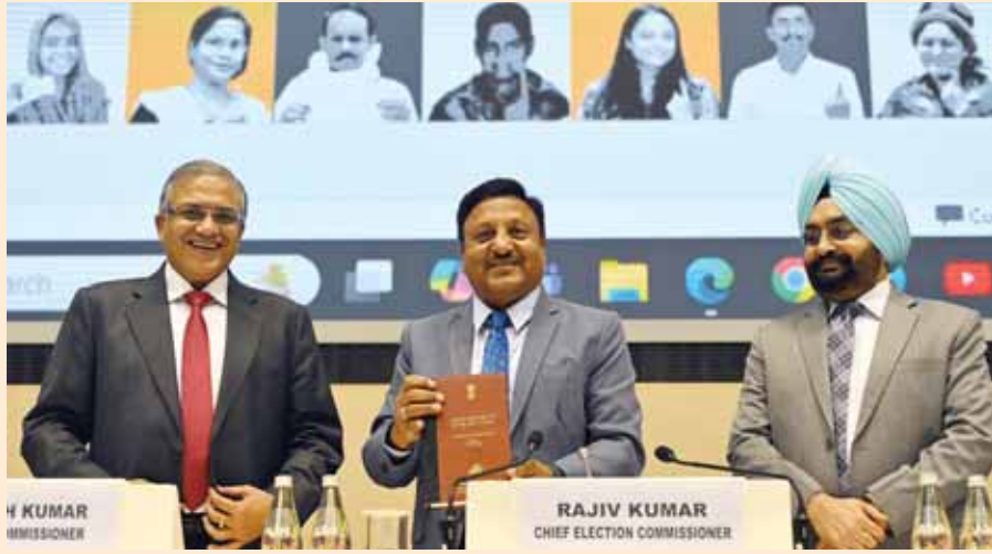
Chief Election Commissioner Rajiv Kumar with Election Commissioners Gyanesh Kumar and Sukhbir Singh Sandhu during a press conference for the announcement of the schedule for the Delhi Assembly elections.

With an announcement of the 70 assembly seats in Delhi in a single phase on February 5 and the votes will be counted on February 8 by the Election Commission (EC), the stage is set for a fierce triangular contest between the incumbent Aam Aadmi Party (AAP), the Bharatiya Janata Party (BJP), and the Congress. The battle lines are drawn between Prime Minister Narendra Modi's developmental model versus the 'freebies' model touted by the AAP chief and former Chief Minister Arvind Kejriwal, who is eyeing a hat-trick, having swept the 2015 and 2020 elections with 67 and 62 seats, respectively. The AAP faces anti-incumbency, corruption allegations and an aggressive BJP in its bid to assume power for a third successive term. The Congress will be keen to regain the national Capital. Although the Congress and the AAP contested the 2024 Lok Sabha elections together as part of the INDIA bloc, they will be competing separately in the upcoming Assembly polls. Announcing the dates for the Assembly polls in Delhi, Chief Election Commissioner Rajiv Kumar said "It is a single-phase election... We have deliberately kept polling on a Wednesday so more people come out to vote... like we did in Maharashtra. The entire election process will be completed by February 10." With the EC's announcement of the election schedule, the