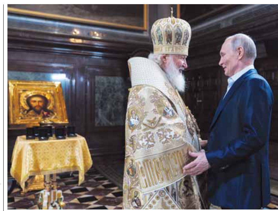
In this photo released by Russian Orthodox Church Press Service, Russian Orthodox Patriarch Kirill (left) and Russian President Vladimir Putin speak after the Christmas service in the Christ The Saviour Cathedral in Moscow, on Tuesday.

THE first US bird flu death has been reported — a person in Louisiana who had been hospitalized with severe respiratory symptoms. Louisiana health officials announced the death on Monday.