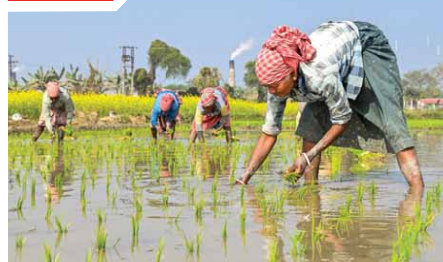
Farmers plant paddy saplings in a field, in Nadia