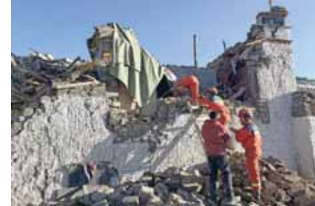
Rescue workers search for survivors in the aftermath of an earthquake in Changsuo Township of Dingri in Xigaze, southwestern China's Tibet Autonomous Region.

A 6.8-magnitude earthquake struck near one of Tibet's holiest cities on Tuesday, killing at least 95 people and injuring 130 others with tremors also shaking buildings and forcing people to run to the streets in neighbouring Nepal. According to regional disaster relief headquarters, the quake jolted Dingri County in Xigaze in Tibet Autonomous Region in China at 9:05 am Tuesday (Beijing Time). The US Geological Service, however, put the quake's magnitude at 7.1. At least 95 people have been confirmed dead and 130 others injured as of 3 p.m. Tuesday (local time), state-run Xinhua news agency reported. Chinese President Xi Jinping has ordered all-out rescue efforts to carry out relief and rescue operations in the affected areas. Xi ordered utmost efforts to treat the injured and urged efforts to prevent secondary