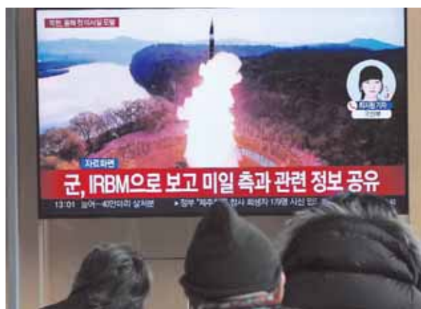
A TV screen shows a file image of North Korea's missile launch during a news program at Seoul Railway Station in Seoul on Monday.

North Korea on Monday fired a ballistic missile that flew 1,100 kilometers (685 miles) before landing in waters between the Korean Peninsula and Japan, South Korea's military said, extending its heightened weapons testing activities into 2025 weeks before Donald Trump returns as US president. The South's Joint Chiefs of Staff said the midrange missile was fired from an area near the North Korean capital of Pyongyang and that the launch preparations were detected in advance by the US and South Korean militaries. It denounced the launch as a provocation that poses a serious threat to peace and stability on the Korean Peninsula. The joint chiefs said the military was strengthening its surveillance and defense posture in preparation for possible additional launches and sharing information on the missile with the United States and Japan. Japan's Defence Ministry said the missile landed outside its exclusive economic zone and that there were no reports of