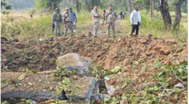
Security personnel at the site following the death of eight jawans of District Reserve Guards (DRG) and a civilian driver after Naxals blew up their vehicle with an improvised explosive device, in Chhattisgarh's Bijapur district