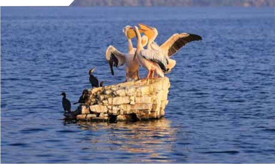
Flocks of pelicans and cormorants congregate at Man Sagar Lake, in Jaipur