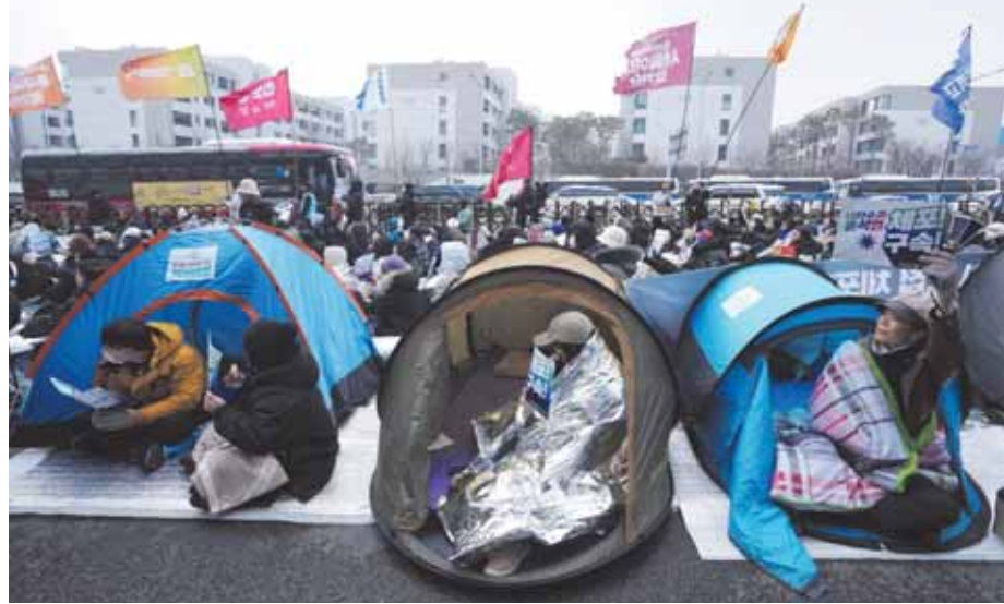
Protesters demanding the arrest of impeached South Korean President Yoon Suk Yeol attend a rally near the presidential residence in Seoul on Monday.

Oh Dong-woon, and six other anti-corruption and police officers for orchestrating Friday's detention attempt, which they claim was illegal. The lawyers also filed complaints against the country's acting national police chief, the acting defense minister and two Seoul police officials for ignoring the presidential security service's request to provide additional forces to block the detention attempt. The lawyers