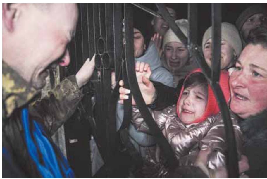
A Ukrainian serviceman cries upon seeing his daughter after returning from captivity during a POWs exchange between Russia and Ukraine, in Ukraine

Kviv's Western allies have provided air defense systems to help Ukraine protect critical infrastructure, but Russia has