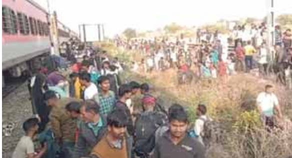
People gather at the site following the death of several passengers after they stepped down due to a rumour of fire and were run over by another train passing on the adjacent tracks, in North Maharashtra's Jalgaon district