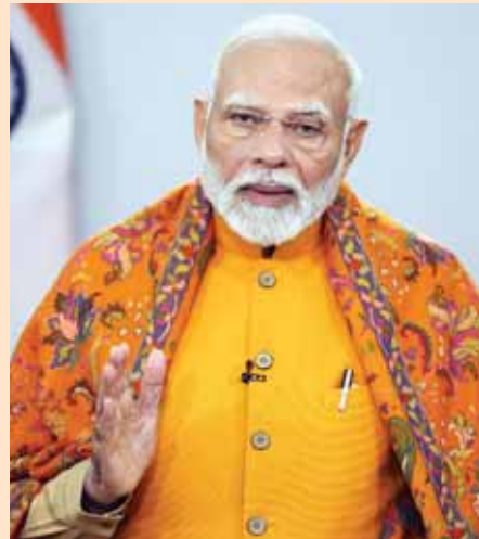
SAUMYA SHUKLA ■ NEW DELHI

Turning the heat up ahead of the Delhi Assembly elections, Prime Minister Narendra Modi on Wednesday slammed the ruling Aam Aadmi Party (AAP) for failing to provide basic needs such as water to the people of the national Capital while taking a jibe at the party on the money laundering linked excise policy scam, stating that 'liquor is available but water is not'. Prime Minister made these remarks during his interaction with the booth level workers in the 'Mera booth, sabse mazboot' programme while urging the members of the Bharatiya Janata Party (BJP) in the Capital to target winning over 50 per cent booths in the Assembly polls. Assuring a landslide victory in the Assembly polls, he asked booth workers to set two goals- breaking all voting records and ensure that the BJP gets more than 50 per cent at each booth. He said that the AAP is making new announcements daily because they are getting the new news of defeat every day. "These AAP-da people are now making a new announcement every day. This means that they are getting new news of defeat every day.