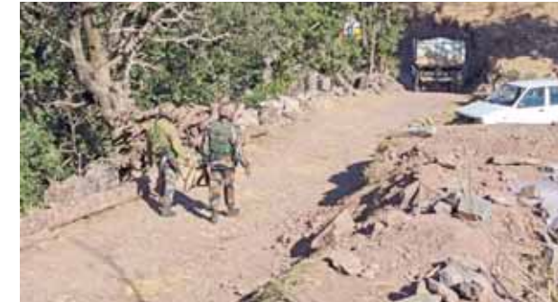
Security personnel keep vigil after the remote Badhaal village was declared a containment zone and prohibitory orders imposed on all public and private gatherings in Jammu and Kashmir's Rajouri district

Raising a 'red flag,' the District Magistrate Rajouri has declared Badhaal village, which has so far witnessed 17 deaths due to 'mysterious illness' since December 7, 2024, a 'containment zone' under section 163 of Bharatiya Nagarik Suraksha Sanhita (BNSS) with immediate effect. Section 163 of the BNSS gives magistrates the power to issue written orders in urgent situations. According to the order issued by the office of the District Magistrate, Rajouri on January 21, 2025, "In view of the recent health situation in the Badhaal area and to curb the spread of infection the following orders are issued under section 163 of BNSS". Meanwhile, four villagers including three sisters have been admitted to the hospital in the last 24 hours.