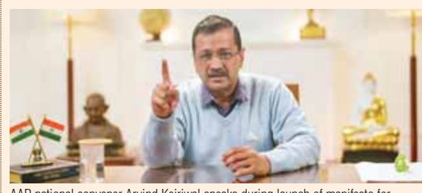
AAP national convener Arvind Kejriwal speaks during launch of manifesto for middle class ahead of the upcoming Delhi Assembly elections