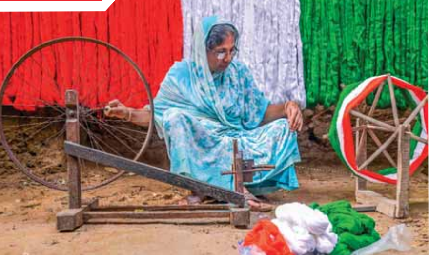
A woman prepares yarn to make the tricolour ahead of Republic Day 2025, in Nadia