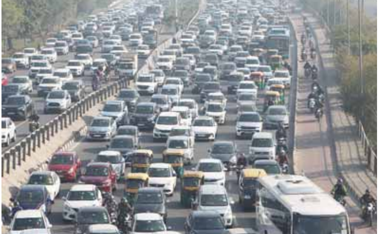
Traffic jam near the Ring Road owing to rehearsal for the Republic Day Parade

Massive traffic congestion was seen in central Delhi due to the Republic Day parade rehearsals on Tuesday, leaving hundreds of commuters stranded on the road. Commuters also complained of long queues at metro stations due to heightened security checks ahead of Republic Day. Routes leading to Bahadur Shah Zafar Marg near the ITO, arterial roads of the Ring Road, between Ashram and IP Estate flyover, Man Singh Road, Rafi Marg, Janpath Road, Shahjahan Road, Akbar Road, Ashoka Road and other routes around the Kartavya Path were severely hit. A traveller shared videos and pictures of a traffic jam in Mundka following which the Delhi Traffic Police said the traffic control room has been informed and the needful is being done. “Don’t feel like going out for work. The traffic in Delhi is horrible,” another user on X said. Motorists blamed traffic personnel for not regulating traffic properly and said