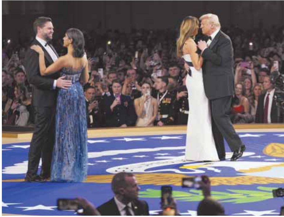
President Donald Trump, from right, with first lady Melania Trump and Vice President JD Vance, from left, with his wife Usha Vance, dance at the Commander in Chief Ball, Monday, in Washington, during the 60th Presidential Inauguration.

President Donald Trump on Monday pardoned, commuted the prison sentences or vowed to dismiss the cases of all of the 1,500-plus people charged with crimes in the Jan 6, 2021, US Capitol riot, including people convicted of assaulting police officers, using his clemency powers on his first day back in office to undo the massive prosecution of the unprecedented assault on the seat of American democracy.