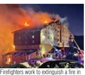
Firefighters work to extinguish a fire in a hotel at a ski resort of Kartalkaya in Bolu province, in northwest Turkey

rifle, were recovered from the encounter site. A fresh exchange of firing took place late Monday night and it continued till early hours of Tuesday in a forest under the Mainpur police station areas (Chhattisgarh) along the Chhattisgarh-Odisha border, in which 12 more Naxalites were gunned down. With this, the total number of Maoists killed in the operation went up to 14, police said. Intermittent exchange of firing in the area was underway on Tuesday too and the number of Maoist casualties may increase, they said. A joint team of security personnel from the District Reserve Guard (DRG) of the Chhattisgarh Police, CoBRA commandos of the Central Reserve Police Force (CRPF) and Special Operation Group (SOG) personnel from the Odisha Police were involved in the operation. The operation was launched on the night of January 19 based on intelligence inputs about the presence of Maoists in the Kularighat reserve forest of Chhattisgarh, just 5 km from the border of Odisha’s Nuapada district. Hailing the security forces, Chhattisgarh Chief Minister Vishnu Deo Sai said under the BJP-led double-engine government at the Centre and the state, Chhattisgarh will get rid of the menace by March 2026. He said strengthening the resolve of Prime Minister Modi and the union home minister to end Naxalism in the country by March 2026, the security forces have been continuously achieving success and moving rapidly towards fulfilling the target.