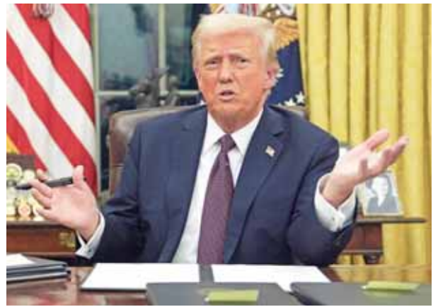
President Donald Trump talks to reporters as he signs executive orders in the Oval Office of the White House