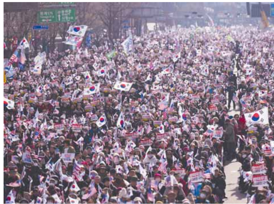
Supporters of impeached South Korean President Yoon Suk Yeol stage a rally to oppose his impeachment in Seoul, South Korea, on Saturday