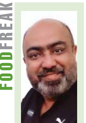
Pawan Soni Food critic and founder of the Big F Awards

Japonico: Discover the joy of great food and creative flavours