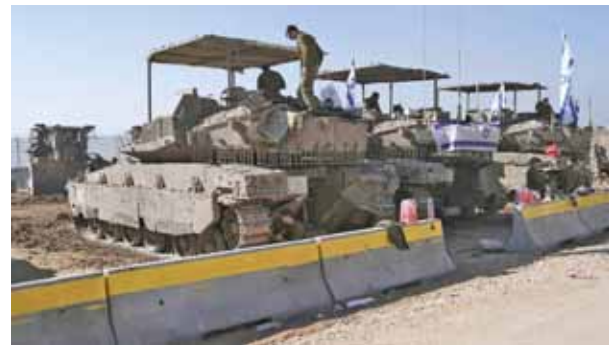
Israeli soldiers work in staging area on the Israel-Gaza border after returning from the Gaza Strip