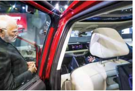
Prime Minister Narendra Modi during the Bharat Mobility Global Expo 2025 at Bharat Mandapam, in New Delhi.

India has emerged as a major automobile hub in the world and number of cars sold in the country annually surpasses the population of many countries, Prime Minister Narendra Modi said here on Friday. Underlining this, he also said future of mobility belongs to India that saw an unprecedented sale of 2.5 crore vehicles a year, and attracted USD 36 billion foreign direct investment in just four years. Addressing a gathering after inaugurating the Bharat Mobility Global Expo 2025 at Bharat Mandapam, the prime minister also emphasised that India stands as an outstanding destination for every investor looking to shape one's future in