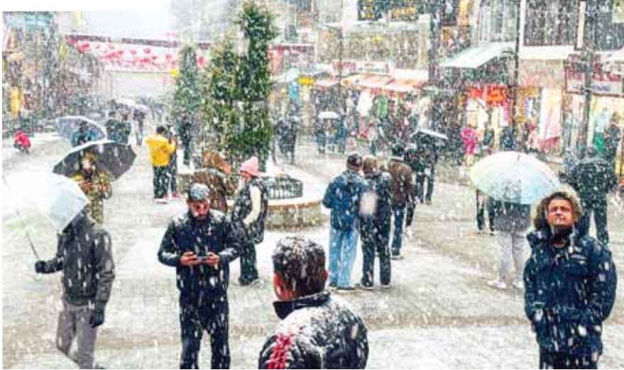
Tourists at Mall Road amid snowfall, in Manali