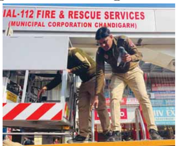
the voiceless creature."