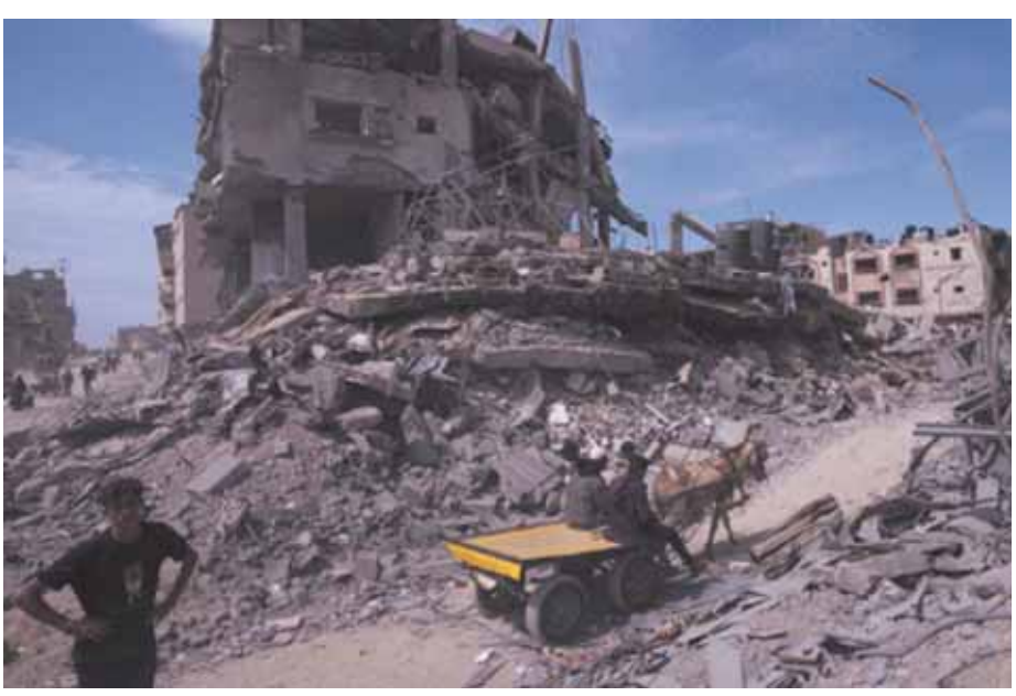
the size of the Great Pyramid of Giza. With over 100 trucks working full time, it would take over 15 years to clear the rubble

the movement of people and goods that they imposed when Hamas seized power in 2007. The United Nations says it could take more than 350 years to rebuild if the blockade remains. The full extent of the damage will only be known when the fighting ends and inspectors have full access to the territory. The most heavily destroyed part of Gaza, in the north, has been sealed off and largely depopulated by Israeli forces in an operation that began early October. Using satellite data, the United Nations estimated last month that 69 per cent of the structures in Gaza have been damaged or destroyed, including over 245,000 homes. The World Bank estimated USD 18.5 billion in damage — nearly the combined economic output of the West Bank and Gaza in 2022 — from just the first four