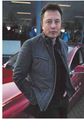
Islam extremist Tommy Robinson and called British Prime Minister Keir Starmer's government "tyrannical", claiming Starmer should be in prison. Scholz has said it's important to "stay cool" over personal attacks, but that Germany's way forward "will not be decided by the owners of social media channels" but by German voters. Asked on Friday about Musk's interventions, he said it's important to "criticise the

PTI ■ BERLIN German Chancellor Olaf Scholz said Friday that Elon Musk's support for the far-right in Europe is "completely unacceptable", adding to his previous criticism of Musk's interventions in the German election campaign. Musk has said over the past month that only the far-right party Alternative for Germany, or AfD, can "save Germany". Last week, the tech billionaire livestreamed on his social media platform X a chat with Alice Weidel, the party's candidate for chancellor in Germany's February 23 election, amplifying its message ahead of the vote. His interest in Germany and politics elsewhere in Europe, after he poured money and energy into helping Donald Trump win the US election, has set off alarm bells among politicians across the continent. The Tesla and SpaceX chief executive has also demanded the release of jailed UK anti-