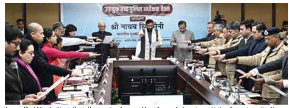
Haryana Chief Minister Nayab Singh Saini reading the preamble of the constitution along with the officers during the 'Hamara Samvidhan-Hamara Swabhiman' programme at Haryana Police Academy, Madhuban, Karnal.

He highlighted that the Deputy Commissioners and Superintendents of Police serve as the face of the government at the grassroots level and that the people of the state have high expectations from them. He urged all officers to work in close coordination to meet these expectations and ensure the efficient implementation of government policies. He also directed them to promote administrative efficiency, ensuring that the benefits of various welfare programs reach the public at the grassroots