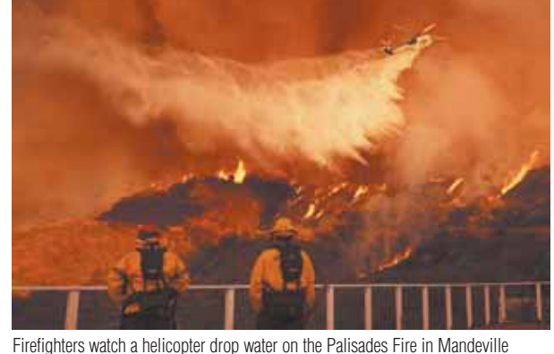
Firefighters watch a helicopter drop water on the Palisades Fire in Mandeville Canyon in Los Angeles, on Saturday.

Pakistani heritage gangs and the police taskforce evidence also shows exploitation and abuse taking place across many different communities and ethnicities. But the data on ethnicity of both perpetrators and victims is still inadequate," Yvette Cooper told MPs. "In order to go much further, I have asked Baroness Louise Casey to oversee a rapid audit of the current scale and nature of gang-based exploitation across the country and to make recommendations on the further work that is needed... It will properly examine ethnicity data and the demographics of the gangs involved and their victims and it will look at the cultural and societal drivers for this type of offending including amongst different ethnic groups," she said. The shadow home secretary, Conservative MP Chris Philp, responded to stress that the authorities had his-