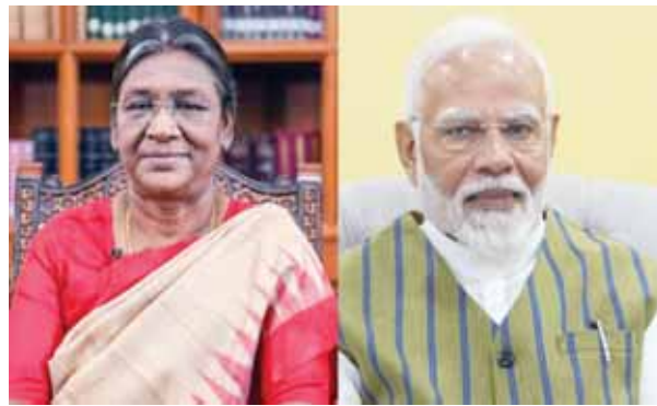
This will continue in the times to come."

their families. In social media posts, he said, "Today, on Army Day, we salute the unwavering courage of the Indian Army, which stands as the sentinel of our nation's security. We also remember the sacrifices made by the brave hearts who ensure the safety of crores of Indians every day." The Indian Army, he said, epitomises determination, professionalism and dedication. In addition to safeguarding our borders, it has made a mark in providing humanitarian help during natural disasters, he added. He said, "Our government is committed to the welfare of the armed forces and their families. Over the years, we have introduced several reforms and focused on modernisation.