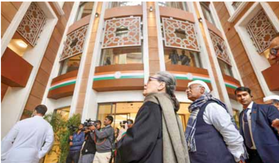
Congress President Mallikarjun Kharge with Congress Parliamentary Party chairperson Sonia Gandhi during the inauguration of the new All India Congress Committee (AICC) headquarters 'Indira Bhawan', in New Delhi

opposition in the Lok Sabha also hit out at the Election Commission and alleged that there is a "serious problem" with the country's election system. "It is the duty of the EC to ensure transparency in elections. If there is an increase of one crore in (the number of) voters in Lok Sabha and Vidhan Sabha in Maharashtra, it is the duty and sacred responsibility of the EC to show us exactly why this has happened. There is a serious problem with our election system," Rahul said. Nadda who is also Union Health Minister in Narendra Modi cabinet said Congress' ugly truth now stands exposed by their own leader. Everything he has done or said has been in the direction of breaking India and dividing our society, Nadda alleged. Sitharaman said the LoP, who was sworn in by taking oath on the Constitution, is now saying