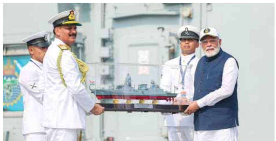
Prime Minister Narendra Modi with Chief of the Naval Staff Admiral Dinesh K. Tripathi during the commissioning ceremony of three Indian Navy warships INS Surat, INS Nilgiri and INS Vaghsheer, at the Naval Dockyard in Mumbai

SENSEX 76,724.08 ↑ +0.29% 12:00 pm 3:00 pm Prev close 76,499.63 1 US$ = 86.40 INR