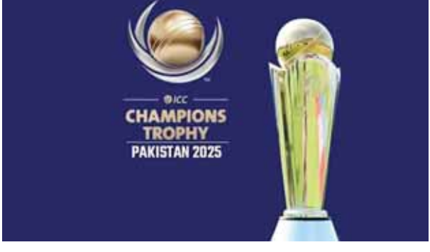
issue visas to all captains, players and team officials who will come here for pre-tournament events. "This obviously includes Rohit or any other Indian team player or official or board official," he added. Another source confirmed to PTI that the PCB has made it clear to the ICC that the opening ceremony, featuring all teams and their captains, will take place in Pakistan. "This is in line with the usual protocols and since the

PTI ■ LAHORE The opening ceremony of the Champions Trophy will be held either on February 16 or 17 and the Pakistan Cricket Board (PCB) is confident that India captain Rohit Sharma will be in attendance at the event. The PCB source also said that it is awaiting communication from the ICC on the schedule of the customary captains' photo-shoot and the pre-event press conference. The eight-team tournament will get underway on February 19 in Karachi. However, India will play all their matches in Dubai, starting with the clash against Bangladesh on February 20, after refusing to travel to Pakistan owing to security concerns. The source said PCB has procured all relevant clearances from its government to promptly