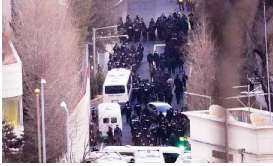
Investigators from the state anti-corruption agency and police officers make their way to the residence of impeached President Yoon Suk Yeol to execute a warrant to detain Yoon in Seoul, South Korea on Wednesday.

tion of martial law December 3 as a legitimate act of governance against an "anti-state" opposition employing its legislative majority to thwart his agenda.