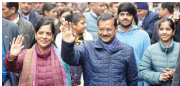
AAP National Convener Arvind Kejriwal file his nomination for Delhi Assembly polls.