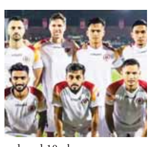
reduced 10 players. In an emotional plea to the sports minister, East Bengal highlighted how the "refugees club" tag has led to their ongoing marginalisation in Indian football. "Fight, Fight and Fight -- this has been the perennial motto of East Bengal club for the last 150 years. This club and its supporters have endured the tumultuous period pre and post-partition only through its fighting spirit. "While the displaced people fought tooth and nail for their substance, the club had to