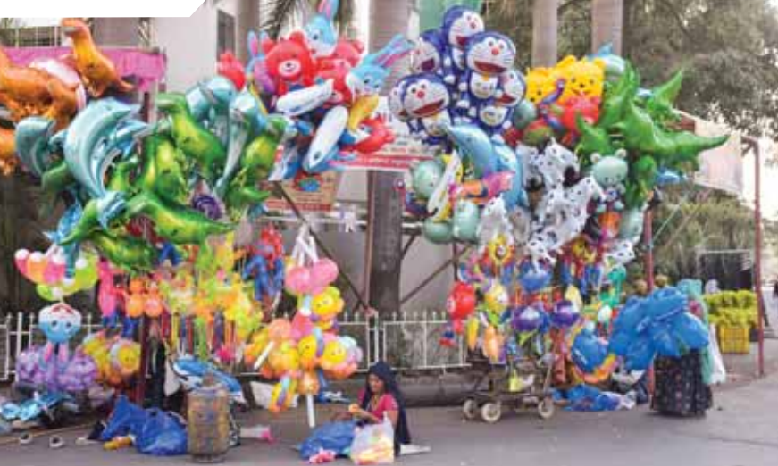
A vendor sells balloons, at the roadside in Surat