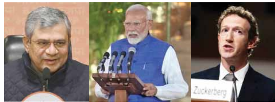
(Left to right): Ashwini Vaishnaw, PM Narendra Modi taking oath in June 2024 and Mark Zuckerberg