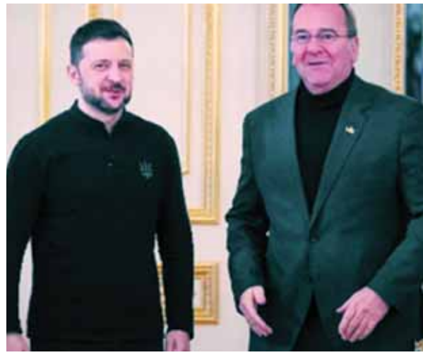
Ukrainian President Volodymyr Zelensky, left, and German Defence Minister Boris Pistorius greet each other in Kyiv, Ukraine, Tuesday.

PTI ■ KYIV Ukrainian President Volodymyr Zelensky said that he has held further discussions with French President Emmanuel Macron about the possibility of Western troops deploying in Ukraine to safeguard any peace deal ending the nearly three-year war with Russia. Zelensky's disclosure came before an official visit to Kyiv on Tuesday by German Defence Minister Boris Pistorius. He arrived in Kyiv on an unannounced visit following a meeting in Warsaw on Monday with his counterparts from France, the United Kingdom, Italy and Poland. Germany and the four other countries are Europe's five top military spenders. Pistorius told German news agency dpa that his visit to Kyiv aims to underscore Germany's strong support for Ukraine at a time when US President-elect Donald Trump's term beginning next week looks set to bring deep changes to Washington's policy on the war. Pistorius said that his visit "is a signal that Germany, as the biggest NATO country in Europe, stands by Ukraine — not alone, but with the group of five and many other allies." Trump has criticised the cost