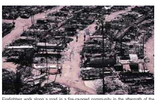
Firefighters walk along a road in a fire-ravaged community in the aftermath of the Palisades Fire in the Pacific Palisades neighborhood of Los Angeles, Monday.

Los Angeles (PTI): Additional water tankers and scores of firefighters arrived at the Los Angeles area on Monday ahead of fierce winds that were forecast to return and threaten the progress made so far on two massive infernos that have destroyed thousands of homes and killed at least 24 people. Planes doused homes and hillsides with bright pink fire-retardant chemicals, while crews and fire engines were being placed near particularly vulnerable spots with dry brush. Dozens of water trucks rolled in to replenish supplies after hydrants ran dry last week when the two largest fires erupted. Tabitha Trosen and her boyfriend said she feels like they are "teetering" on the edge with the constant fear that their neighbourhood