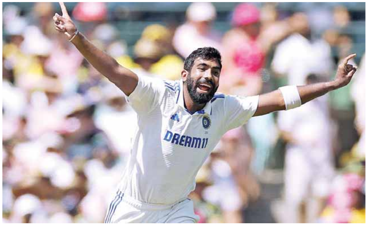
bowler to take 200 Test wickets at an average below 20.

PTI ■ DUBAI India pace spearhead Jasprit Bumrah was on Tuesday named ICC Men's Player of the Month for December 2024 after his sensational performance during the recent tour of Australia for the Border-Gavaskar Trophy. Leading India's attack single-handedly, Bumrah relentlessly kept Australian batsmen under intense pressure, claiming 22 wickets in three Tests in December last year at an outstanding average of 14.22. He ended with 32 wickets in the five-match series which concluded on January 5. The first match was played in November. His match-winning contributions included a nine-wicket haul in Brisbane and a five-wicket display in Melbourne as he edged out Australian skipper Pat Cummins and South African Dane Paterson for the award, stated the ICC. He also reached a significant milestone, becoming the first