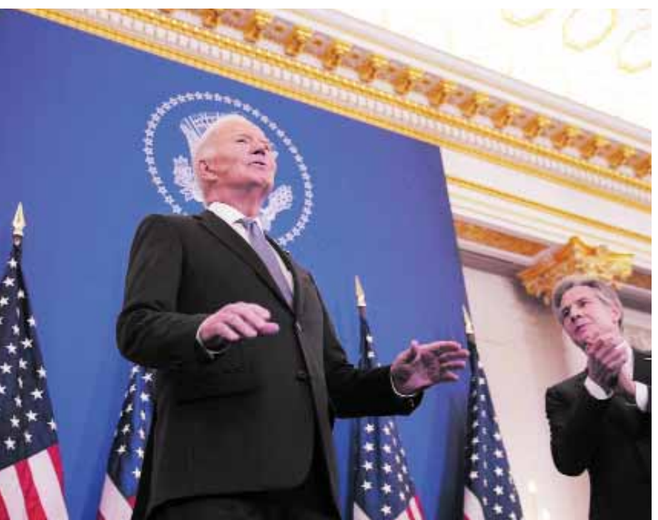
President Joe Biden, left, standing next to Secretary of State Antony Blinken, right, tells the audience to sit as he gets a standing ovation before making a speech about foreign policy at the State Department in Washington, Monday.