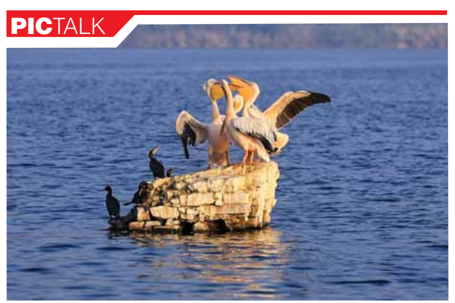
Flocks of pelicans and cormorants congregate at Man Sagar Lake, in Jaipui

grammes tailored to their interests and career aspirations. Studying in India provides an unparalleled opportunity to experience its rich cultural heritage, traditions and diversity. Globally, countries like the US and the UK have long-established student visa frameworks that have attracted millions of international learners. The US for example offers the F-1 visa for academic students and the M-1 visa for vocational or technical students. These visas allow students to work part-time on campus and participate in Optional Practical Training (OPT) programmes, enabling them to gain work experience in their field of study. The UK's Tier 4 student visa permits full-time study and part-time work during term time. Post-study work options, such as the Graduate Route, allow students to stay and work in the UK for two years after graduation. India's introduction of specialised student visa categories is a strategic move to position itself as a global education hub. By simplifying the visa process, the country is poised to attract a significant number of international students. With affordable fee structure, India can attract good number of students from across the world. However, a lot more needs to be done in terms of quality of education and infrastructure. University campuses that are foreign student friendly will go a long way in making India an international education hub.