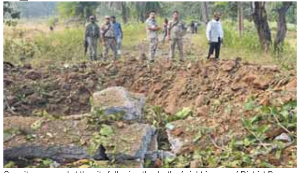
Security personnel at the site following the death of eight jawans of District Reserve Guards (DRG) and a civilian driver after Naxals blew up their vehicle with an

hunt down those responsible for the killings, the IPS officer involved in an anti-Naxalite informed. The personnel targeted by Left-