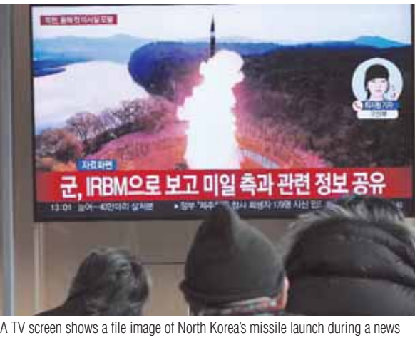
A TV screen shows a file image of North Korea's missile launch during a news

Japan's Defence Ministry said the missile landed outside its exclusive economic zone and that there were no reports of