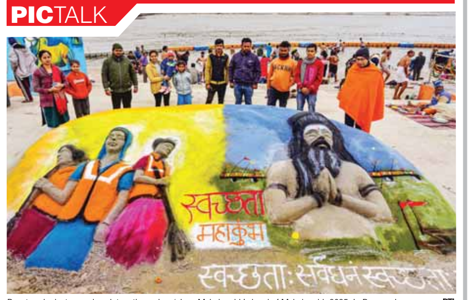
Devotees look at a sand sculpture themed on 'clean Mahakumbh' ahead of Mahakumbh 2025, in Prayagraj

Wishing all our readers a very happy new year!