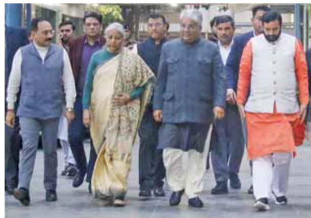
Union Ministers Nirmala Sitharaman, Bhupender Yadav, Haryana CM Nayab Saini and other BJP leaders after meeting the Election Commission of India