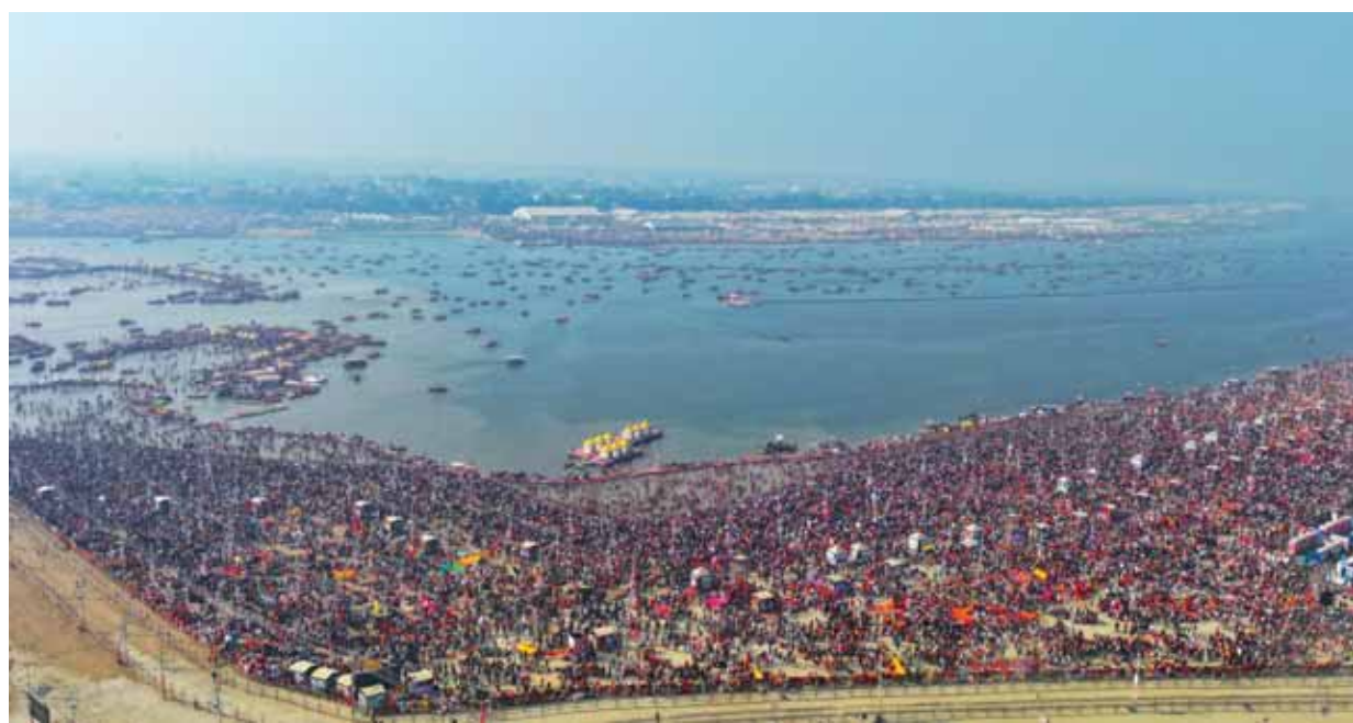
Devotees arrive for a holy dip at Sangam, on the eve of the 'Mauni Amavasya' or new moon day during the Mahakumbh festival in Prayagraj, UP