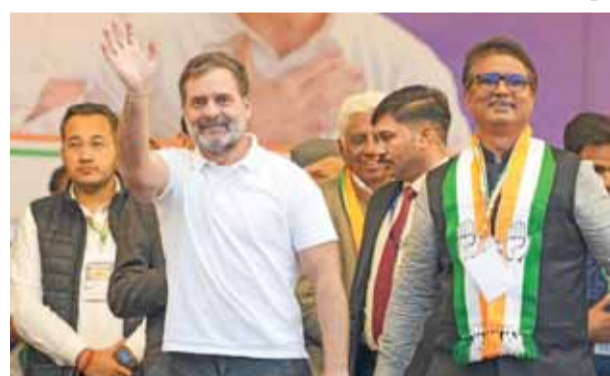
LoP in the Lok Sabha and Congress leader Rahul Gandhi with party candidate Anil Choudhary during a rally for the upcoming Delhi Assembly elections, at Patparganj in New Delhi