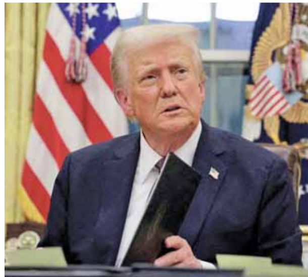
■ WASHINGTON

The United States will impose tariffs on the countries that "harm" America, President Donald Trump has said, as he named China, India and Brazil as high-tariff countries. "We're going to put tariffs on outside countries and outside people that really mean harm to us. Well, they mean us harm, but they basically want to make their country good," Trump told House Republicans at a Florida retreat on Monday, the first after he became the president for the second term last week. "Look at what others do. China is a tremendous tariff maker, and India and Brazil and so many other countries. So we're not going to let that happen any longer because we're going to put America first," he said.