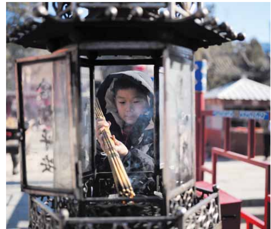
A boy lights incense inside Dongyue Temple ahead of Lunar New Year in Beijing on Tuesday.

Moscow's scorched-earth intervention in support of Assad once turned the tide of Syria's civil war. Syria's new authorities have not cut off relations with Moscow or forced a complete exit of Russian military forces from bases in Syria, but earlier this month, Al Watan reported that a contract with a Russian company to manage the port in Tartous had been cancelled. Following Assad's downfall, Russia relocated its troops and assets from all over Syria to its main hub at the Hmeimim air base near Latakia. There has been no indication that Moscow was preparing to evacuate the Hmeimim base or the naval facility in Tartous altogether. The termination of a contract for a Russian company to modernise the Tartous commercial port did not directly impact the Russian naval facility, which was leased under a separate deal.