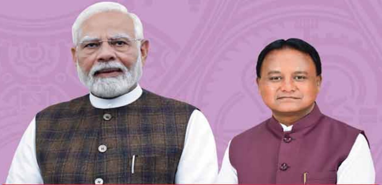
Shri Narendra Modi Prime Minister

The Utkarsh Odisha – Make in Odisha Conclave 2025 concludes today with a momentous ceremony led by the Hon'ble Chief Minister. As he felicitates 60 exceptional entrepreneurs under the age of 40, recognizing their potential as the next generation of Odia industry leaders, this event heralds the dawn of a new era in industrial development.