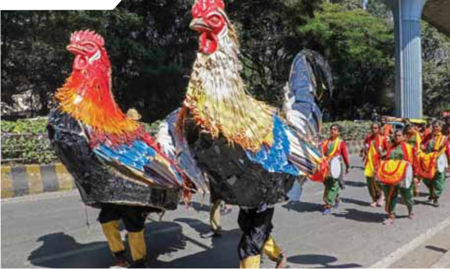
Folk artists take part in a procession on the eve of the unveiling of 'Bhuvaneshwari Devi' statue, in Bengaluru