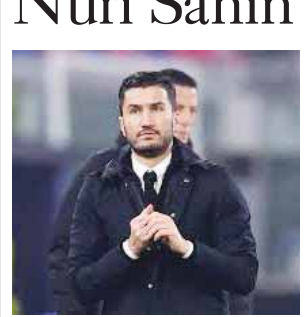
■ DORTMUND

{ m B}^{ m orussia} Dortmund fired coach Nuri Sahin on Wednesday, a day after its 2-1 loss to Bologna in the Champions League.