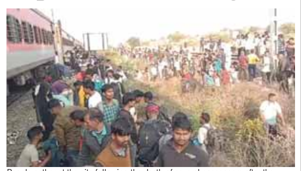
stepped down due to a rumour of fire and were run over by another train