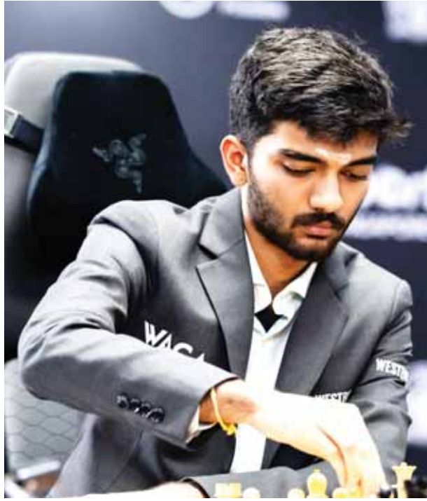
who is perceived as a strong opponent at all levels. With black, Gukesh was

was necessary to put up resistance and Praggnanandhaa made the most of it to emerge victorious. Erigaisi pressed hard against local hero Anish Giri, who was almost winning against Gukesh in the opening round. The battle took a steep turn with both players fighting for advantage in the rook and knight endgame but as it turned out, the draw was a result that most experts expected. Fabiano Caruana was the player of the day as he gradually crushed second best Dutchman Jorden van Foreest right from the early middle game. It was an innocuous London system that Caruana started with and then capitalised on an unforced error to win a pawn which proved decisive. Earlier, after a tension filled game against Giri, Gukesh relaxed with his black pieces and was never in any problem against Fedoseev,