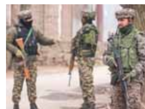
Security personnel stand guard near the site of the encounter, at Gujjarpat area in Sopore, Baramulla district of Jammu and Kashmir

corner of Odisha is rich in mineral resources, for which it is the treasure trove of natural wealth," said Majhi. Odisha's contribution to India's economic prosperity is unparalleled. There is a possibility of the much-needed and scarce lithium reserve which would be good for the e-battery industry. Unfortunately, till now, the true potential of Odisha has not been found due to many reasons including political will. All these