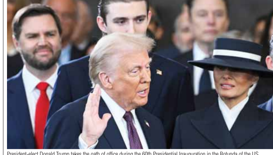
President-elect Donald Trump takes the oath of office during the 60th Presidential Inauguration in the Rotunda of the US Capitol in Washington